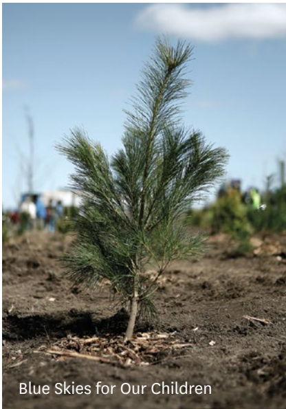
Blue Skies for Our Children