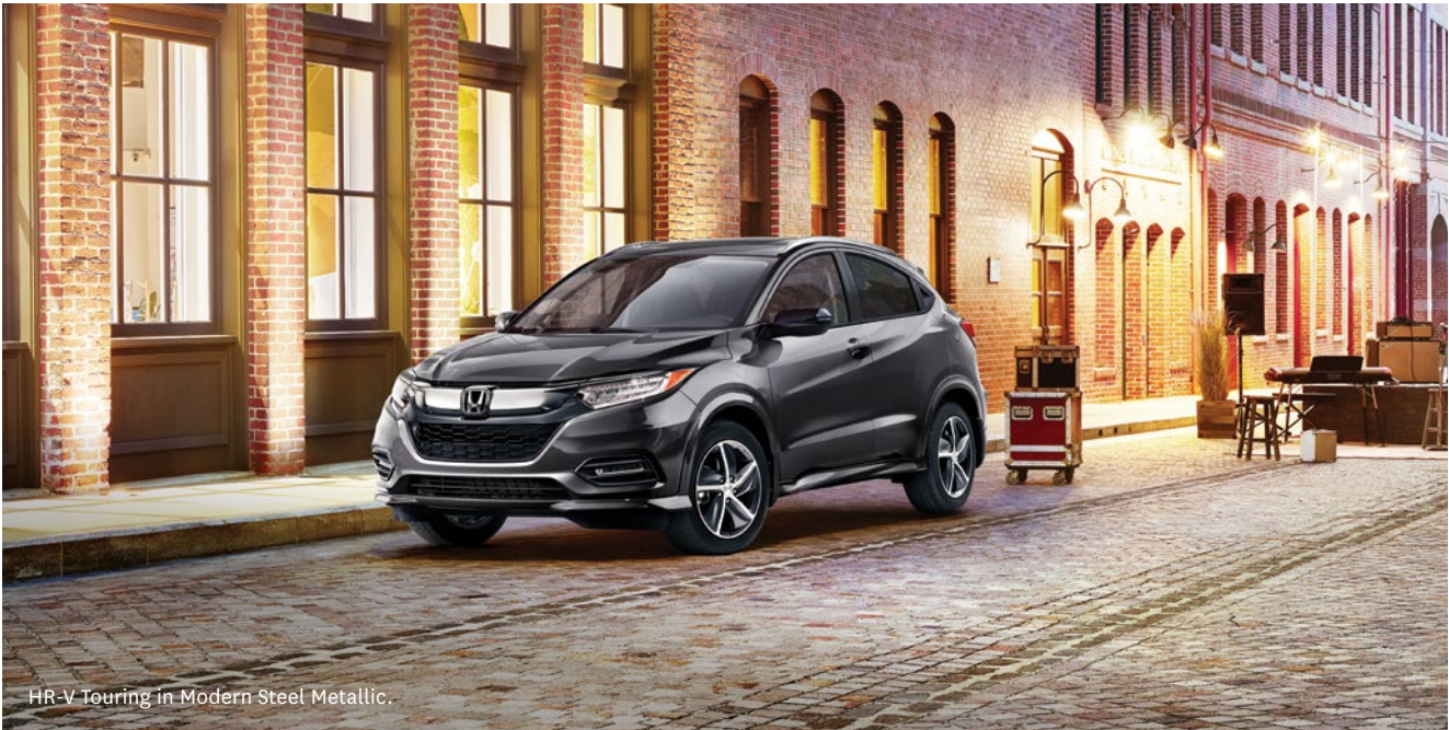
HR-V Touring in Modern Steel Metallic.