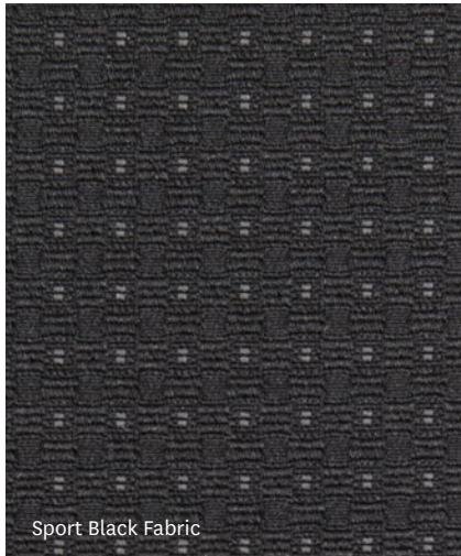
Sport Black Fabric