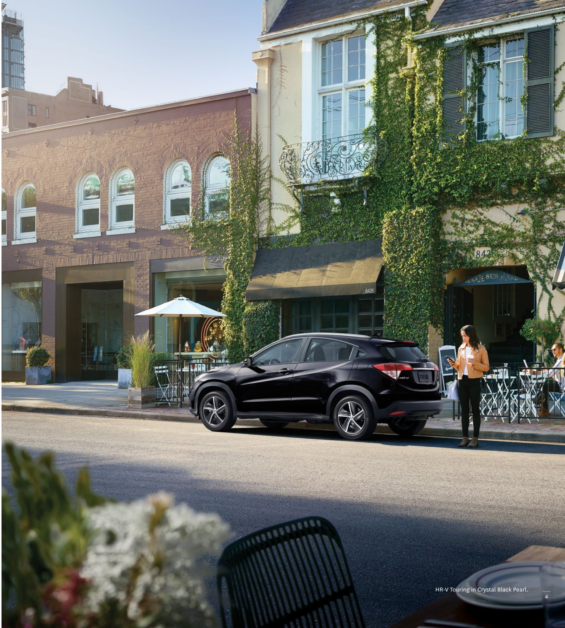
HR-V Touring in Crystal Black Pearl.