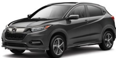
Modern Steel Metallic