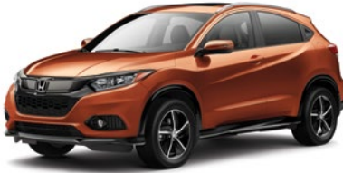
Orange Burst Metallic