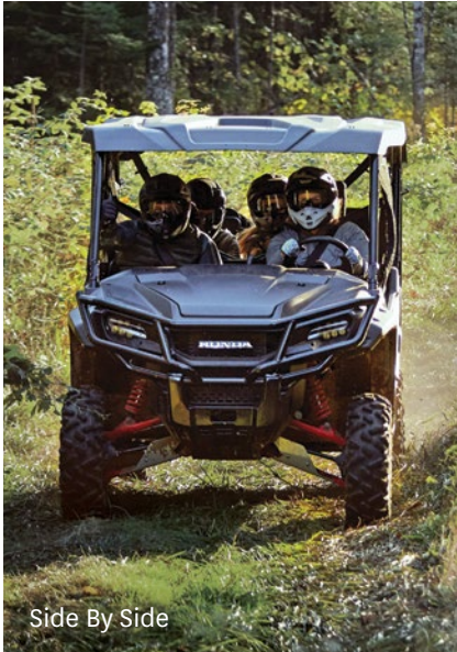
Side By Side