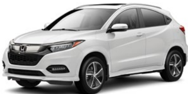
Platinum White Pearl