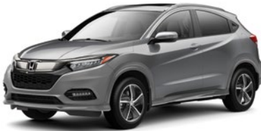
Lunar Silver Metallic