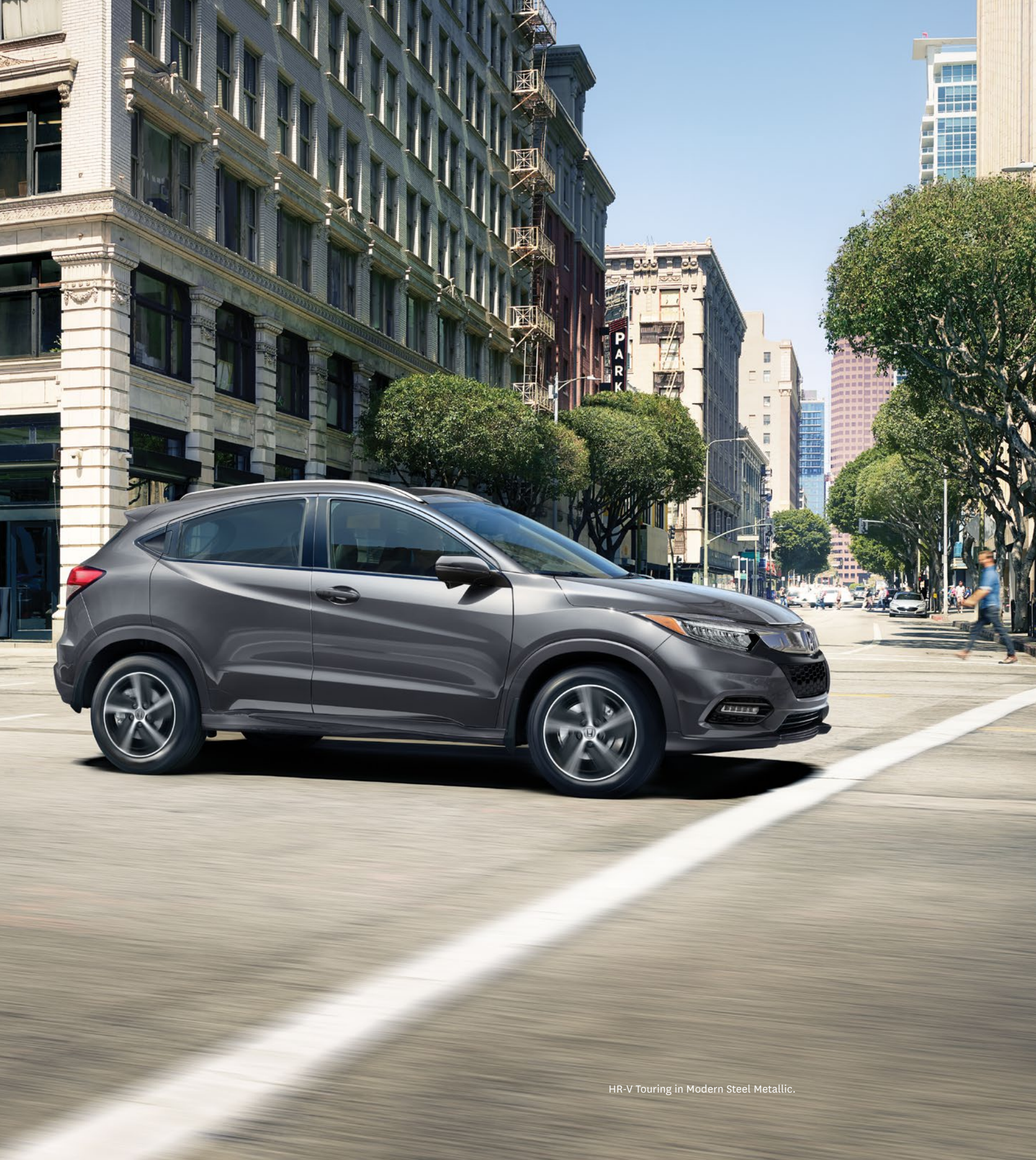
HR-V Touring in Modern Steel Metallic.