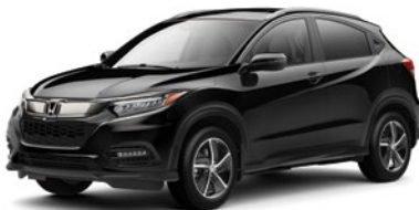
Crystal Black Pearl