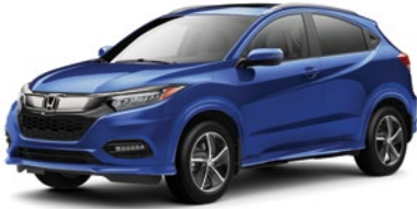
Aegean Blue Metallic