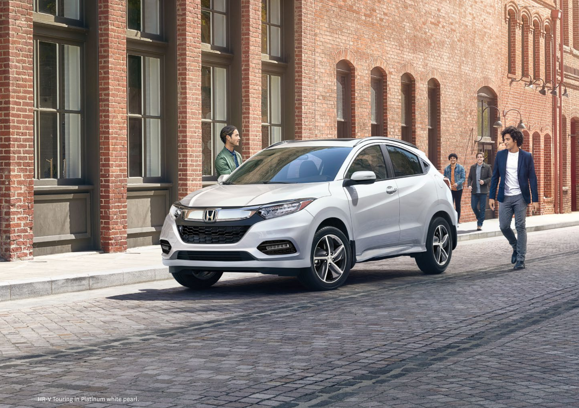
HR-V Touring in Platinum white pearl.