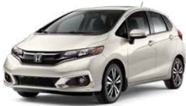
Platinum White Pearl