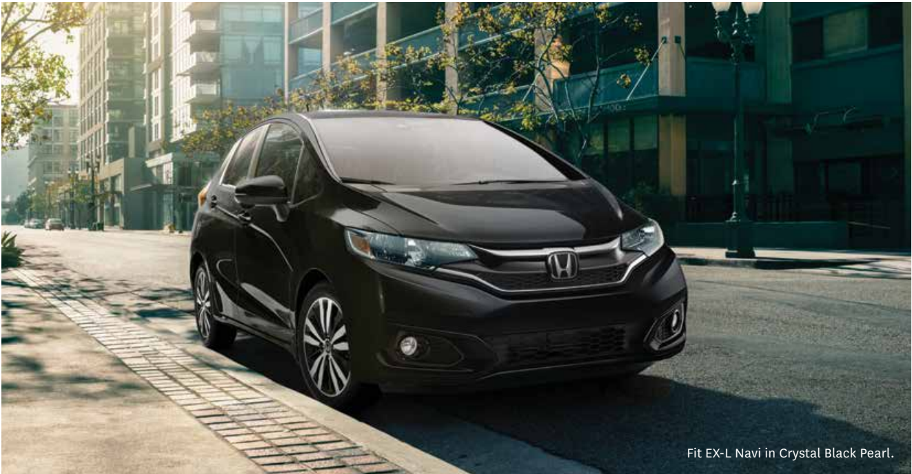
Fit EX-L Navi in Crystal Black Pearl.