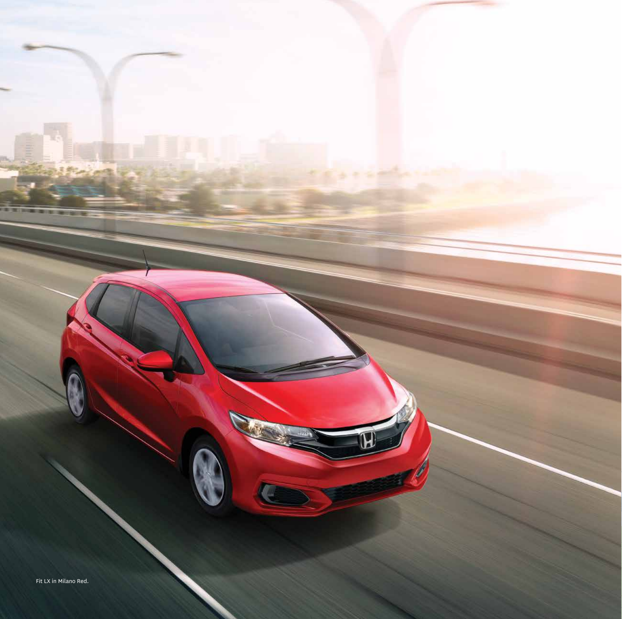
Fit LX in Milano Red.