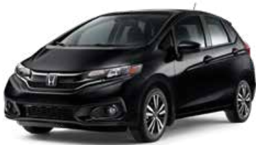
Crystal Black Pearl