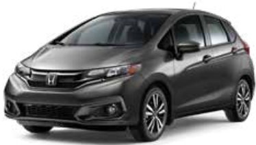
Modern Steel Metallic