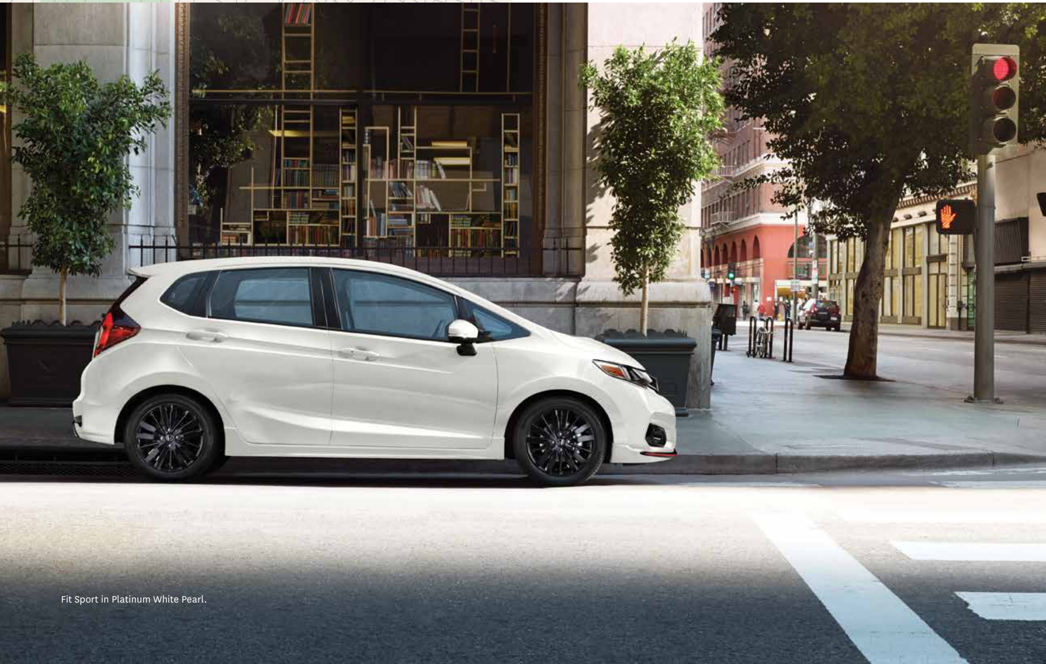
Fit Sport in Platinum White Pearl.