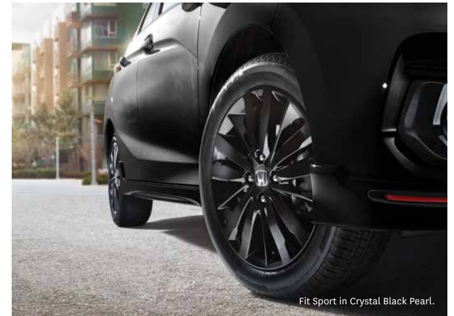
Fit Sport in Crystal Black Pearl.