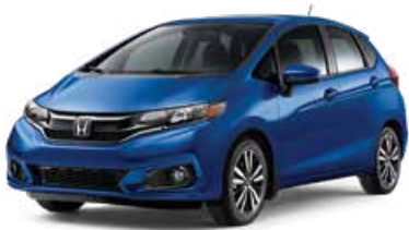
Aegean Blue Metallic