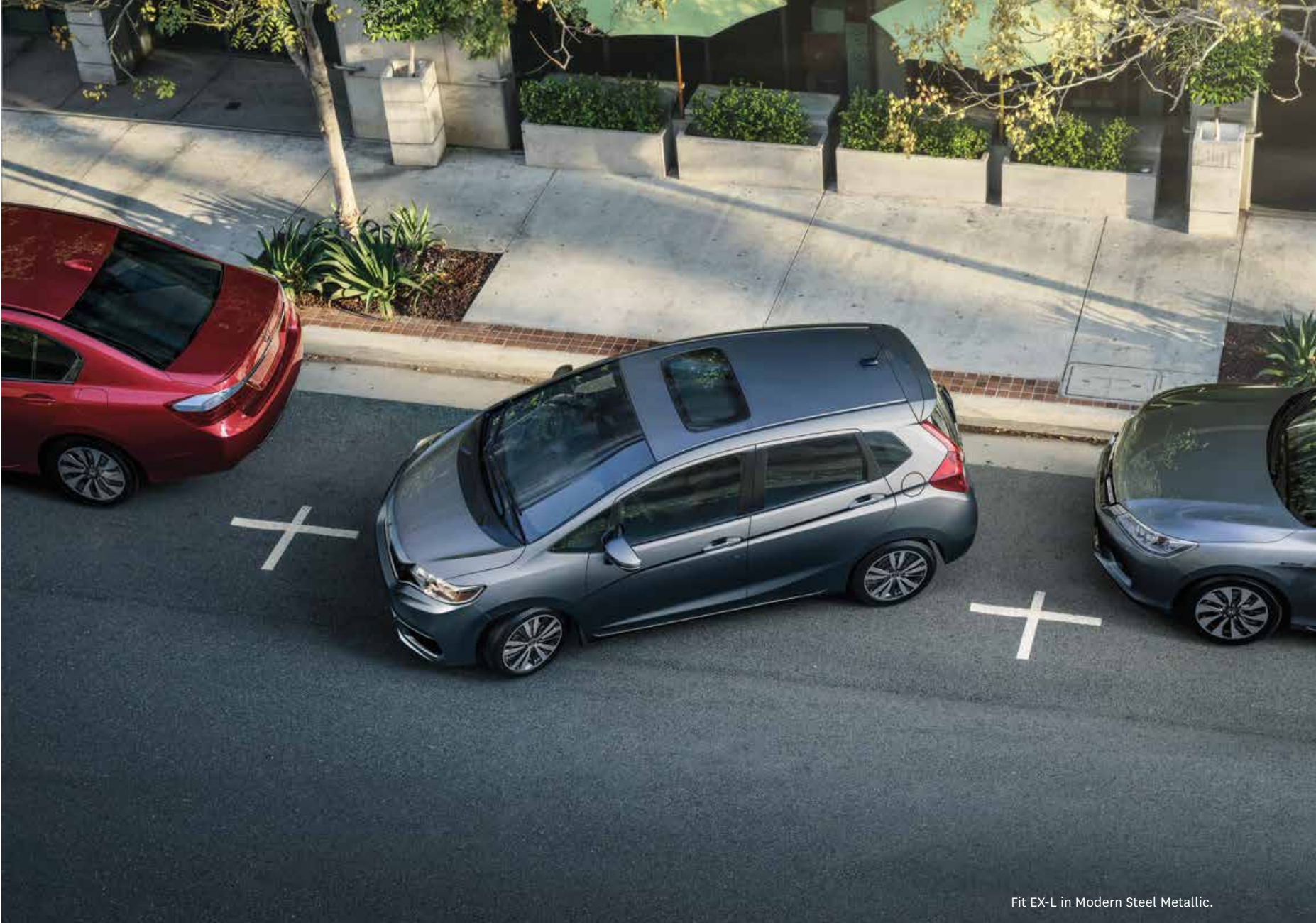
Fit EX-L in Modern Steel Metallic.