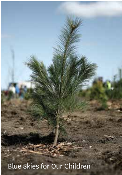
Blue Skies for Our Children