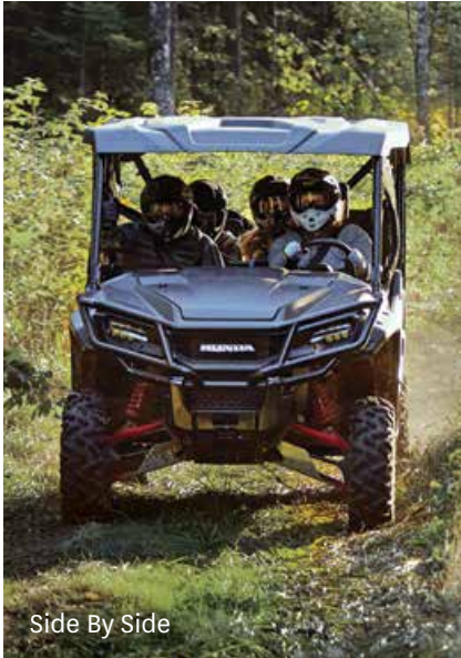
Side By Side