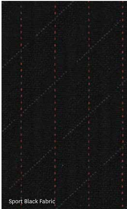
Sport Black Fabric