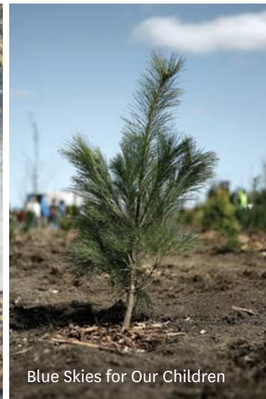
Blue Skies for Our Children