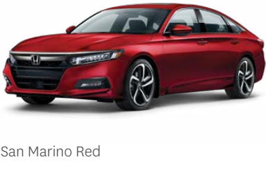
San Marino Red