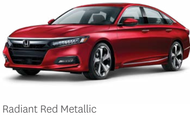
Radiant Red Metallic