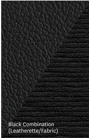
Black Combination (Leatherette/Fabric)

Perception of colour may vary when combined with blazing sun and high speeds.