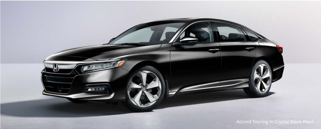
Accord Touring in Crystal Black Pearl.