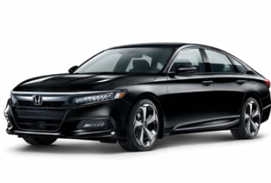
Crystal Black Pearl