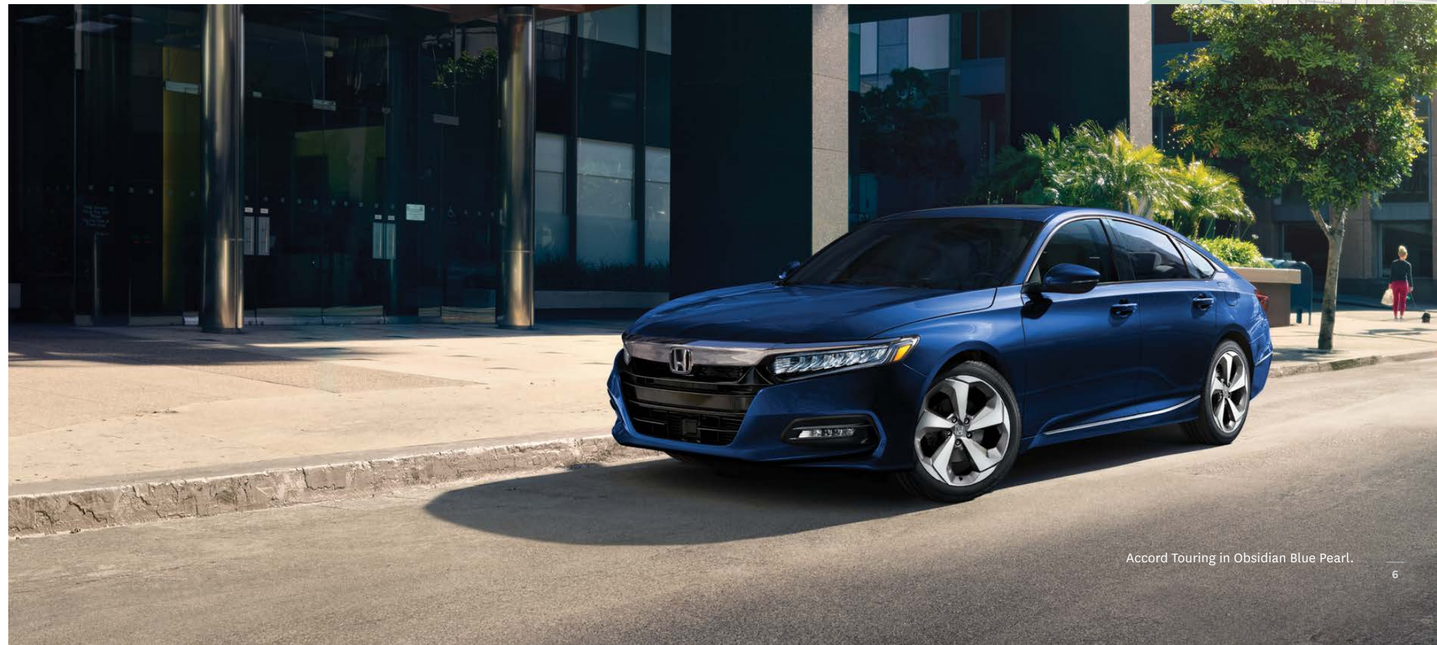
Accord Touring in Obsidian Blue Pearl.