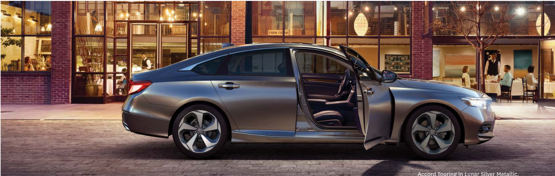
Accord Touring in Lunar Silver Metallic.