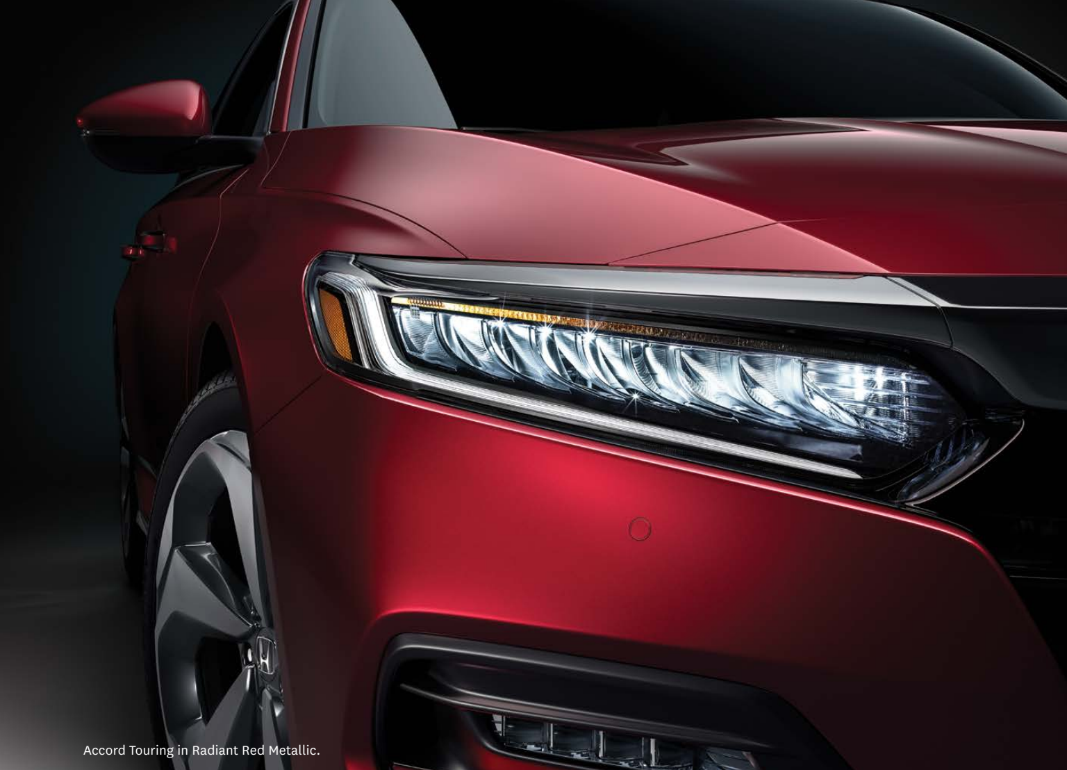
Accord Touring in Radiant Red Metallic.