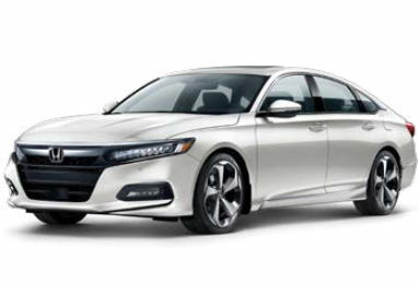
Platinum White Pearl