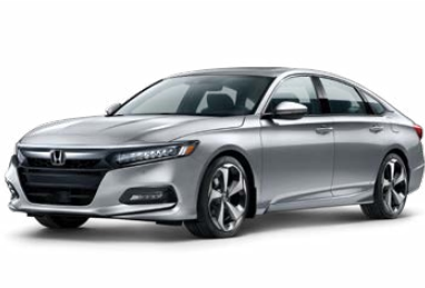
Lunar Silver Metallic