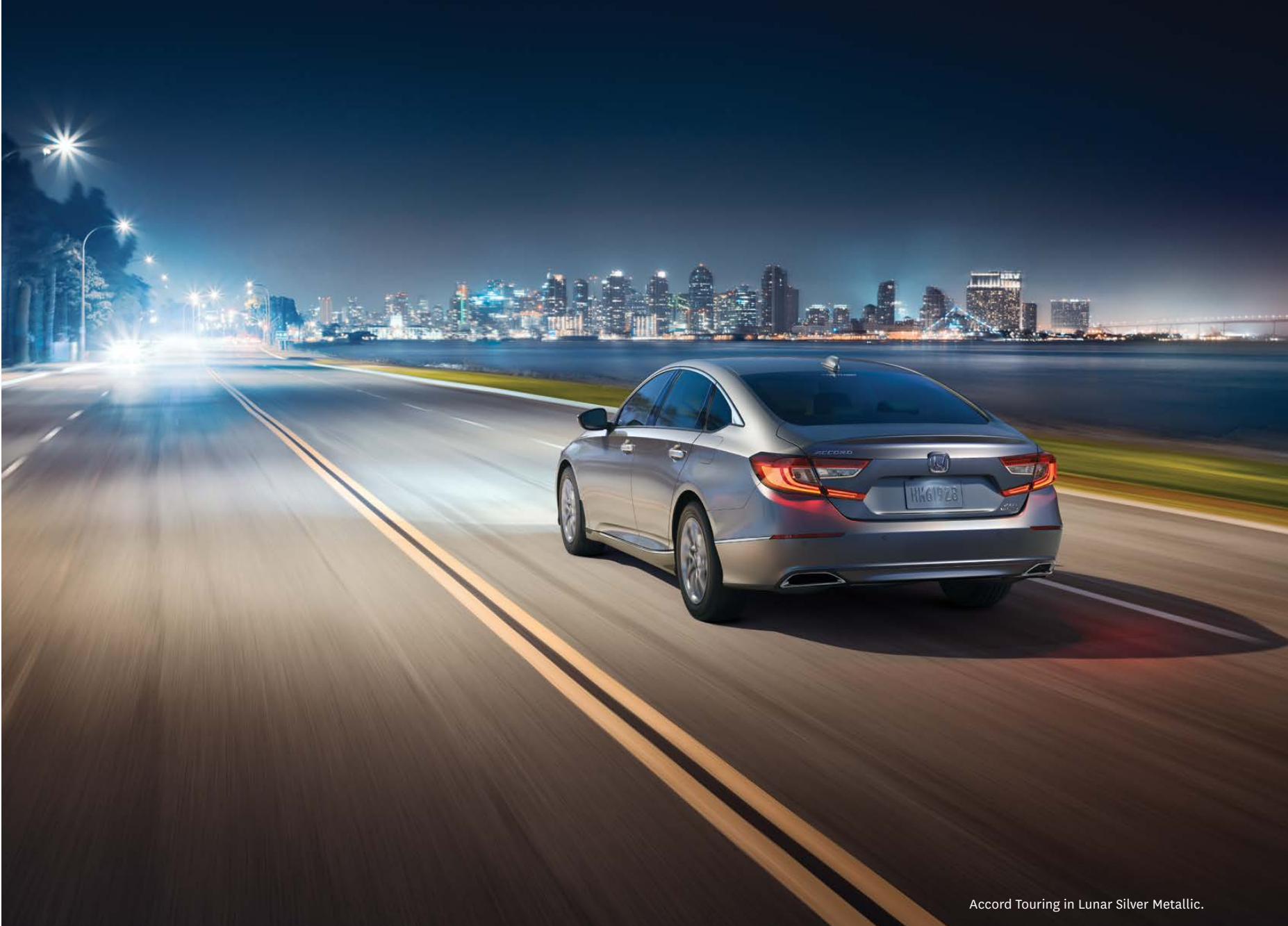
Accord Touring in Lunar Silver Metallic.