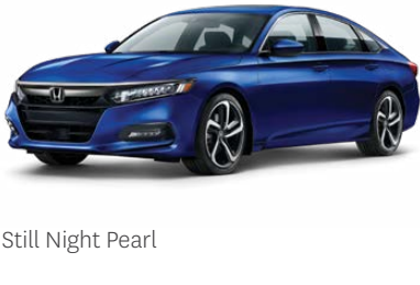
Still Night Pearl