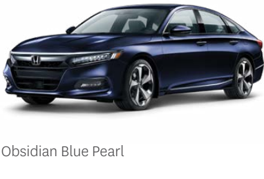
Obsidian Blue Pearl