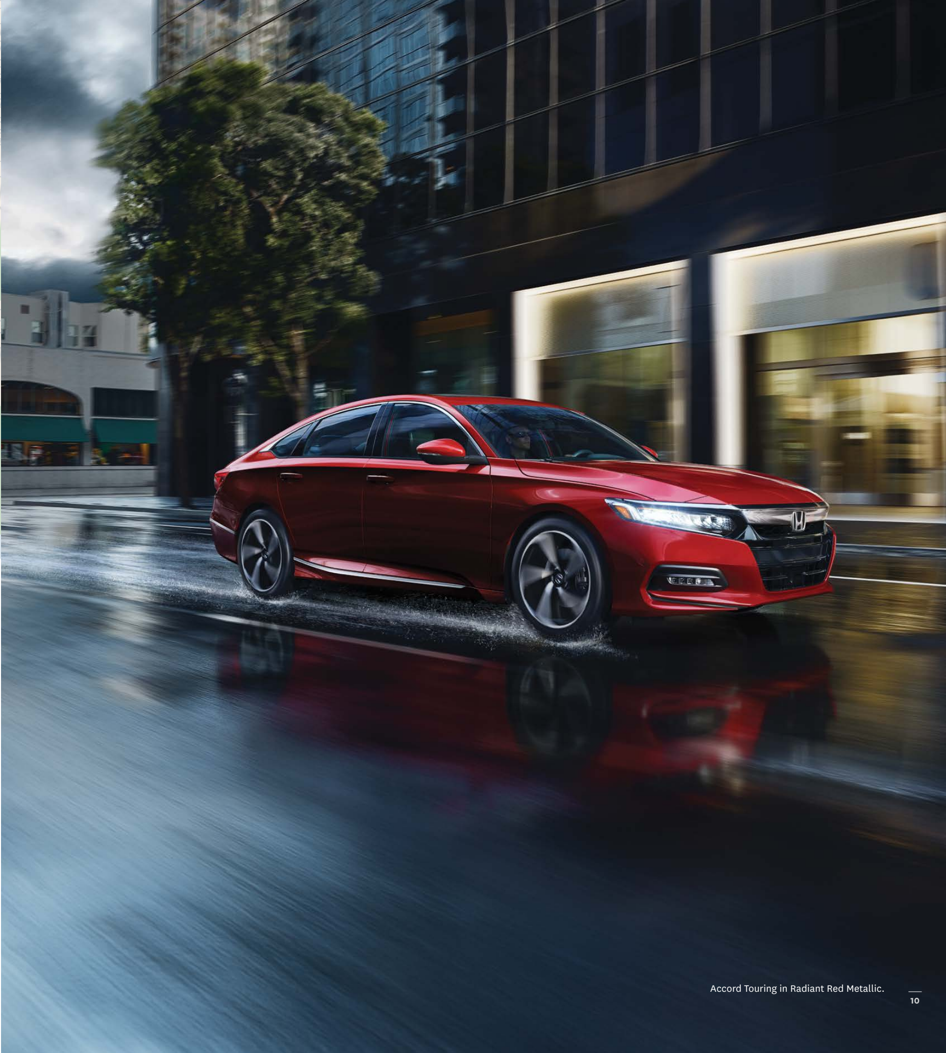
Accord Touring in Radiant Red Metallic.