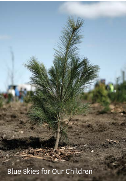
Blue Skies for Our Children