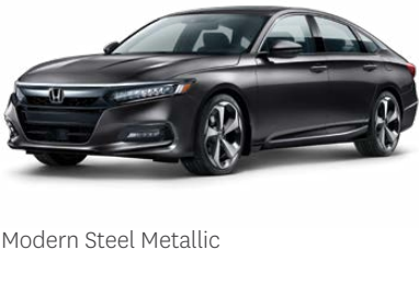
Modern Steel Metallic