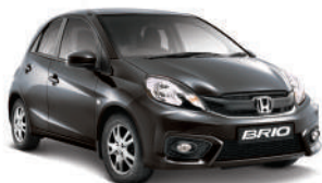
Modern Steel Metallic