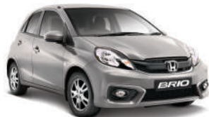
Alabaster Silver Metallic