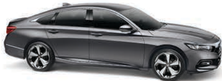
MODERN STEEL METALLIC