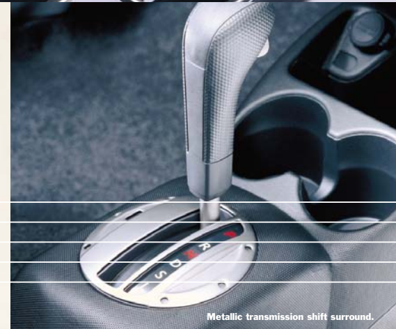
Metallic transmission shift surround.