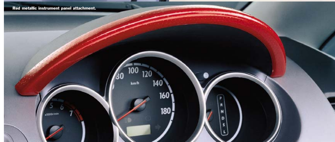
Red metallic instrument panel attachment.