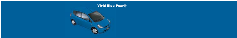
Vivid Blue Pearl†