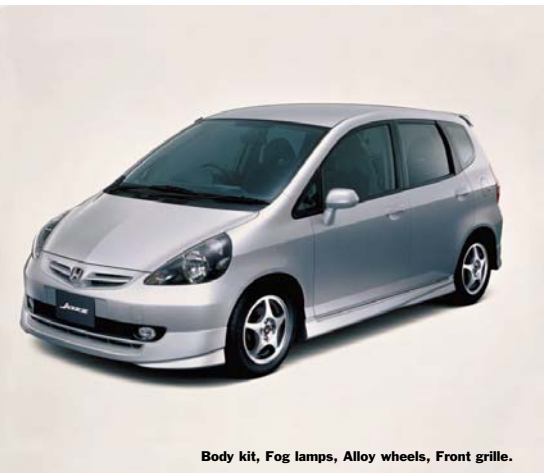
Body kit, Fog lamps, Alloy wheels, Front grille.