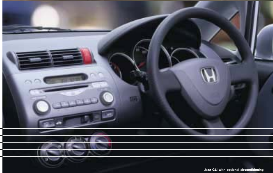
Jazz GLi with optional airconditioning