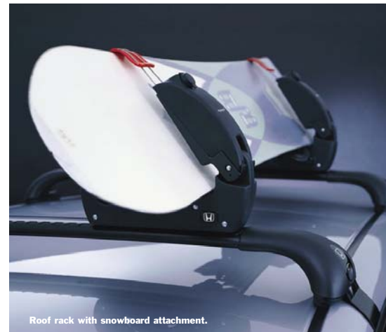
Roof rack with snowboard attachment.

Your Honda Dealer can help you select the accessories for your Jazz and have them installed at the time of purchase. They'll then be fully covered by the 3-year, 100,000 kilometre new car warranty.