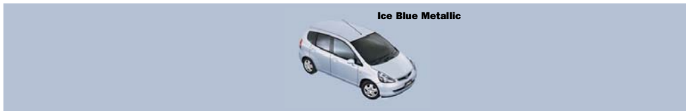
Ice Blue Metallic