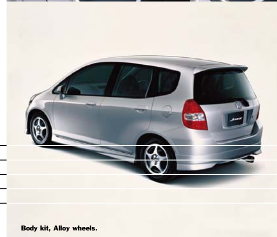
Body kit, Alloy wheels.