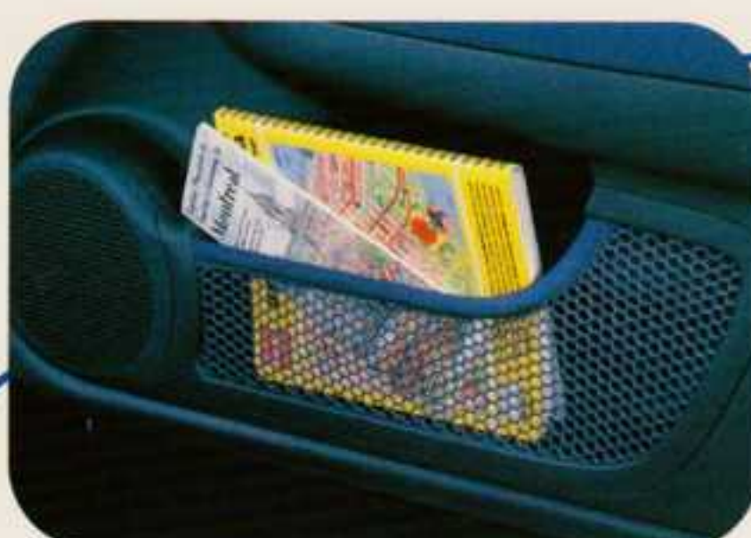
Door net pocket