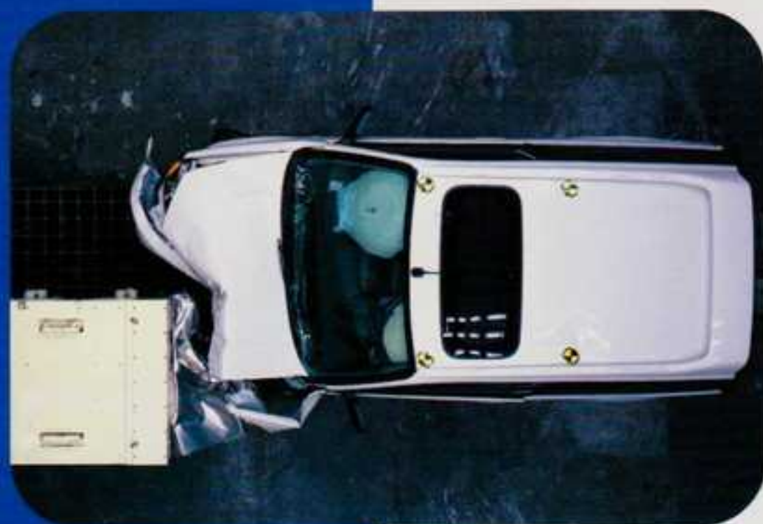
Offset crash test