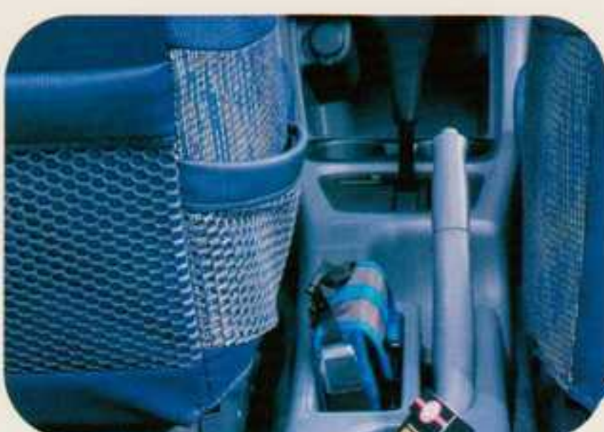
Side seat pocket