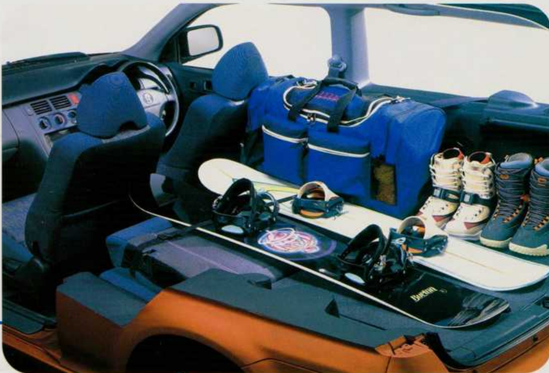
Generous cargo space

There's never been a more civilised way to get away.