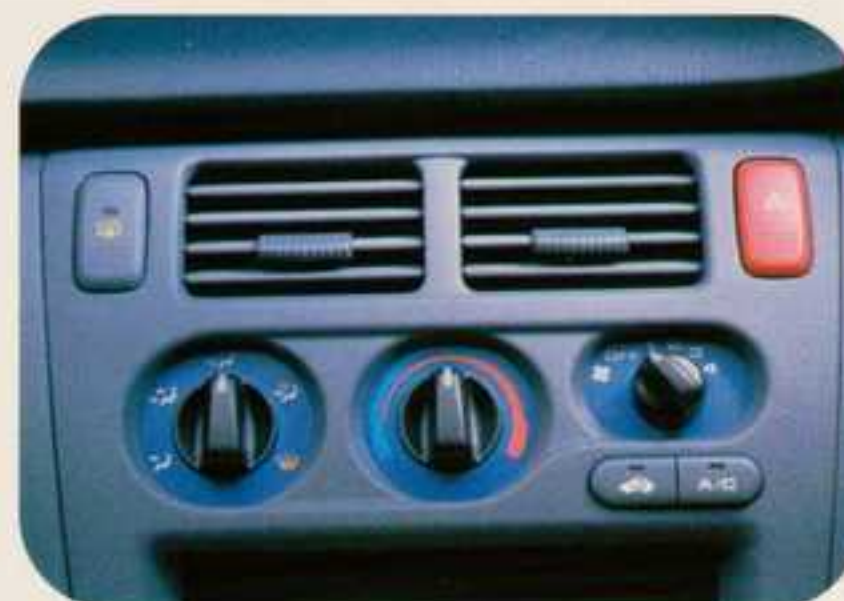
Easy to use controls