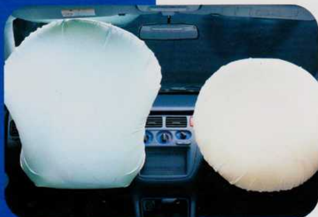
Dual SRS Airbags