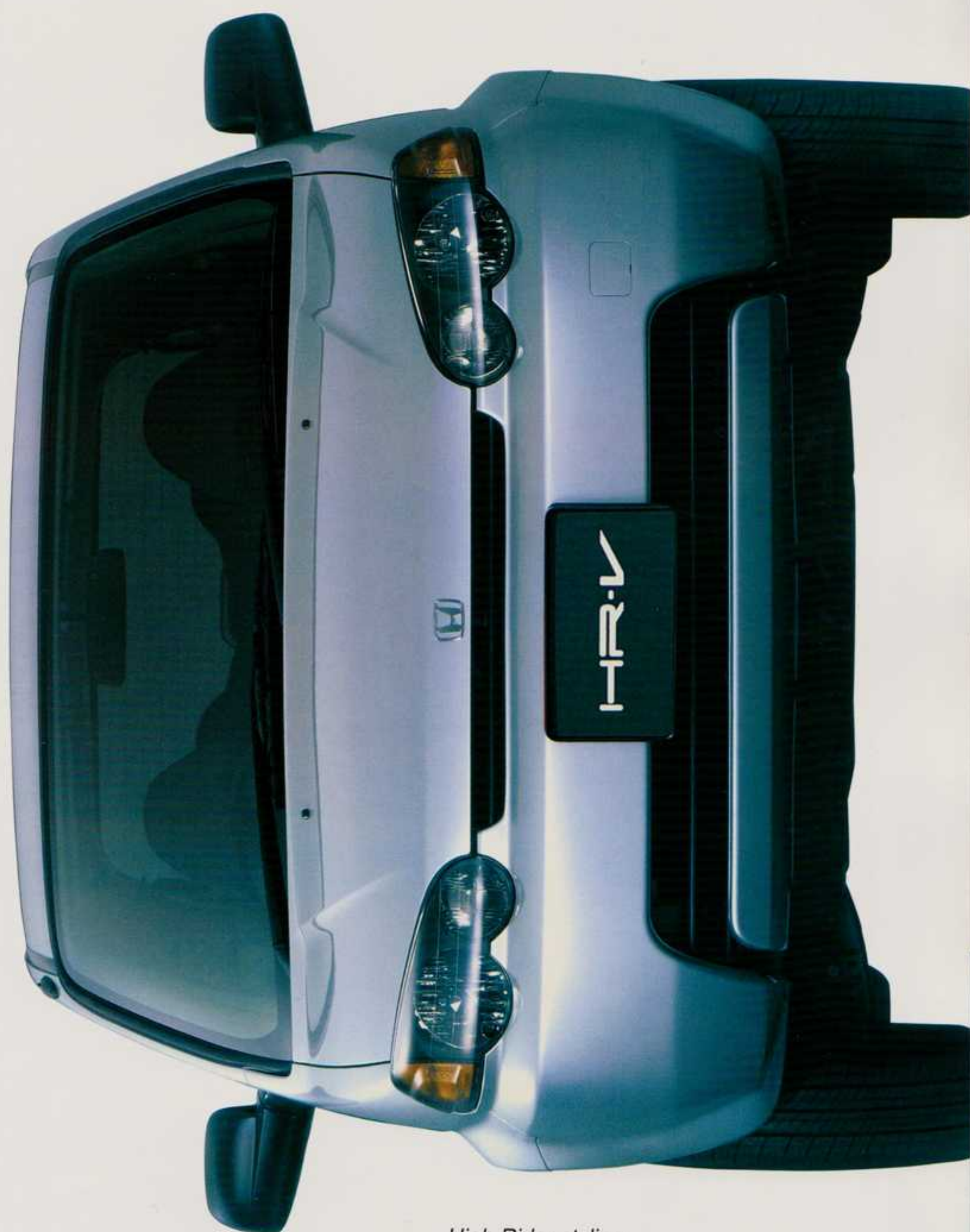
High Rider styling

With Honda's commitment to the environment, the places you love escaping to will be as beautiful in the future as they are now.