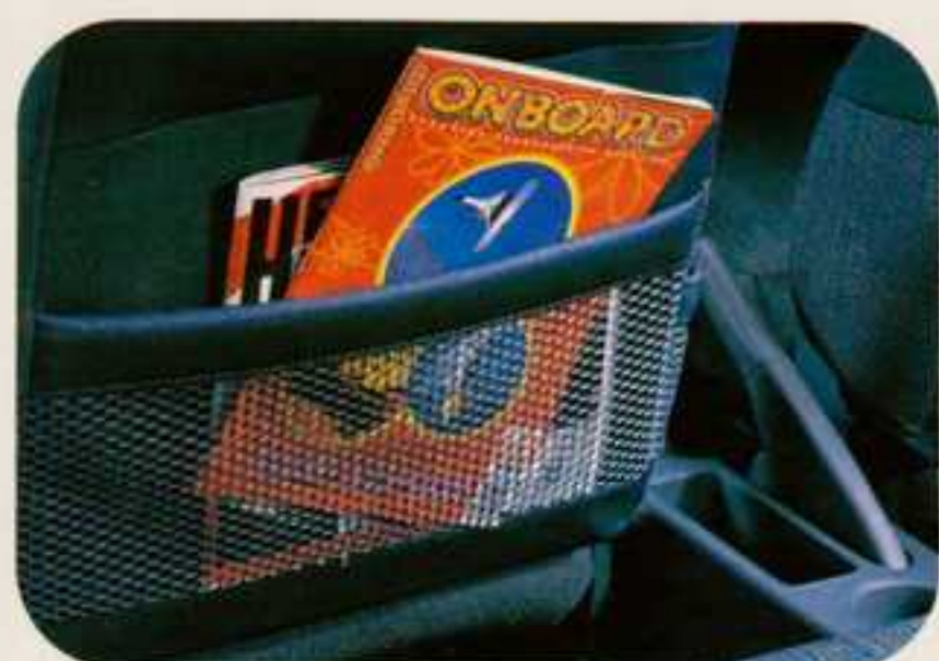
Seat back pocket