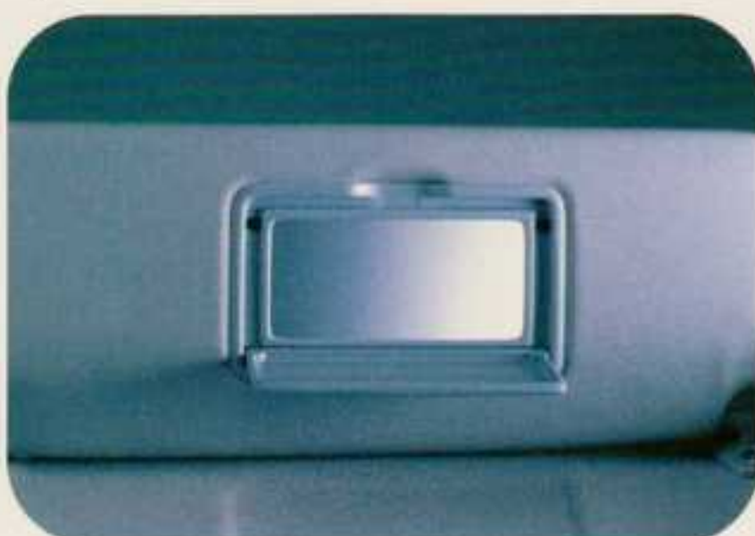
Sunvisor with vanity mirror