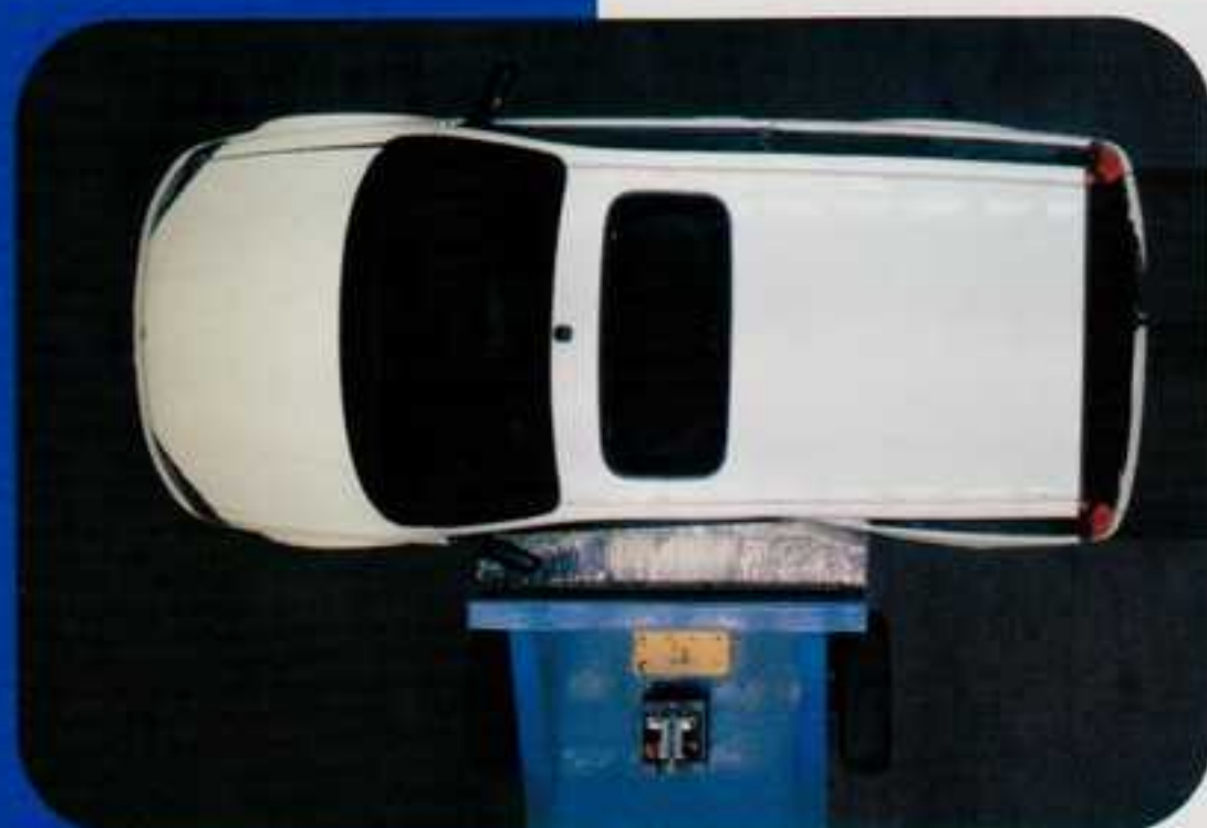
Side impact crash test

This new pedestrian-focused technology reduces the impact of the vehicle in case of a collision with a pedestrian. The bonnet, fender and upper dashboard are designed to absorb impact and the windscreen wipers are designed to pivot upon impact, reducing the chance of pedestrian head injury.