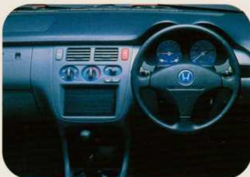
Ergonomic dashboard layout