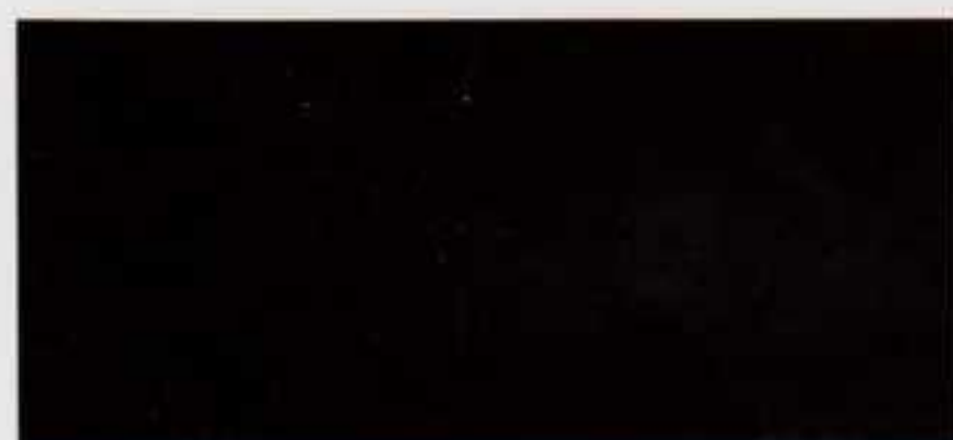
Nighthawk Black Pearl

* Maximum towing weights are based on the ability of the car, with two occupants of 75kg each, to restart on a 12% gradient at sea level. At altitudes in excess of 1500 metres, engine output may drop with a reduction in towing capability. Extra weight, such as additional passengers or luggage, should also be deducted from the maximum towing weight.