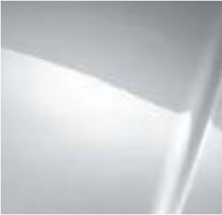
SATIN SILVER METALLIC