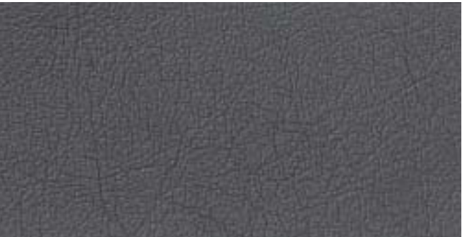
COOL GREY LEATHER