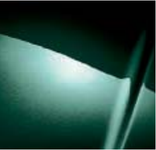
VERMONT GREEN PEARL