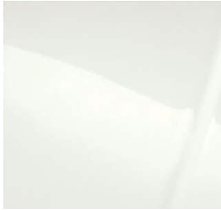
PREMIUM WHITE PEARL