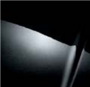
NIGHTHAWK BLACK PEARL