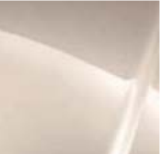
SILKY BEIGE PEARL