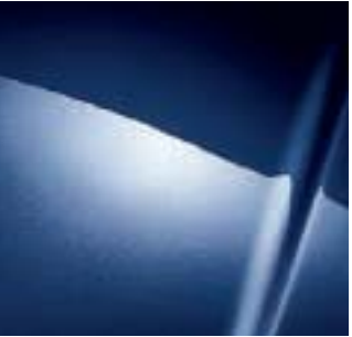
INDIGO BLUE PEARL