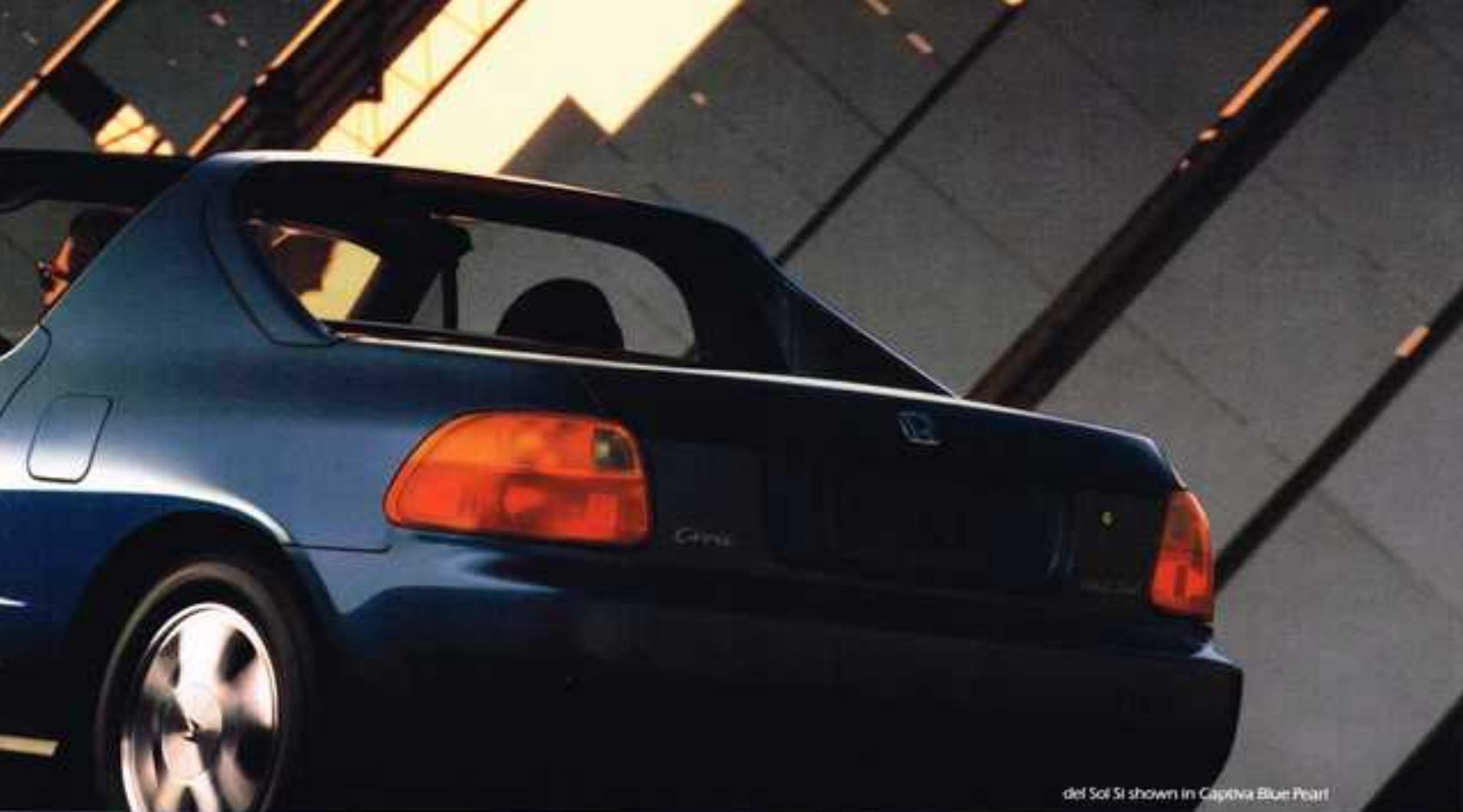
del Sol Si shown in Captiva Blue Pearl