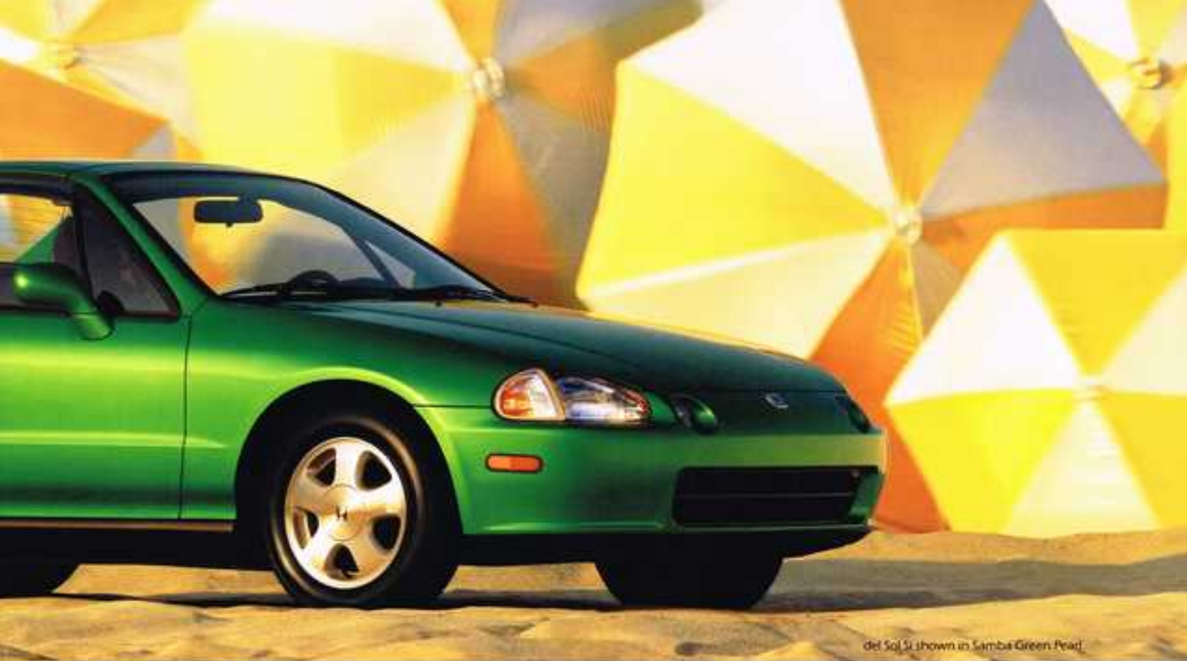
del Sol Si shown in Samba Green Pearl

Driver's Side Airbag SRS, 1.5 Liter, 102-hp, 16-Valve Engine with PGM-FI, Power Steering (with available automatic transmission only), 4-wheel Double Wishbone Suspension, All-Season Tires, 5-Speed Manual or Available 4-Speed Automatic Transmission, Removable Roof Panel, Roof Panel Storage Rack, Full Wheel Covers,