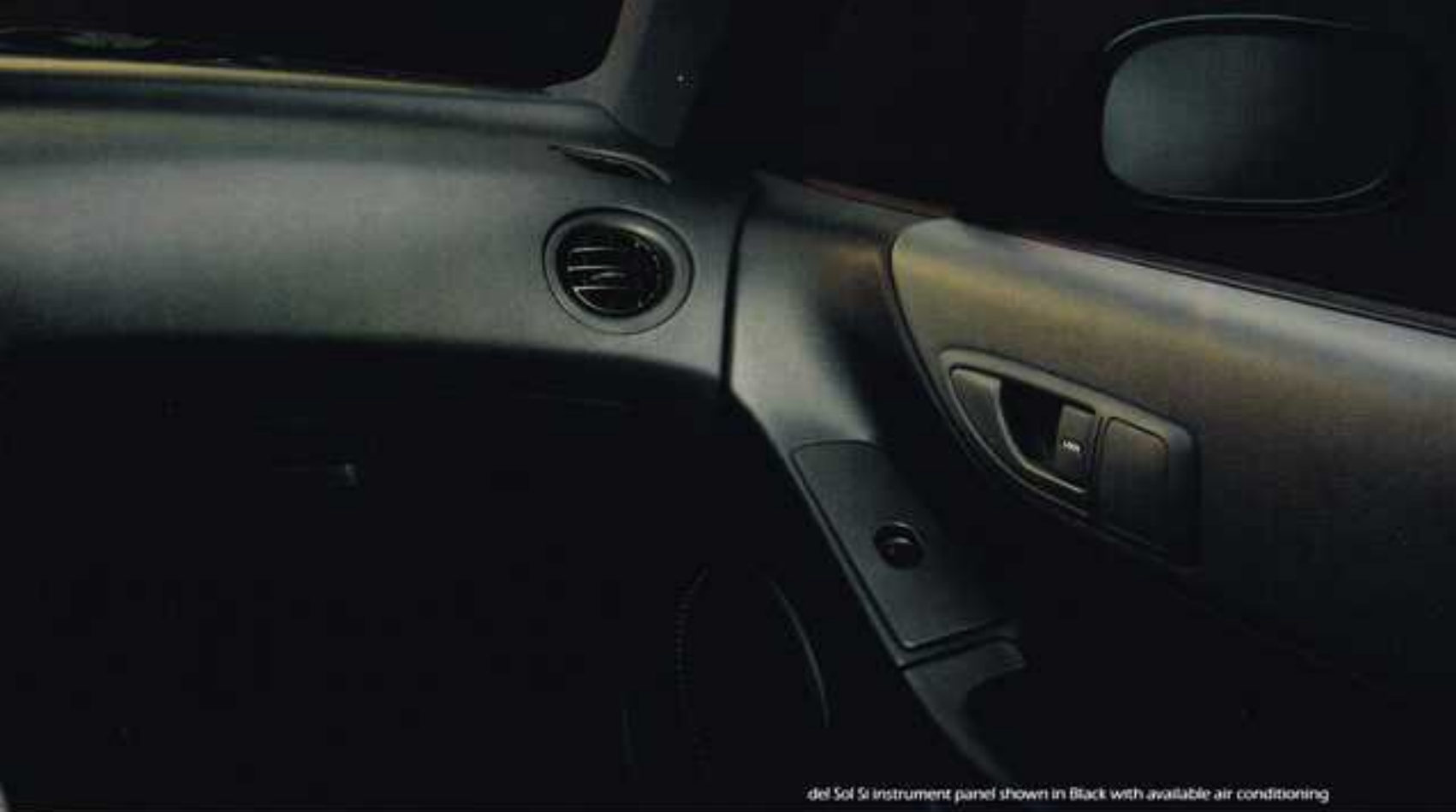
del Sol Si instrument panel shown in Black with available air conditioning