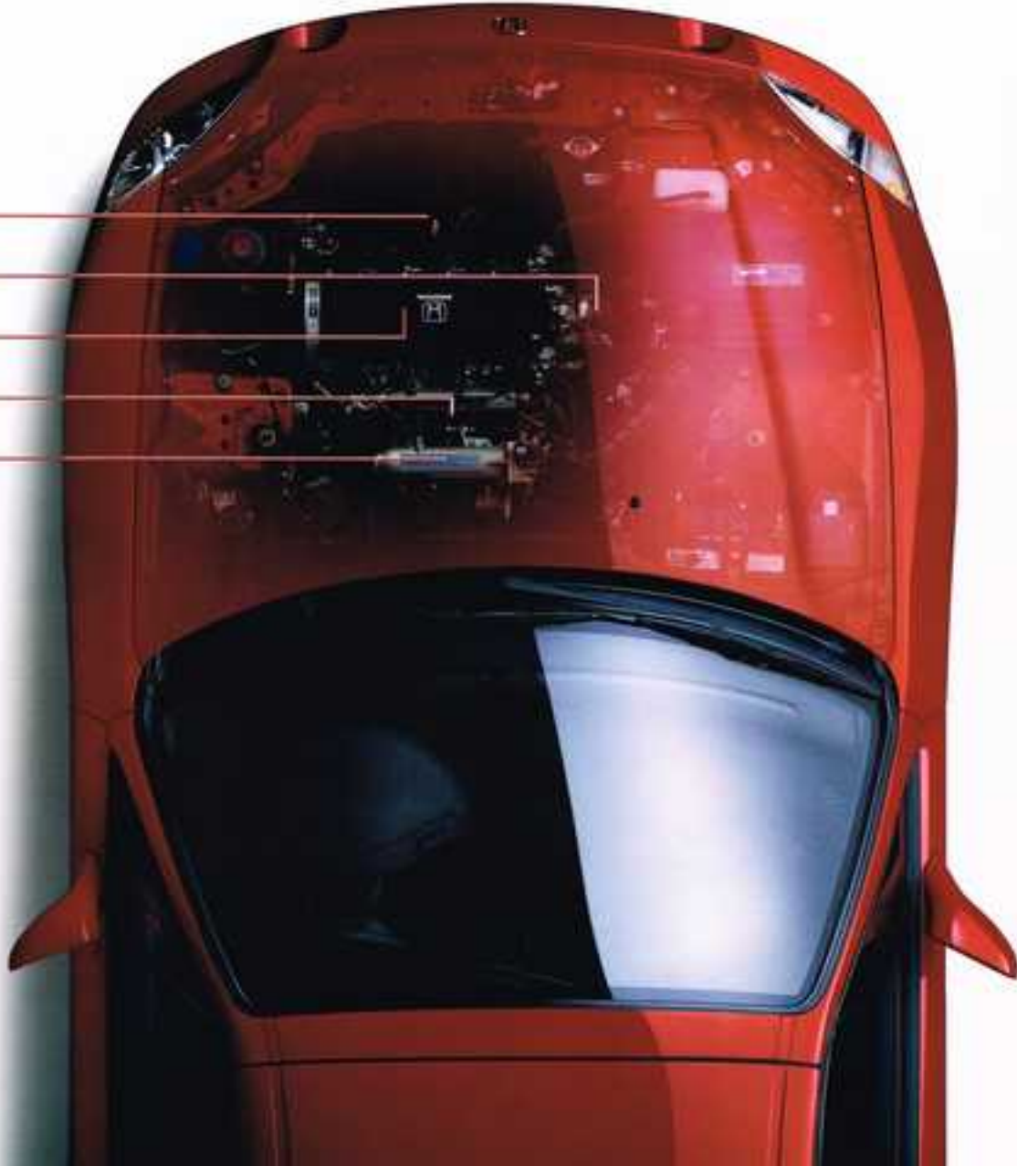
Get Set Go! The 5.1-liter engine shown

► PGM-FI: All del Sol engines utilize Honda Multi-Point Programmed Fuel Injection (PGM-FI) for improved response, greater power output and better fuel efficiency. The system uses electronic sensors to monitor key engine functions like throttle position, engine speed and coolant temperature, as well as various environmental conditions like air temperature and pressure. An Engine Control Module (ECM) then uses this information to help adjust the air-fuel ratio and injector timing. An additional advantage of PGM-FI is easier maintenance and repair. The ECM will detect and store information about a malfunction so that it can be quickly diagnosed by a service technician.