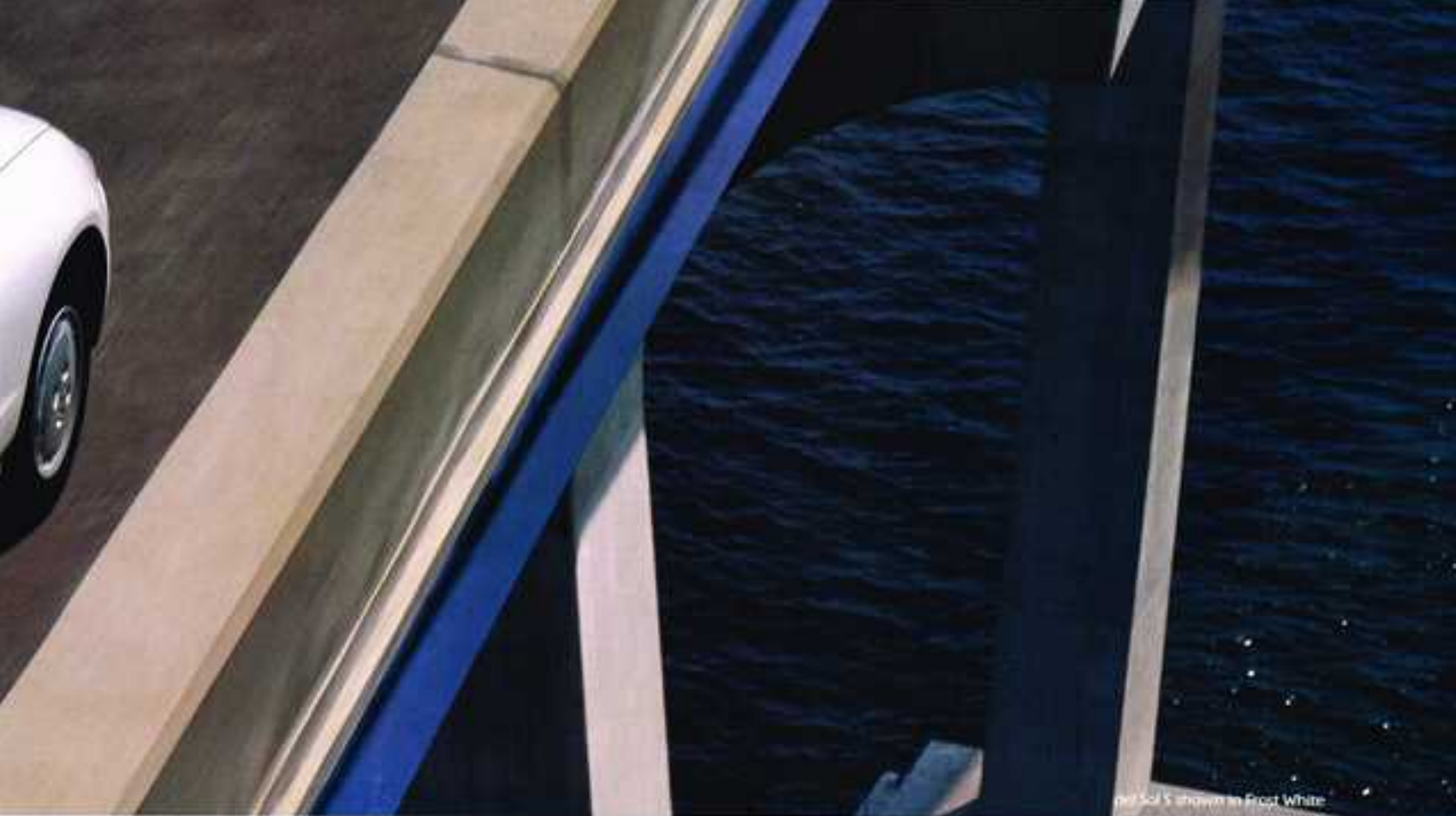
del Sol is shown in Frost White