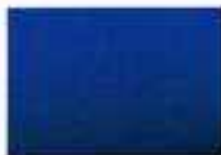
Captiva Blue Pearl