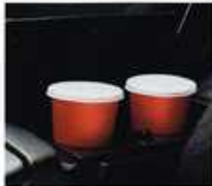
Beverage Holder: The beverage holder is located in the center console.

The del Sol comes equipped with a standard driver's side airbag, Supplemental Restraint System (SRS). An airbag can help protect the driver's head and upper torso in the event of a severe frontal collision. However, an airbag is only supplemental. Your seat belts are always your primary means of protection. They can help protect you and your passenger in virtually all types of collisions.