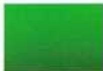
Samba Green Pearl