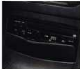
Audio System Cover: Shown with available CD tuner.