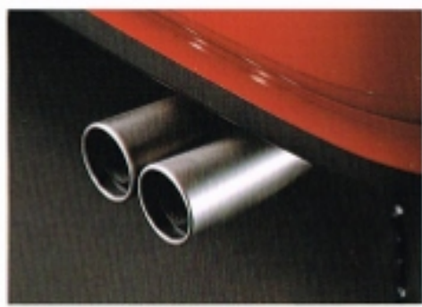
Chromed exhaust trim (1.6i-16 featured)