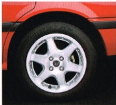
Stylish alloy wheels