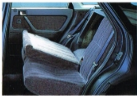
Split folding rear seats

It's time to discover the Blaise difference for yourself. See your Honda dealer - now!