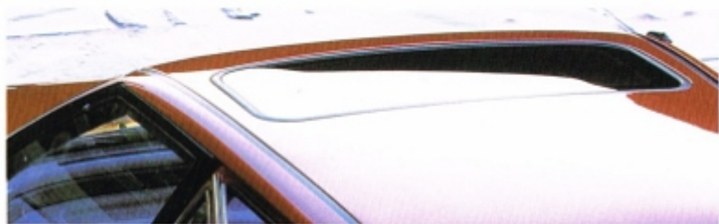
Electric smoked-glass slide and tilt sunroof