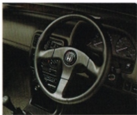
Leather-trimmed sports steering wheel