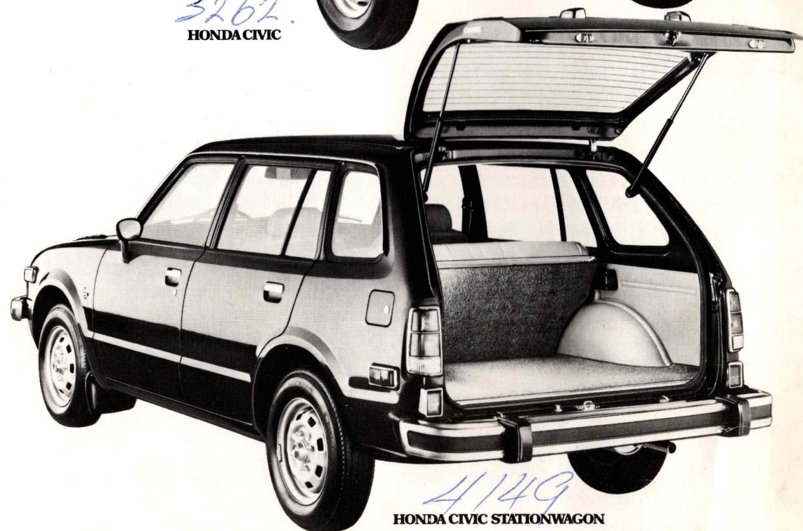
4149 HONDA CIVIC STATIONWAGON

PUT A SMILE ON YOUR FACE. DRIVE A HONDA.