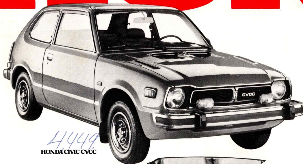
4449 HONDA CIVIC CVCC