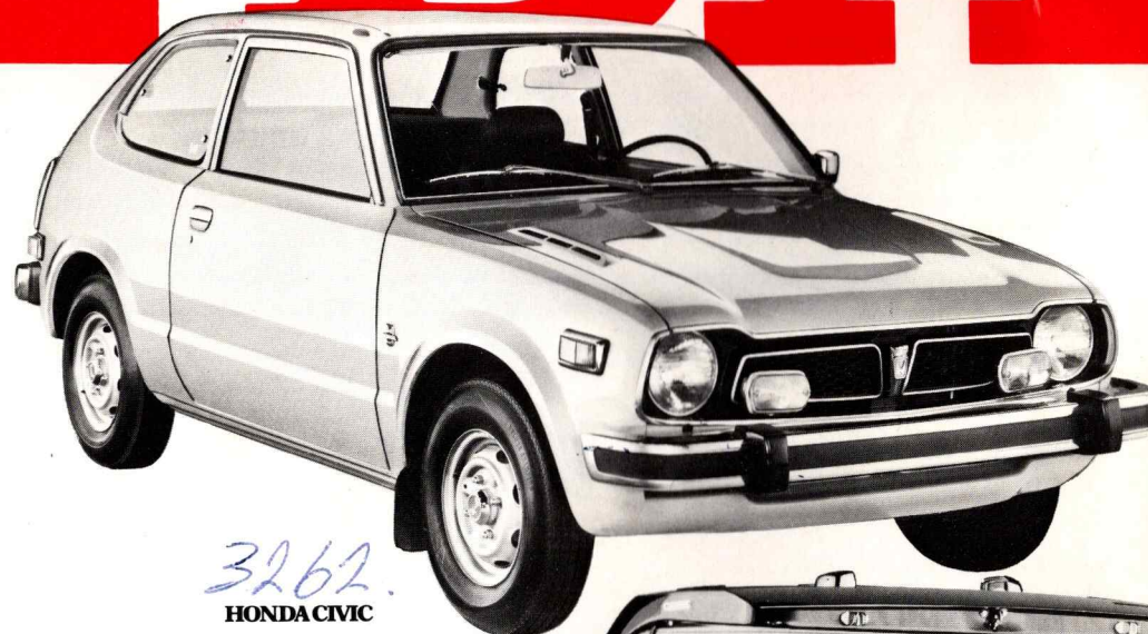
3262 HONDA CIVIC