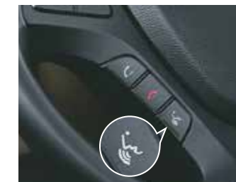
Voice Recognition Button on Steering