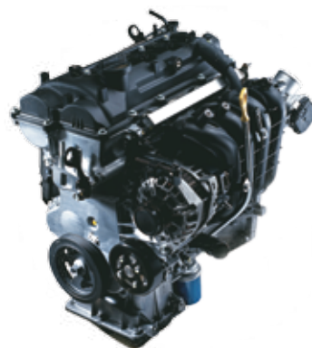
1.2L Kappa Dual VTVT Petrol Engine