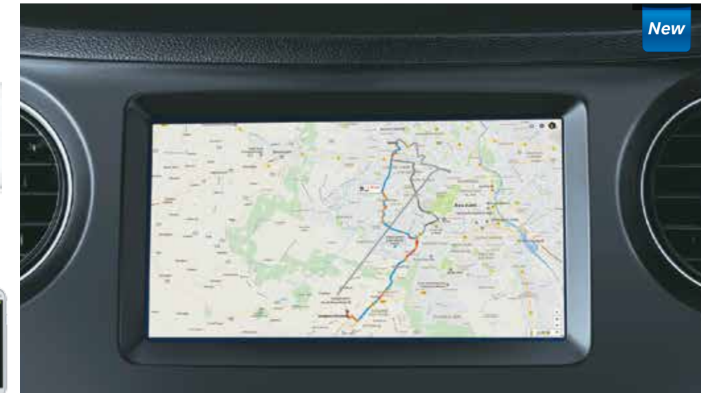
17.64cm Touchscreen Audio Video System | Mirror Link | Smart Phone Navigation

A class-leading 17.64cm Touch Screen Audio Video System with smart phone connectivity, voice recognition and navigation support, gives the all new 2017 XCENT an advanced hi-tech imagery.