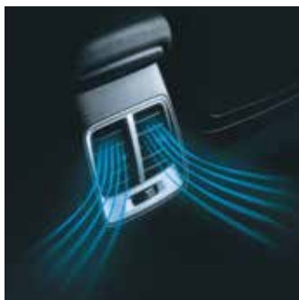
Rear AC Vent & Accessory Socket