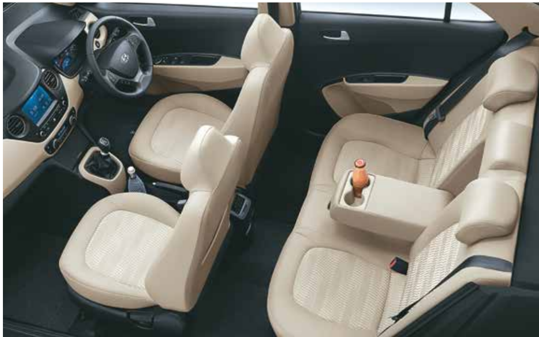
Bright and Spacious Interiors with New Seat Upholstery