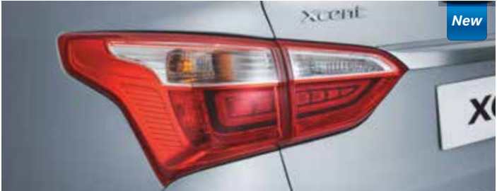
New Premium 2-Piece Wraparound Tail Lamps