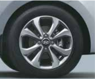
R15 Diamond Cut Alloy Wheels