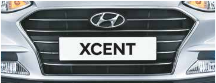
Hyundai Signature Cascade Design Grille with Chrome Slats

Rear Chrome Garnish | Electric Folding ORVM with Turn Indicator Sleek Waistline Moulding