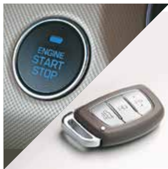
Smart Key with Push Button Start-Stop