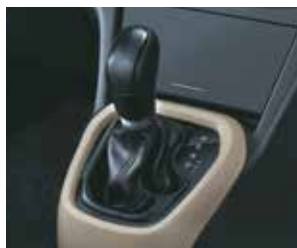
4-speed Automatic Transmission