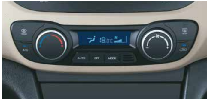
Fully Automatic Temperature Control