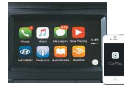
Apple CarPlay Connectivity