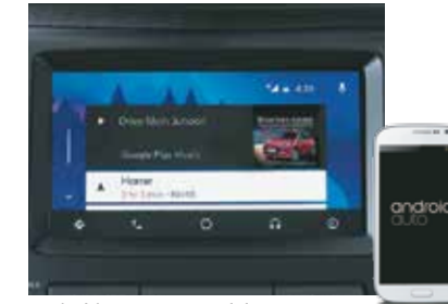
Android Auto Connectivity