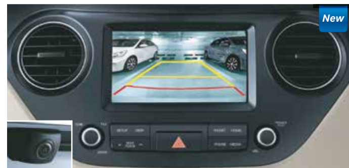
Rear Parking Assist System (with Display on 17.64cm Audio Screen)