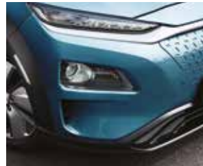
Closed grille and twin headlight design

Every destination needs a journey. Why settle for less when the KONA Electric is packed with innovative technology and striking design features, to get you there in comfort and style.