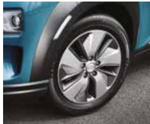
17" alloy wheels

Exceptional style is our standard, with a vibrant range of external colours and varied interiors giving you aesthetic control. The unique closed-off front grille, aerodynamic 17" alloy wheels and the distinct frame add flair to every design, whilst under the hood cutting-edge lithium-ion batteries give you peak performance. Both available battery sizes (39 and 64kWh) are liquid-cooled and reliably charge to 80% capacity within 57 and 75 minutes (using a 50kWh rapid charger), giving you a range of up to 194 and 300 miles respectively.