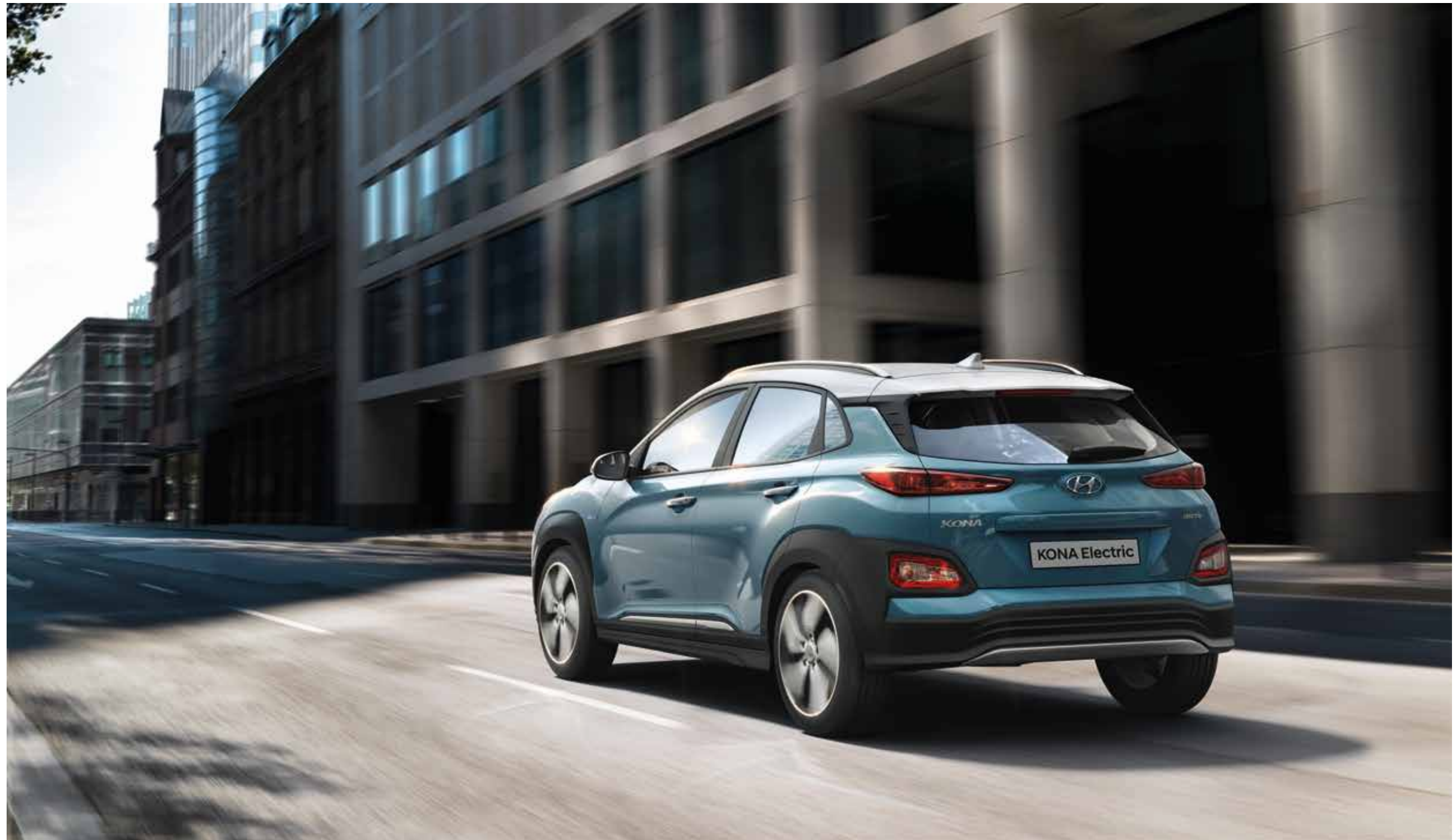
Car shown KONA Electric Premium SE in Ceramic Blue pearl paint with optional two-tone roof.

Exceptional style is our standard, with a vibrant range of external colours and varied interiors giving you aesthetic control. The unique closed-off front grille, aerodynamic 17" alloy wheels and the distinct frame add flair to every design, whilst under the hood cutting-edge lithium-ion batteries give you peak performance. Both available battery sizes (39 and 64kWh) are liquid-cooled and reliably charge to 80% capacity within 57 and 75 minutes (using a 50kWh rapid charger), giving you a range of up to 194 and 300 miles respectively.