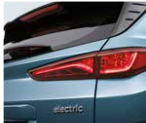
LED rear lamps