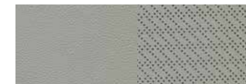
Premium SE: Grey Leather (Seat Facings). No cost option with Ceramic Blue, Galactic Grey or Chalk White exterior colours