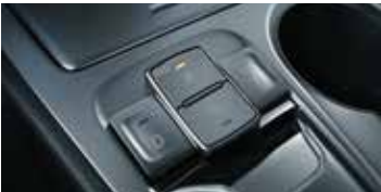
Electronic gear shift button

The KONA Electric's spacious interiors are as comfortable as they are modern. The dashboard boasts an intuitive 7" digital cluster display making critical information readable at a glance, whilst the centre-mounted 8" touchscreen gives quick access to car functions including navigation. You can also shift gear into Drive, Neutral and Reverse with a single button press on the central column. What's more, regenerative braking controls on the steering column let you balance acceleration and efficiency by shifting power to the wheels or battery as needed.