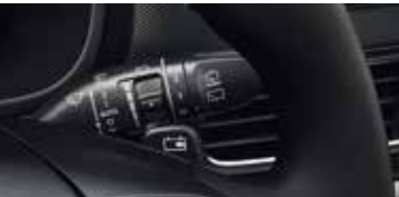
Paddle shifter (Regenerative braking control)