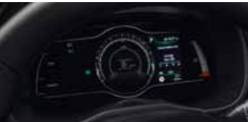
7" digital cluster

The simple, sleek interior puts you in control. A perfect blend of advanced technology and elegant design keeps you informed without being distracting, letting you drive with confidence.