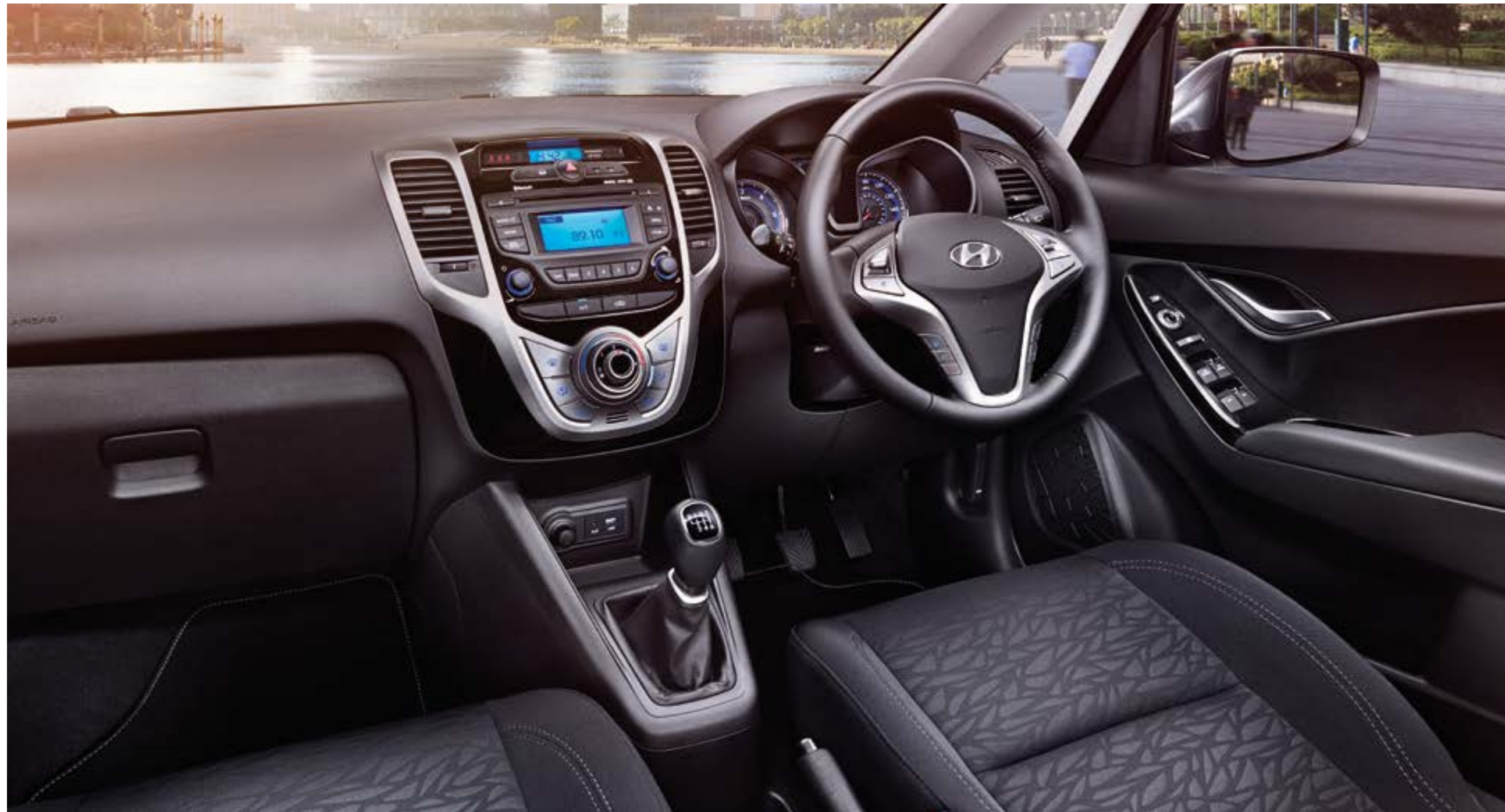
Car shown ix20 SE.

including Bluetooth® connectivity with voice recognition. Steering wheel audio controls also mean you can keep your ears trained on the music, and your eyes focused on the road ahead. On SE Nav and Premium Nav models, arrive with ease using Touchscreen Satellite Navigation which feeds back real-time traffic information. And when you finish your journey, the rear view camera will help you to fit into the tightest of gaps.