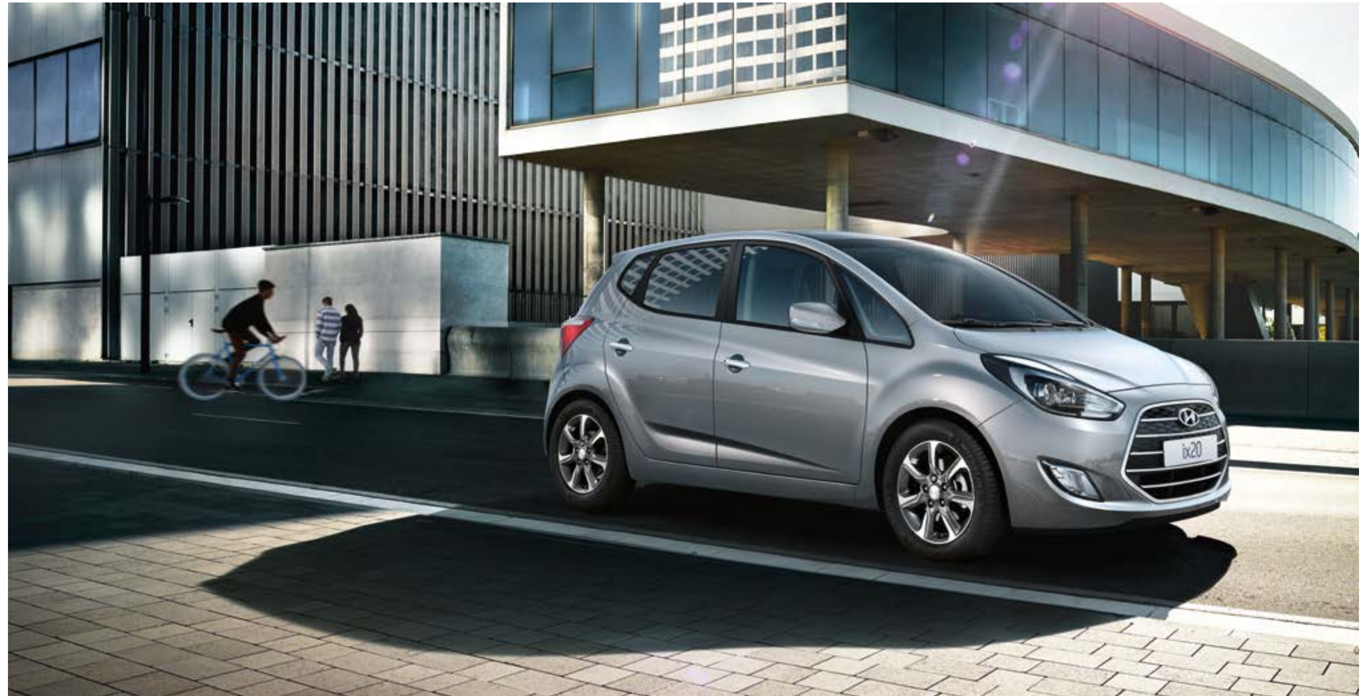
Car shown ix20 Premium Nav in Platinum Silver metallic paint. Headlights shown not to UK specification.

The ix20 manual models include Intelligent Stop and Go (ISG), which automatically stops the engine when you come to a halt, and restarts it again when you de-press the clutch. It also has low rolling resistance tyres and electric power assisted steering, which is quieter, lighter and saves energy - ultimately reducing emissions. As well as the 1.6 diesel Blue Drive, you can opt for a 1.6 petrol automatic or a 1.4 petrol manual. If you select manual transmission you'll also benefit from an eco-drive indicator which suggests the optimum time to change gear for maximum efficiency. It's our way of giving you more influence over your fuel consumption. With a range of high-tech engines optimised for greater economy, the ix20 is a perfect example of our fuel-saving philosophy.