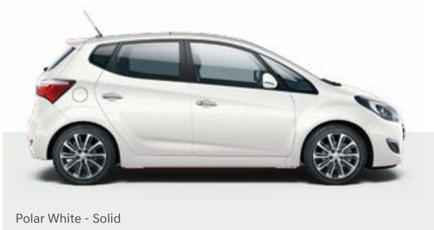
Polar White - Solid