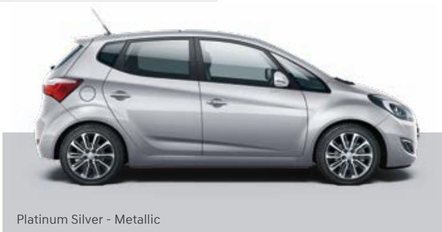
Platinum Silver - Metallic