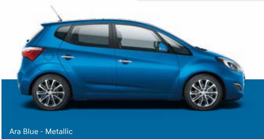
Ara Blue - Metallic