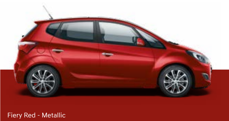
Fiery Red - Metallic