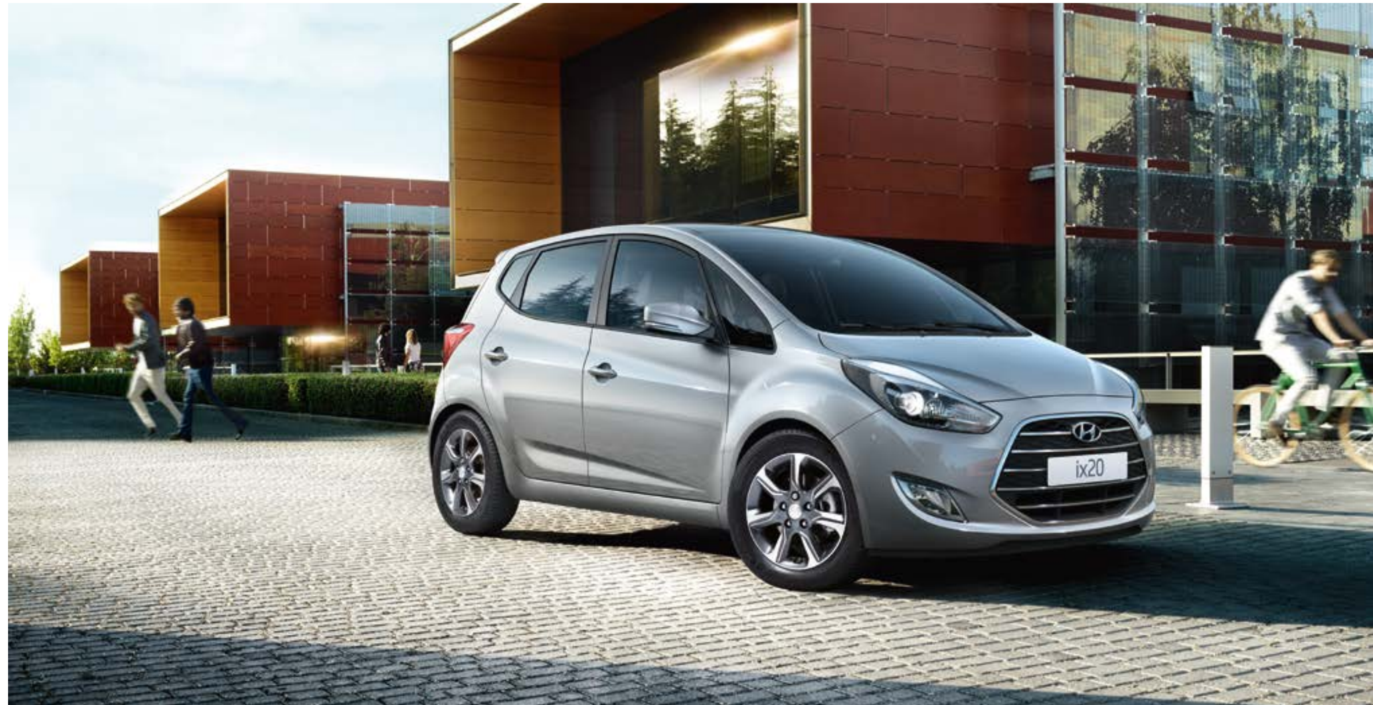
Car shown ix20 Premium Nav in Platinum Silver metallic paint. Headlights shown not to UK specification.

The ix20 doesn't do boxy. Its dynamic design, spacious interior and efficient drive are enhanced by all the clever little extras inside. It's the stand-out car in its class.