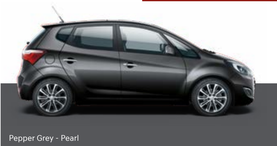
Pepper Grey - Pearl