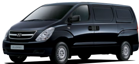
Timeless Black – Mica