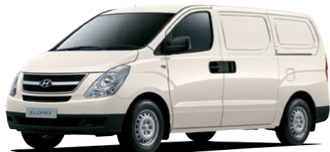
Creamy White – Solid