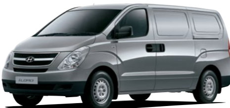
Hyper Silver – Metallic