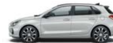
Platinum Silver (Pearl)