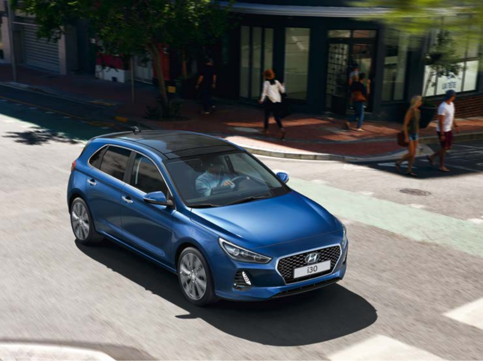
Car shown in Stargazing Blue metallic paint. Not to UK specification.