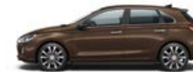
Demitasse Brown (Metallic)