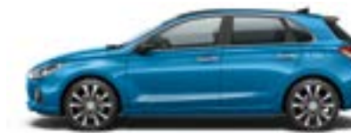
Ara Blue (Metallic)