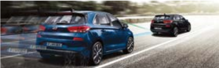
Autonomous Emergency Braking (AEB) automatically applies partial or maximum braking force if a potential collision is detected.