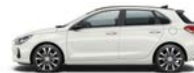
Polar White (Solid)