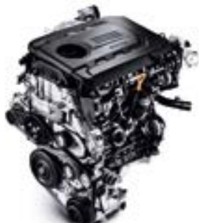
1.6L CRDi 110PS