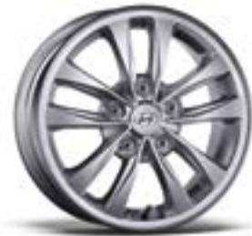
15" 5-twin-spoke Design alloy wheel (metallic grey)