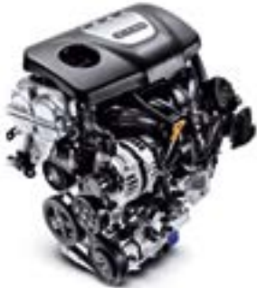
1.0L T-GDi with 120PS