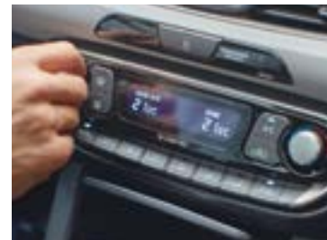
Dual-Zone Climate Control