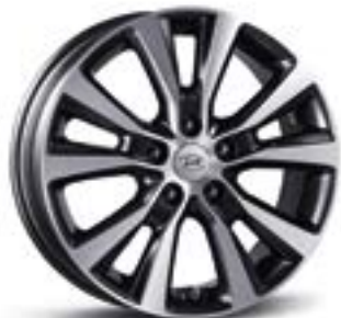
17" 5-twin-spoke Design 2-tone alloy wheel (metallic grey)