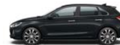
Phantom Black (Pearl)