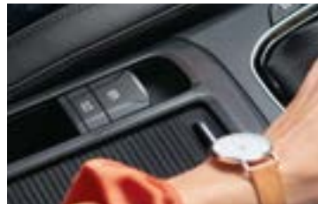
Electronic Parking Brake