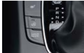
Drive Mode Select (DCT only)