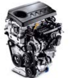
1.4L T-GDi with 140PS