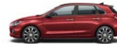
Fiery Red (Metallic)