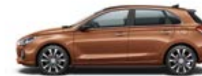
Intense Copper (Metallic)