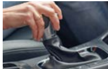
7-speed Dual-Clutch Transmission