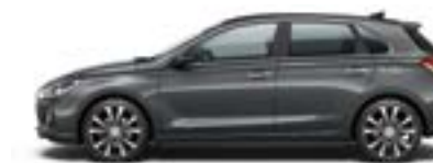
Micron Grey (Metallic)