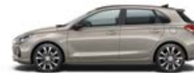
White Sand (Metallic)