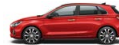
Engine Red (Solid)