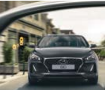
Blind-Spot Detection (BSD) warns of the presence of vehicles hidden in blind spots by means of visual and acoustic alerts.