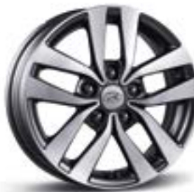
16" 5-twin-spoke Design 2-tone alloy wheel (metallic grey)