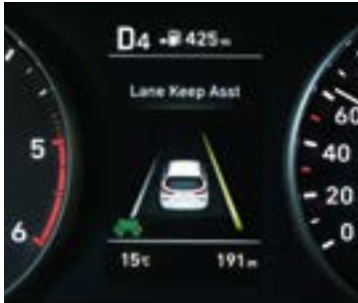
Lane Keep Assist System (LKAS) recognises lane markings and can apply corrective steering through long motorway journeys.