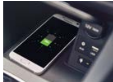
Wireless Smartphone Charging*