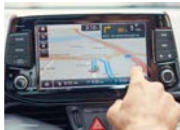
8" Floating Touchscreen