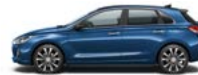
Stargazing Blue (Pearl)