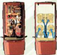
Cherokee Limited's advanced air conditioning system ensures even circulation of both warm and cool air to the front and the rear.

So, we guarantee that however uncivilised the conditions outside, you'll always travel in the lap of luxury.