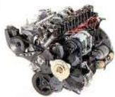
The Cherokee 4 litre high-output multi-point fuel-injected engine produces excellent torque with high fuel efficiency.

Of course, all Jeeps are built with strength, safety and durability as basics. The new Cherokee Sport is no exception. It incorporates a light but ultra-strong UniFrame construction, to give you maximum safety whether on or off the road.