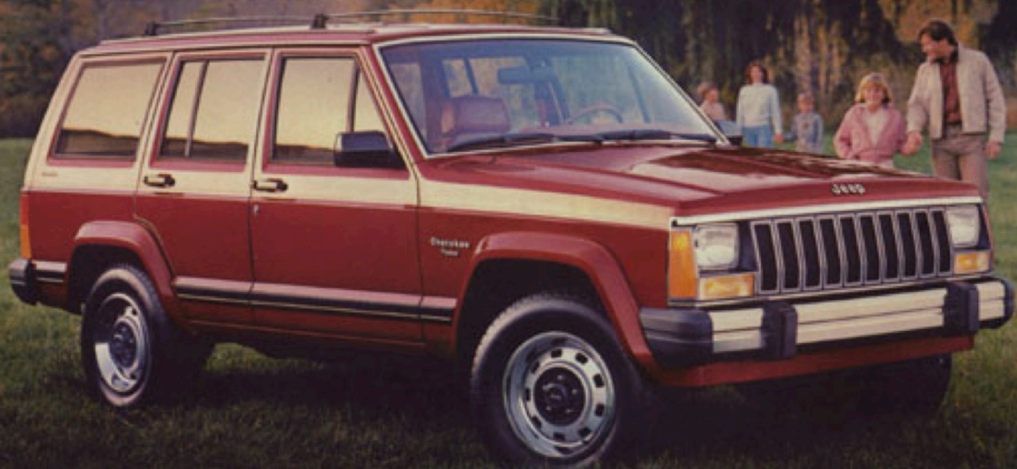
Cherokee Pioneer 4-door