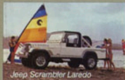
Jeep Scrambler Laredo