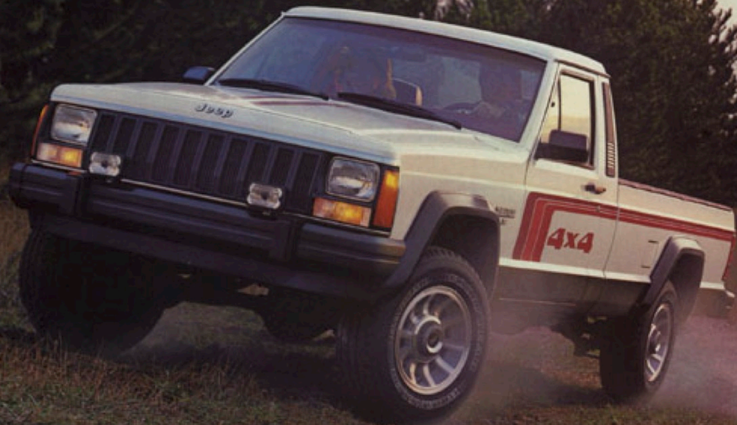
New Jeep Comanche