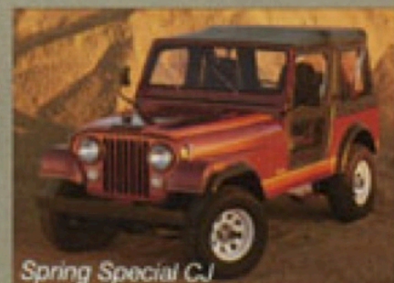
Spring Special CJ

Now is the time to experience the Jeep mystique. To own a part of history. To share the adventure. And whether you choose a Jeep CJ, Cherokee, Wagoneer, Grand Wagoneer, Jeep Pickup, Scrambler or American Eagle, you know that 45 years of engineering know-how are built-in to produce a vehicle that performs.