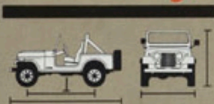
JEEP CJ DIMENSIONS (inches unless otherwise specified)