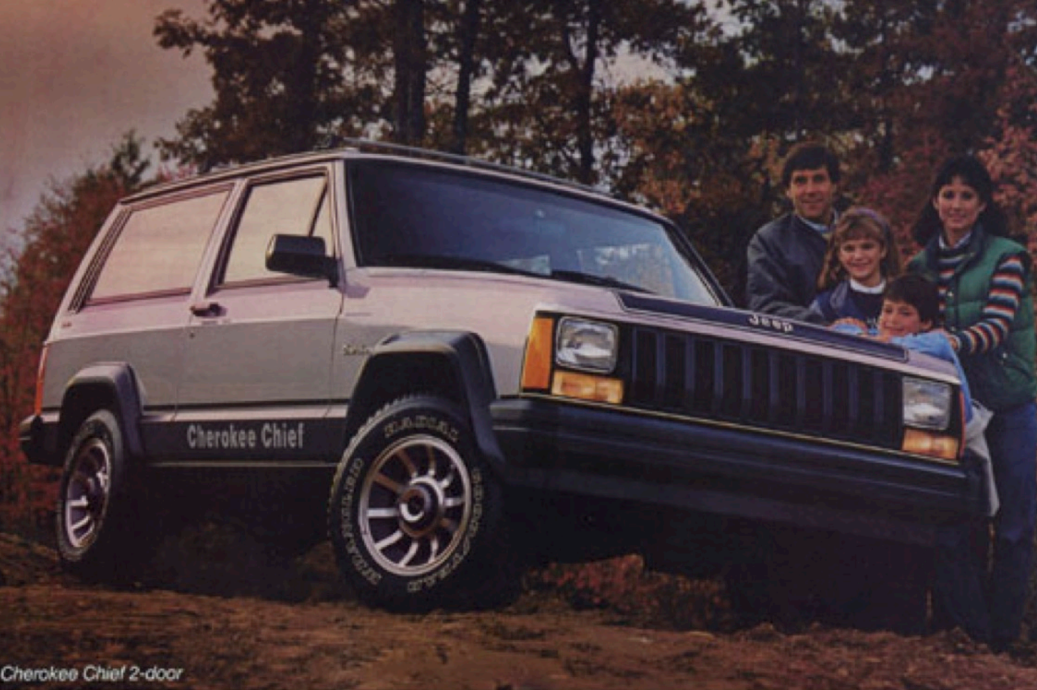
Cherokee Chief 2-door