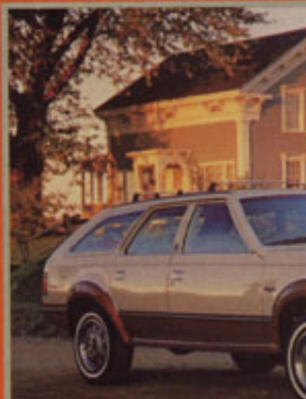
American Eagle Wagon

American Eagle defies comparison! It is a well-appointed and equipped vehicle that's ready to take you and your family almost anywhere—in style and comfort—