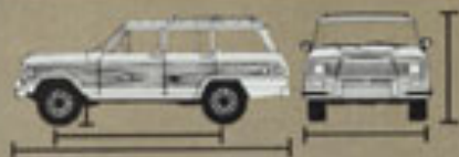
GRAND WAGONEER DIMENSIONS (inches unless otherwise specified)

Quite simply, there is no other vehicle in the world like it. None as luxuriously practical as the Grand Wagoneer.