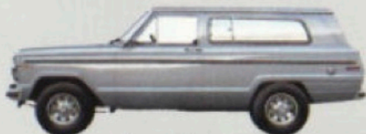
Cherokee Pioneer 2-Door