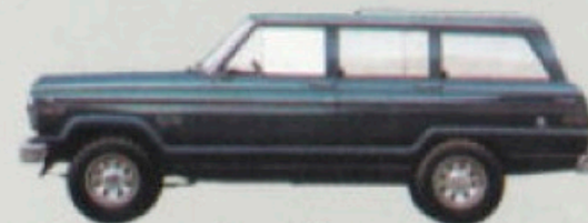
Cherokee Pioneer 4-Door