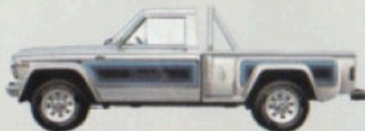
J-10 Honcho Sportside

Jeep is America's only complete family of 4-wheel drive vehicles. In addition to CJ and Scrambler, there's Jeep Cherokee, the family sized Sport truck, Jeep Pickup...the right tool for all kinds of jobs, and Jeep Wagoneer...the ultimate 4WD Wagon. These Jeep vehicles offer the extra security and traction of the exclusive Selec-Trac automatic 2WD/4WD system. It's standard on Jeep Wagoneer and available on Jeep Cherokee & J-10 Pickup models.