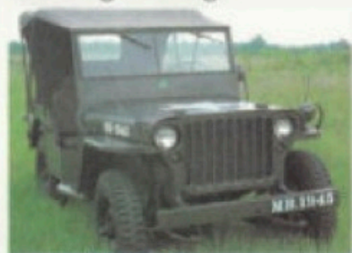
1945 Military Model MB

It continues nobly today, exemplified in the rugged, dependable Jeep® CJ-5 Renegade incorporating 43 years of technological improvements in 4WD systems design and engineering.