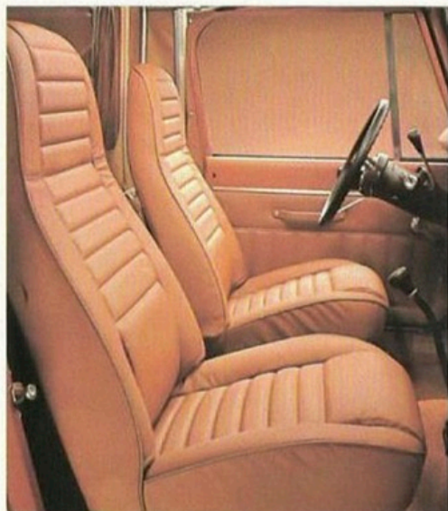
SR Sport Highback Bucket Interior