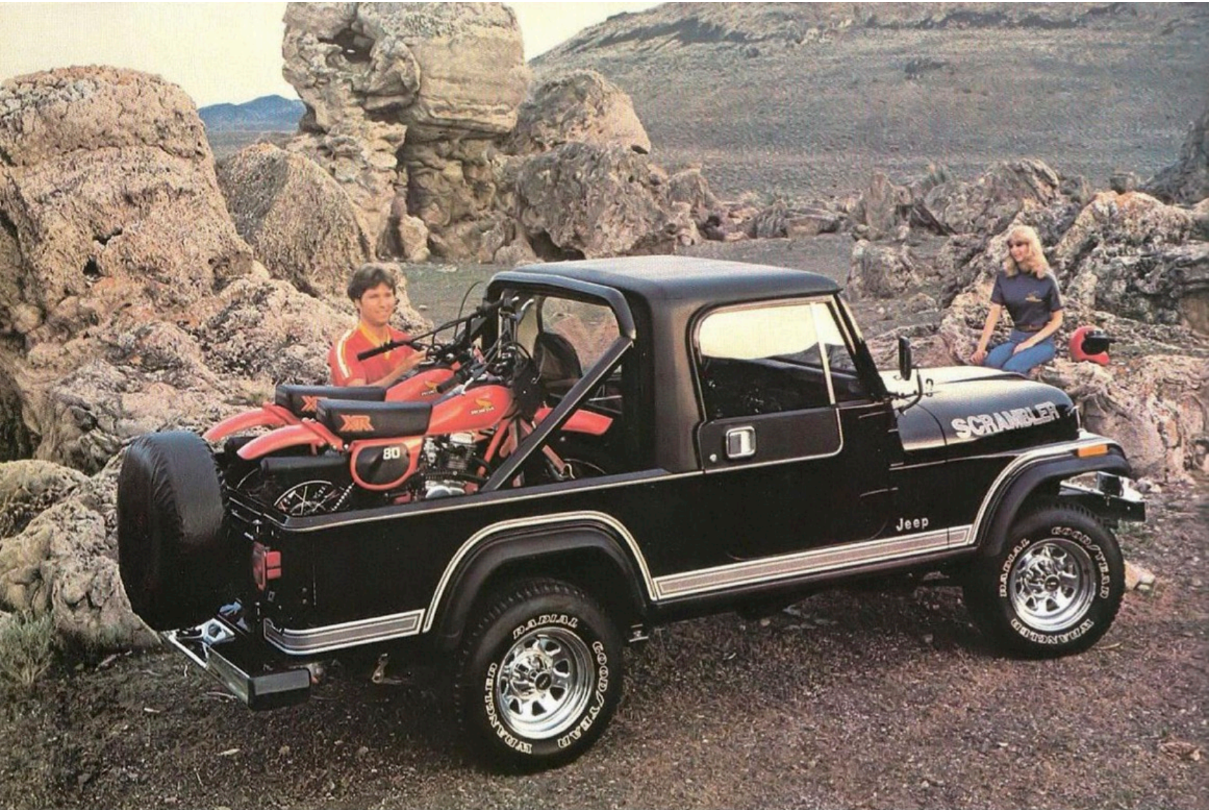
Scrambler SL Sport (above)