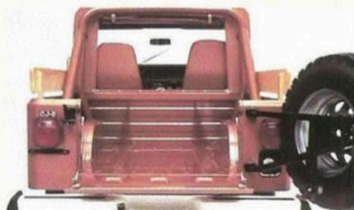
Rear Swing Away Spare Tire