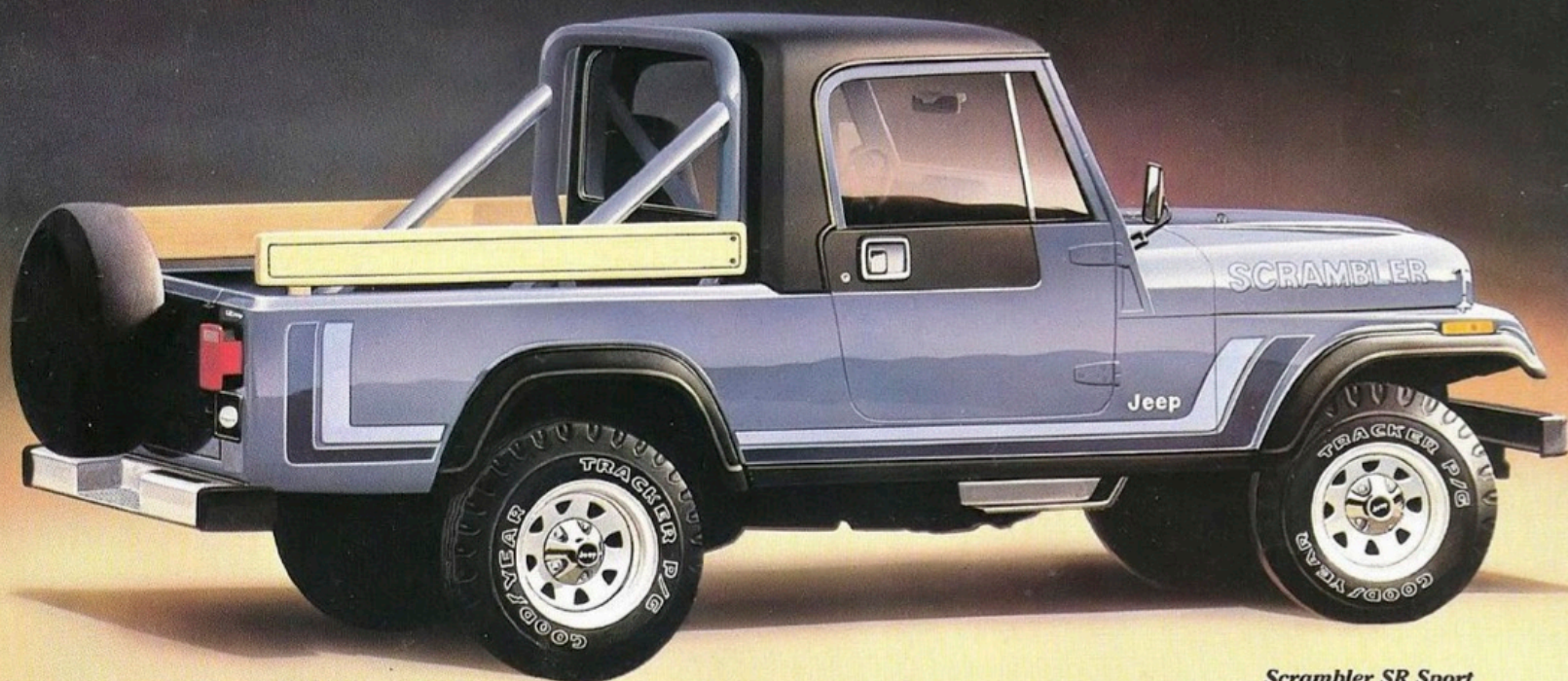
Scrambler SR Sport