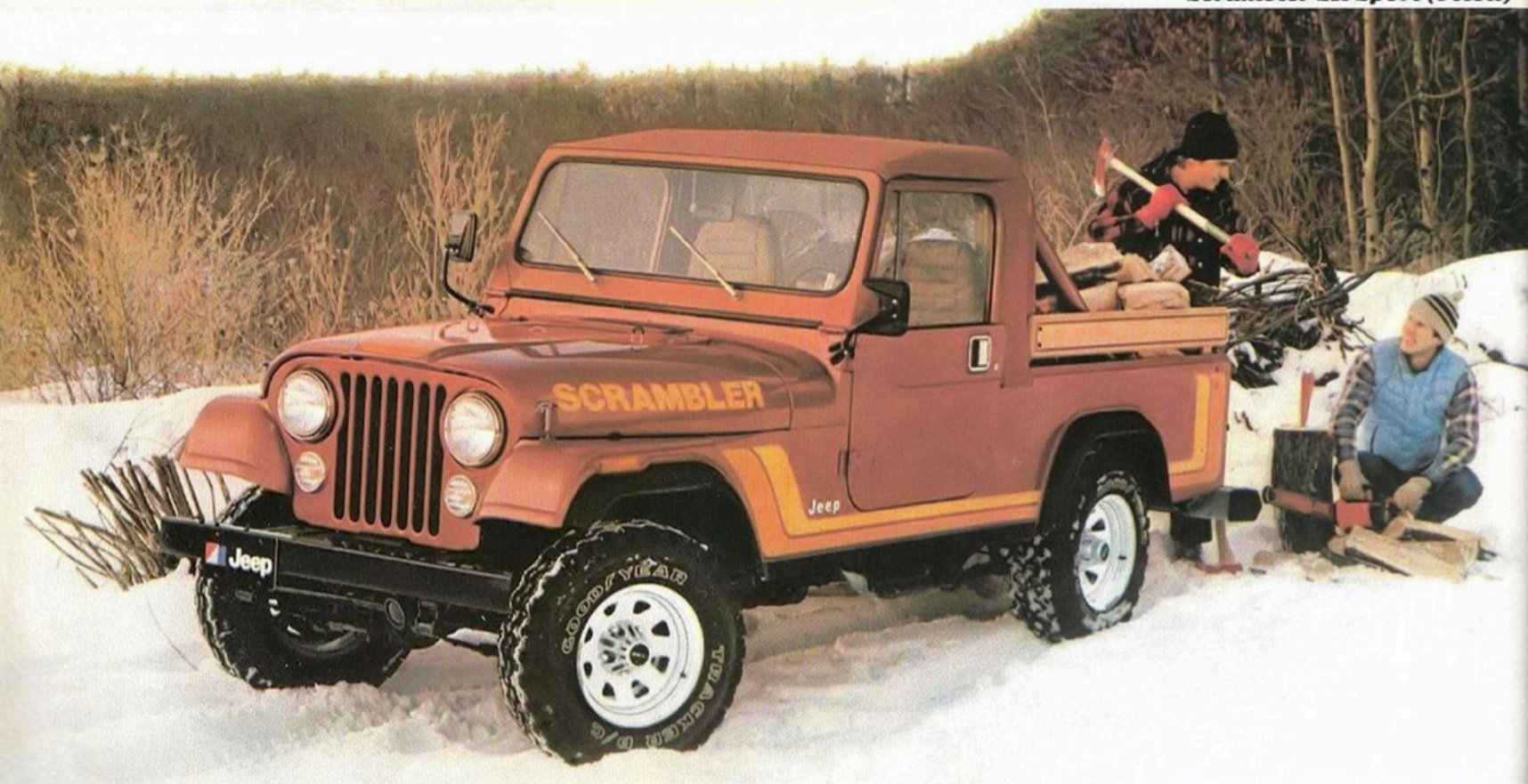
Scrambler SR Sport (below)