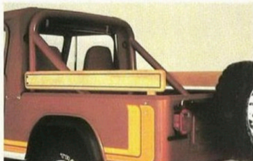
Wood Side Rails