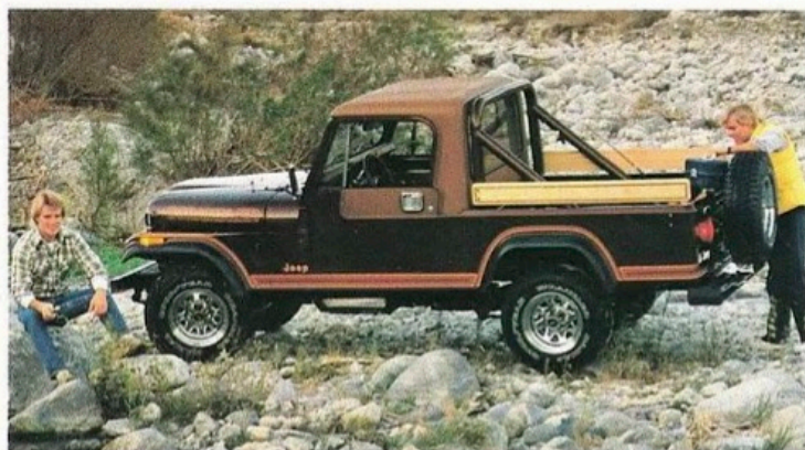
Scrambler SL Sport