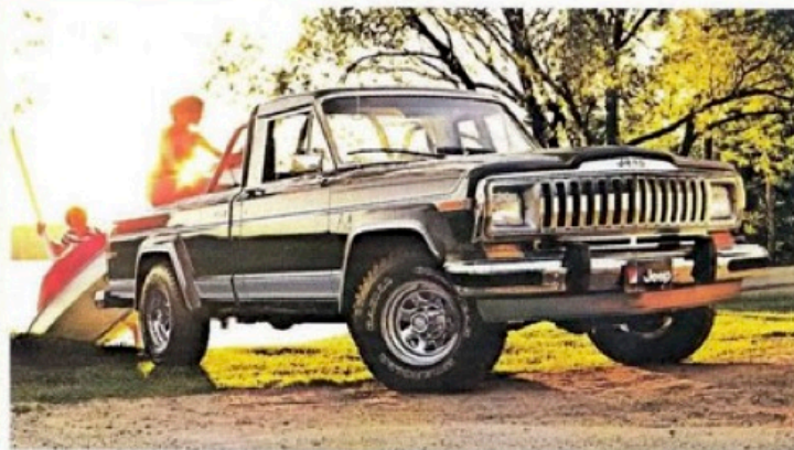
Jeep J-10 Laredo Townside