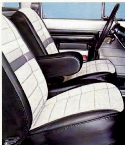
Pioneer Western Weave Interior