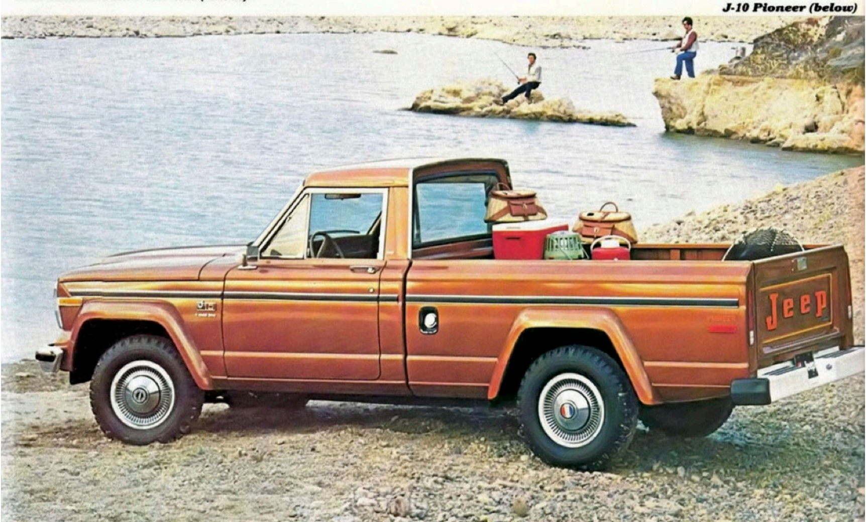
J-10 Pioneer (below)