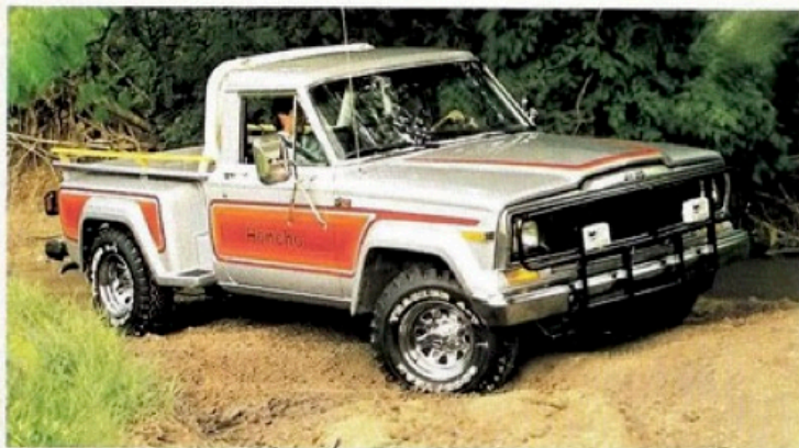
Jeep J-10 Honcho Sportside