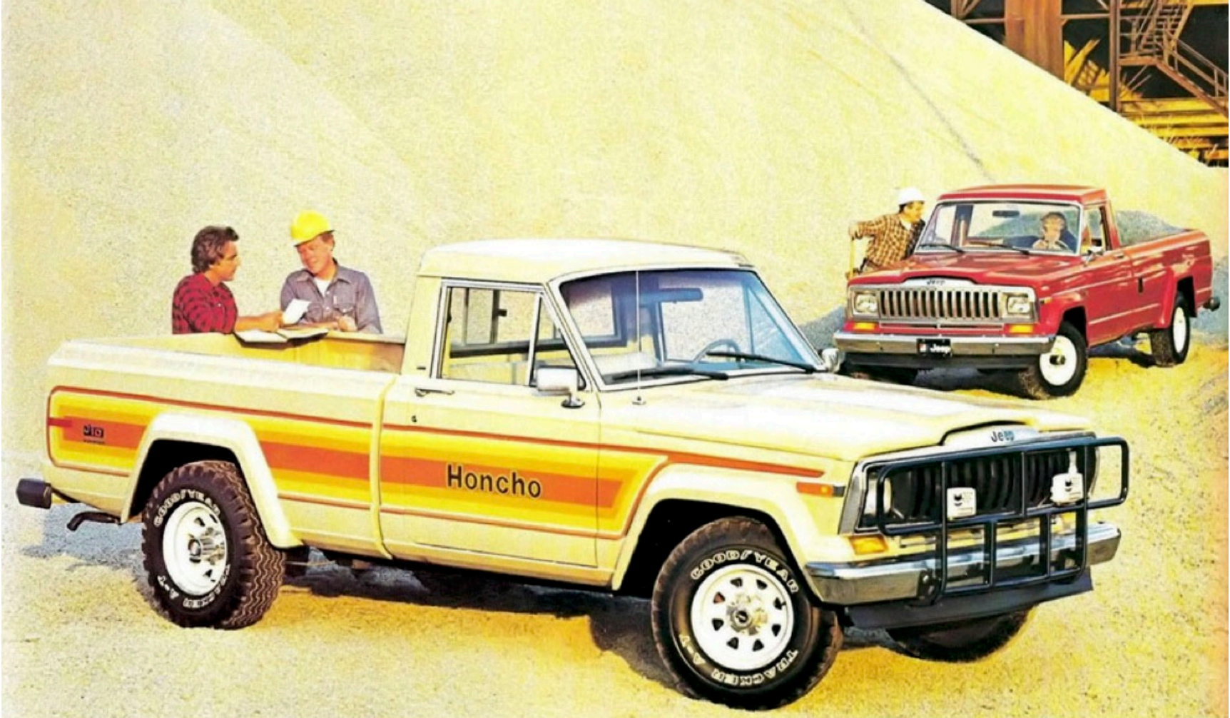
J-10 Honcho and J-10 Base (above)