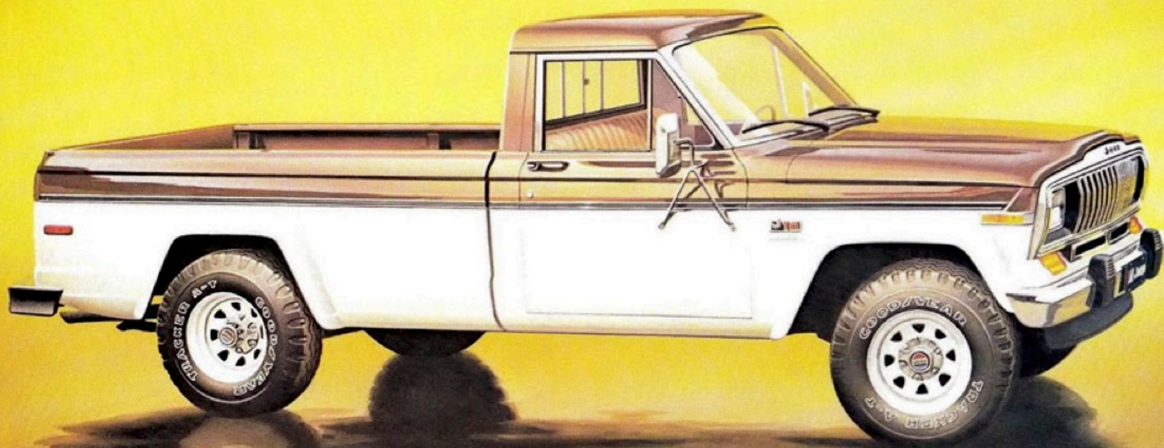
Jeep J-10 Custom Townside