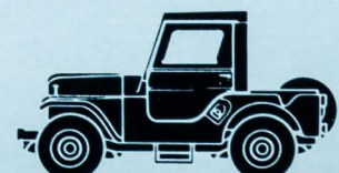
Metal half cab