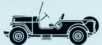
Open body CJ-6