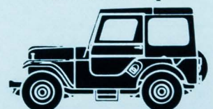
Metal full cab