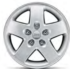
17" alloy wheel Standard on Sahara