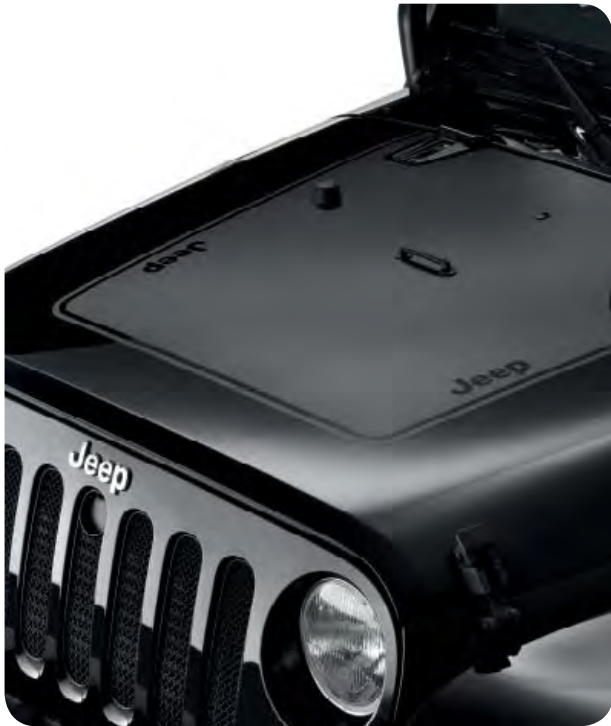
Hood decal in matt black with Jeep logo. Also available in matt silver.