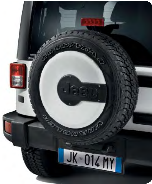
Spare tyre cover.