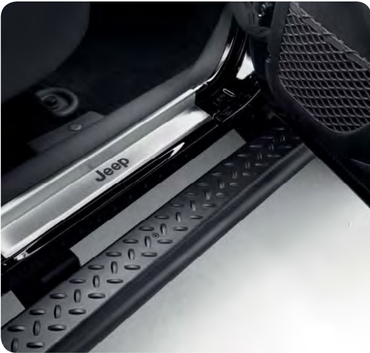
Door sill guard in brushed stainless steel with Jeep logo.