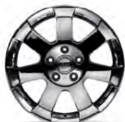
18" Mopar designed chrome plated alloy wheel. Optional ask for details