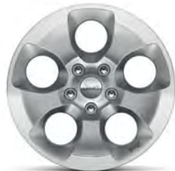
18" polished alloy wheel Standard on Overland