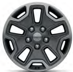
17" polished mineral grey alloy wheel Standard on Rubicon