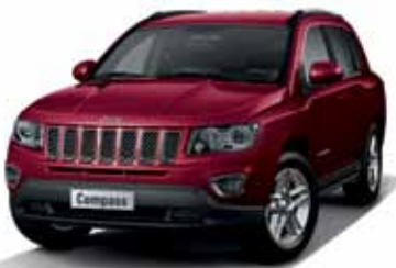
Deep Cherry Red