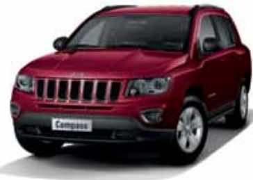
Deep Cherry Red