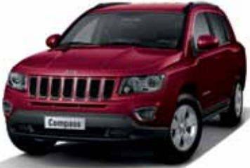
Deep Cherry Red