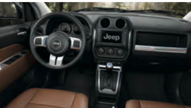
Leather-faced — Light Pebble