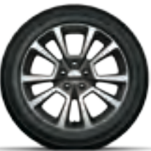
18-inch Aluminum with Painted Pockets Standard on Limited