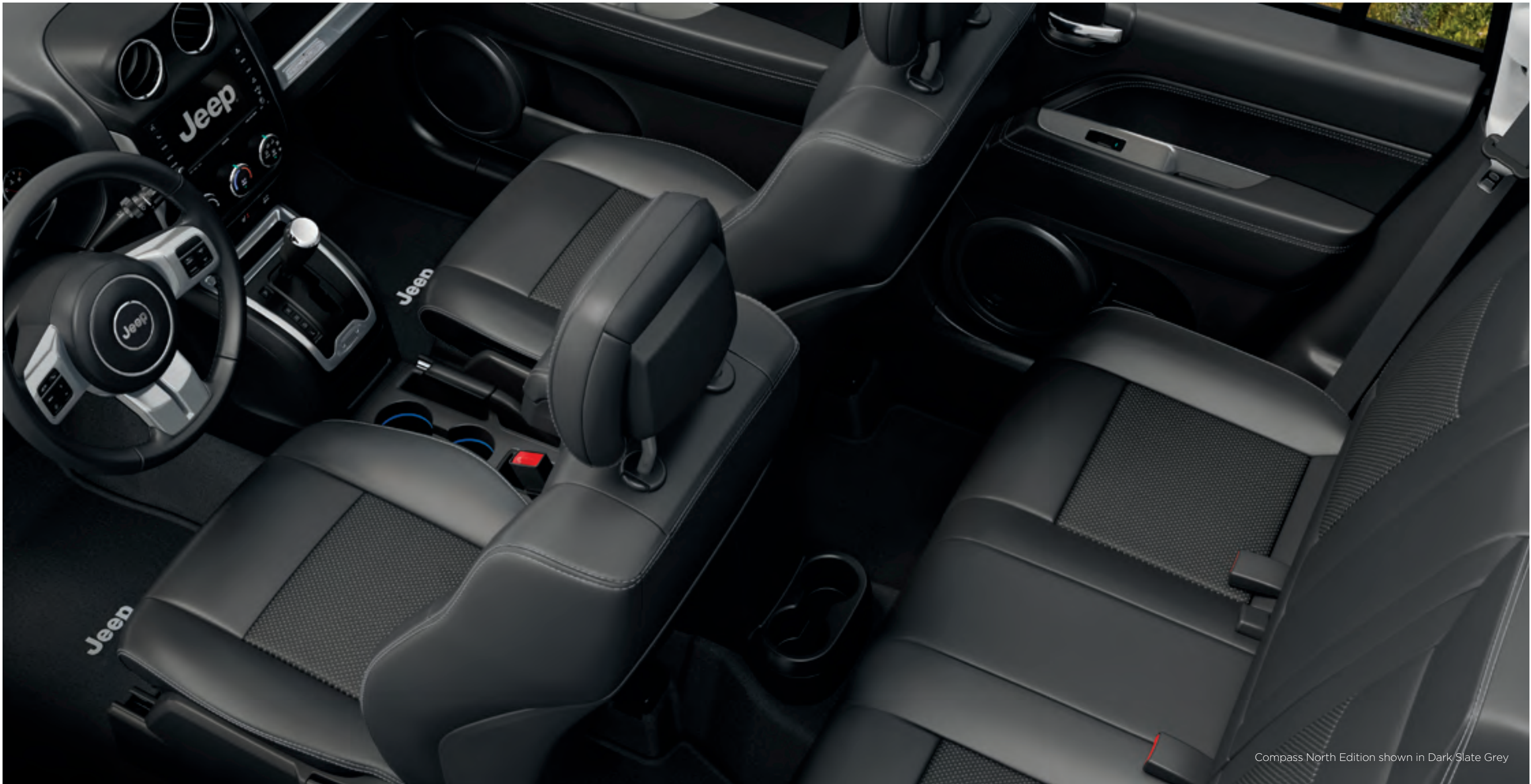
Compass North Edition shown in Dark Slate Grey