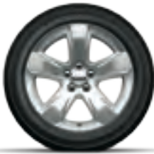
18-inch Chrome-clad Aluminum Available on Limited