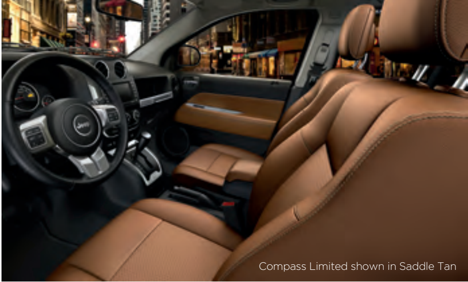
Compass Limited shown in Saddle Tan

Compass' interior is designed to achieve the optimal ratio of guests and gear. Rear-seat passengers will appreciate the Best-in-Class (2) legroom. Everyday necessities easily fit in the cargo space behind the second row. Fold down the two split-folding fold-flat rear seatbacks to reveal a generous 1518 litres (53.6 cu ft) of cargo room, enough to fit everything needed for a week-long camping trip, and utilize the available fold-flat passenger seat for even more cargo space. Since every adventure needs a great soundtrack, opt for the premium system with nine Boston Acoustics® speakers, including a subwoofer and two articulating liftgate speakers.