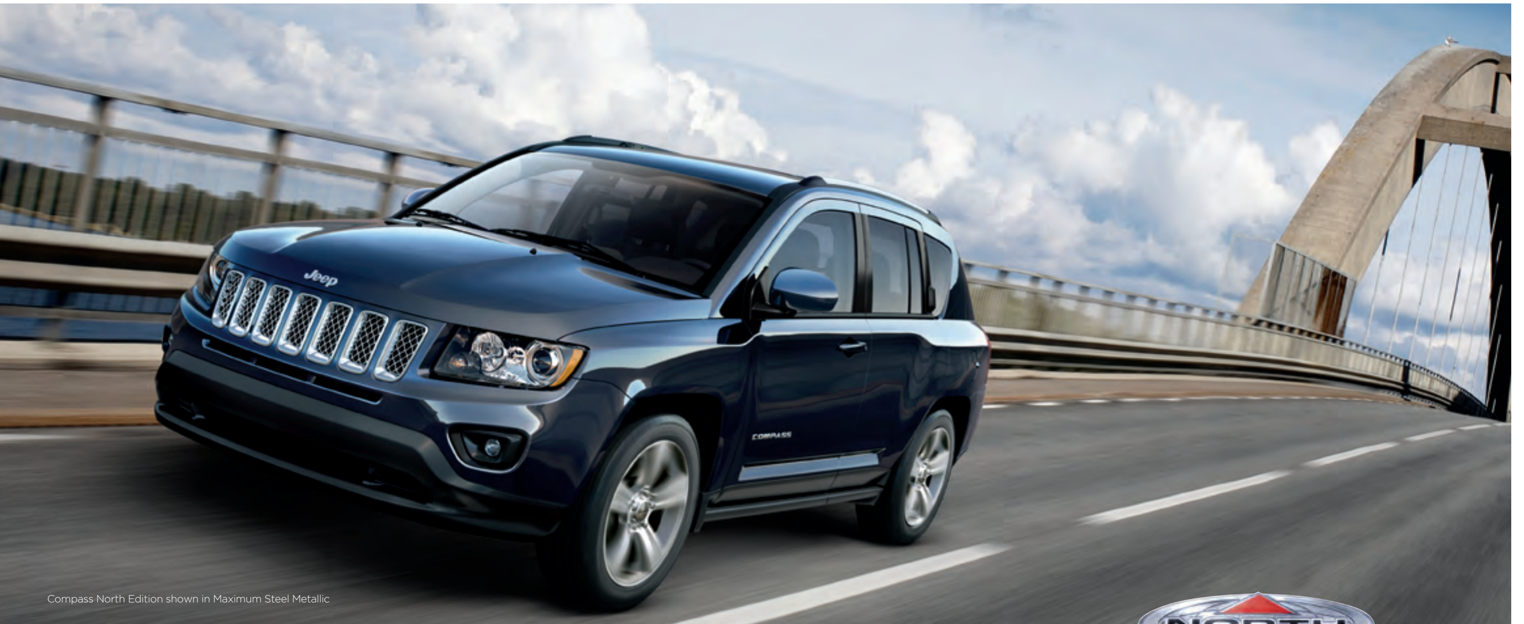
Compass North Edition shown in Maximum Steel Metallic