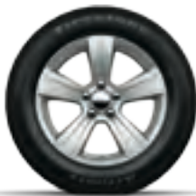
17-inch Aluminum Standard on Sport and North Edition with 2.4L engine. Available on Limited with Freedom Drive II® Off-Road Group