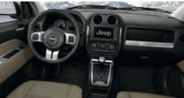
Sport mesh — Dark Slate Grey