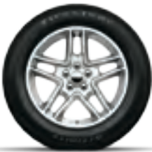
18-inch Aluminum Available on Limited