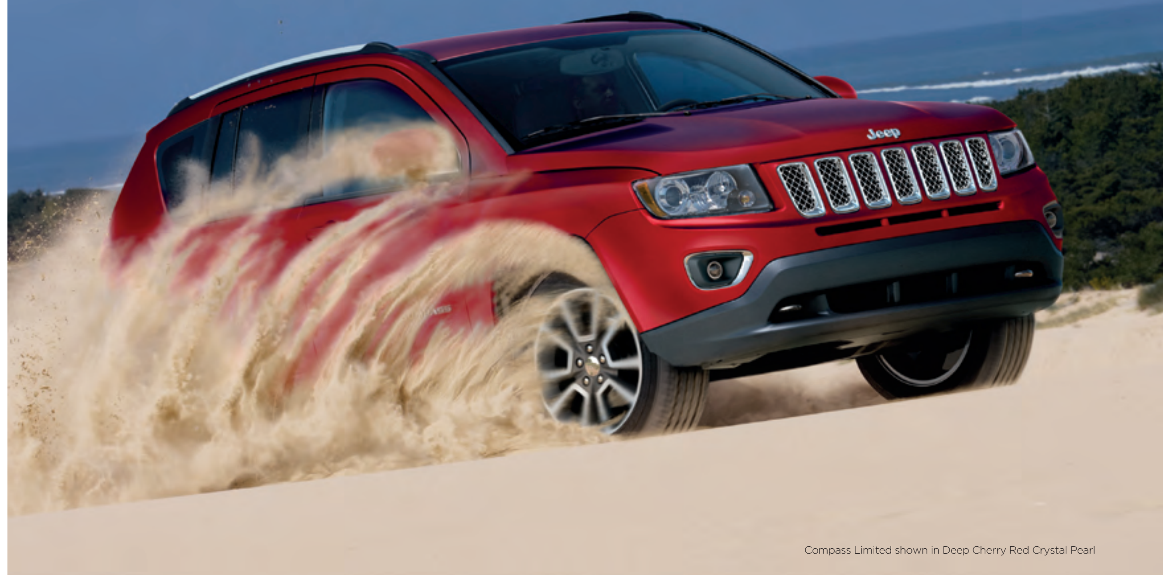
Compass Limited shown in Deep Cherry Red Crystal Pearl

This available system boasts a low range that provides the torque multiplication needed for water fording (3) managing steep grades, and crawling slowly in off-road events. Off-Road mode, included with CVT2, delivers an off-road-capable 19:1 crawl ratio.