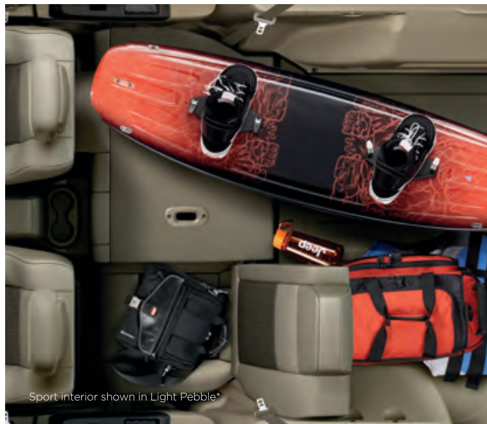
Sport interior shown in Light Pebble*