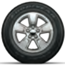
16-inch Machine-faced Aluminum Standard on Sport and North Edition with 2.0L engine