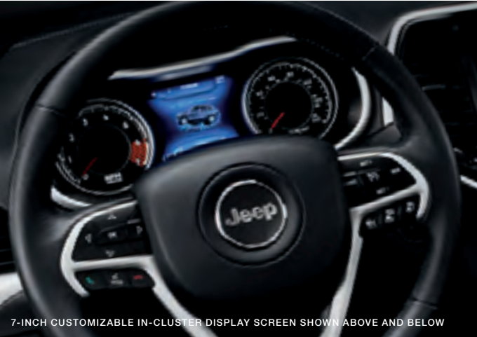
7-INCH CUSTOMIZABLE IN-CLUSTER DISPLAY SCREEN SHOWN ABOVE AND BELOW