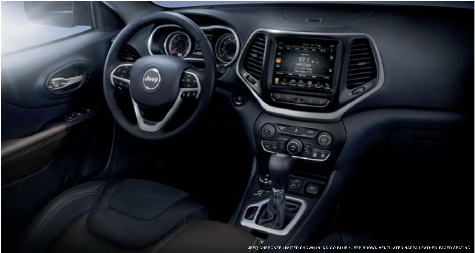
JEEP CHEROKEE LIMITED SHOWN IN INDIGO BLUE / JEEP BROWN VENTILATED NAPPA LEATHER-FACED SEATING

PREMIUM FEATURES AND DESIGNER PALETTES. Every sculpted inch of the all-new Cherokee has been thoughtfully designed to offer versatile convenience and absolute beauty. Five interior colour palettes offer choices inspired by exotic world locations, from Morocco to the Grand Canyon to Mt. Vesuvius. Luxurious Nappa leather-faced seating is available on optional power-adjustable, heated and ventilated seats, with hide-away storage for laptops and such — available within the fold-flat front-passenger seat. Soft-touch materials are featured on nearly every surface within reach. Convenient storage within the instrument panel, plus other cubby bins, offers plenty of places to keep important items neatly out of sight, including an integrated phone docking station and available wireless charging pad. The 60/40 split-folding second-row seats adjust fore and aft, and can recline six degrees, adapting to leg- and cargo-room needs. A new Jeep Cargo Management System offers unique options for customization, so you can make the most of Cherokee's roomy interior.