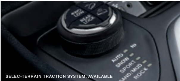
SELEC-TERRAIN TRACTION SYSTEM, AVAILABLE

1 A note about this brochure. All disclaimers can be found on the back cover.