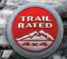
JEEP® CHEROKEE TRAILHAWK SHOWN IN GRANITE CRYSTAL METALLIC