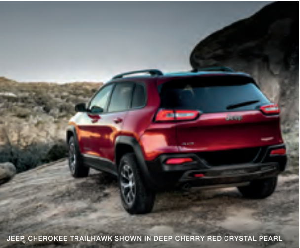
JEEP® CHEROKEE TRAILHAWK SHOWN IN DEEP CHERRY RED CRYSTAL PEARL