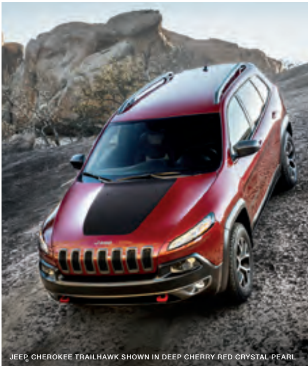
JEEP® CHEROKEE TRAILHAWK SHOWN IN DEEP CHERRY RED CRYSTAL PEARL