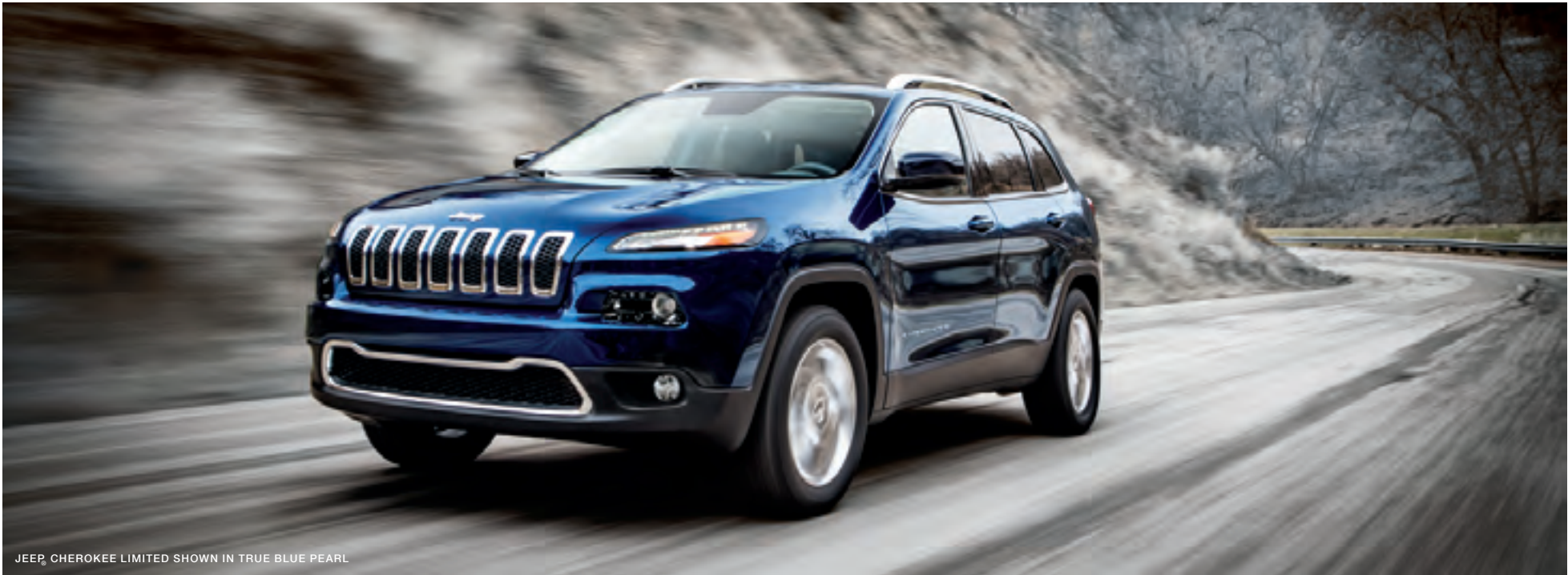
JEEP® CHEROKEE LIMITED SHOWN IN TRUE BLUE PEARL

AN ALL-NEW STANDARD OF ON-ROAD HANDLING. It was born to change the game, with a fresh and fluid new approach that honours its legendary heritage. It's sized and designed to move forward with authentic power, efficiency, and the latest advances in technology. The traditional seven-slot grille remains true to its Jeep brand roots, with daring, sleek daytime running lamps adding the next generation of safety and design distinction. Today, this all-new 2014 Jeep Cherokee moves forward with a new, class-exclusive 1 standard 9-speed automatic transmission that performs with strong, smooth precision. When it's paired with the refined, efficient new 2.4L TigerShark™ MultiAir® I-4 engine, it achieves up to an estimated 6.3 L/100 km (45 mpg) highway.* The new, available 3.2L Pentastar™ V6 engine churns out 271 hp and 239 lb-ft of torque, for efined Best-in-Class 1 towing power, plus up to an estimated 6.7 L/100 km (42 mpg) highway.*