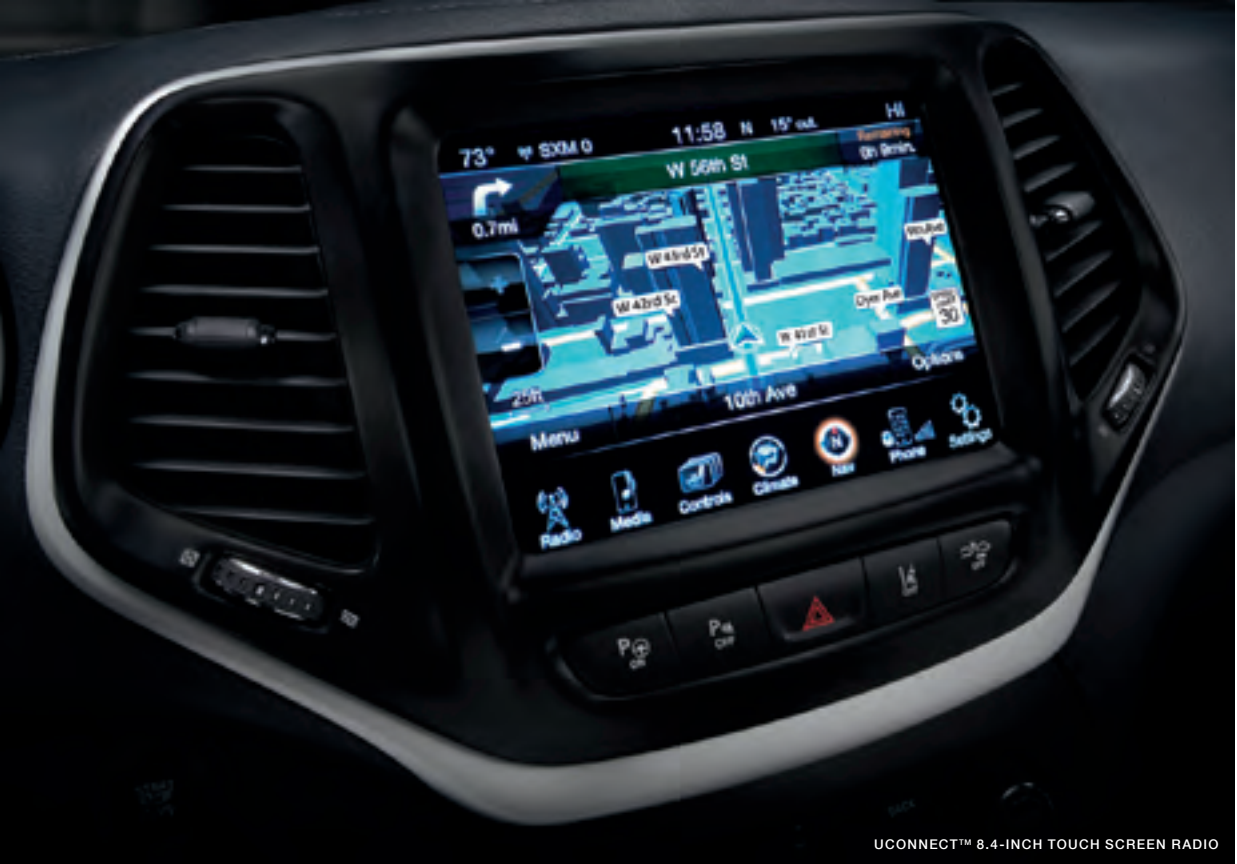
UCONNECT™ 8.4-INCH TOUCH SCREEN RADIO