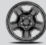
16" steel wheels, painted low-gloss black (standard)