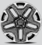
17" aluminium wheels (standard)