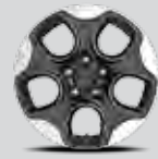
16" aluminium wheels, diamond cut and painted granite crystal (optional)