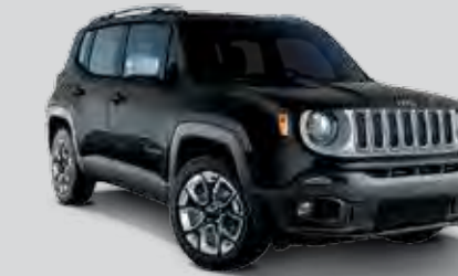
Carbon Black Metallic