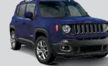
Jet Set Blue Metallic