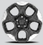
16" aluminium wheels (standard)