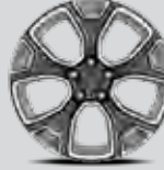
18" aluminium wheels (optional)