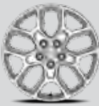
17" aluminium wheels (standard)