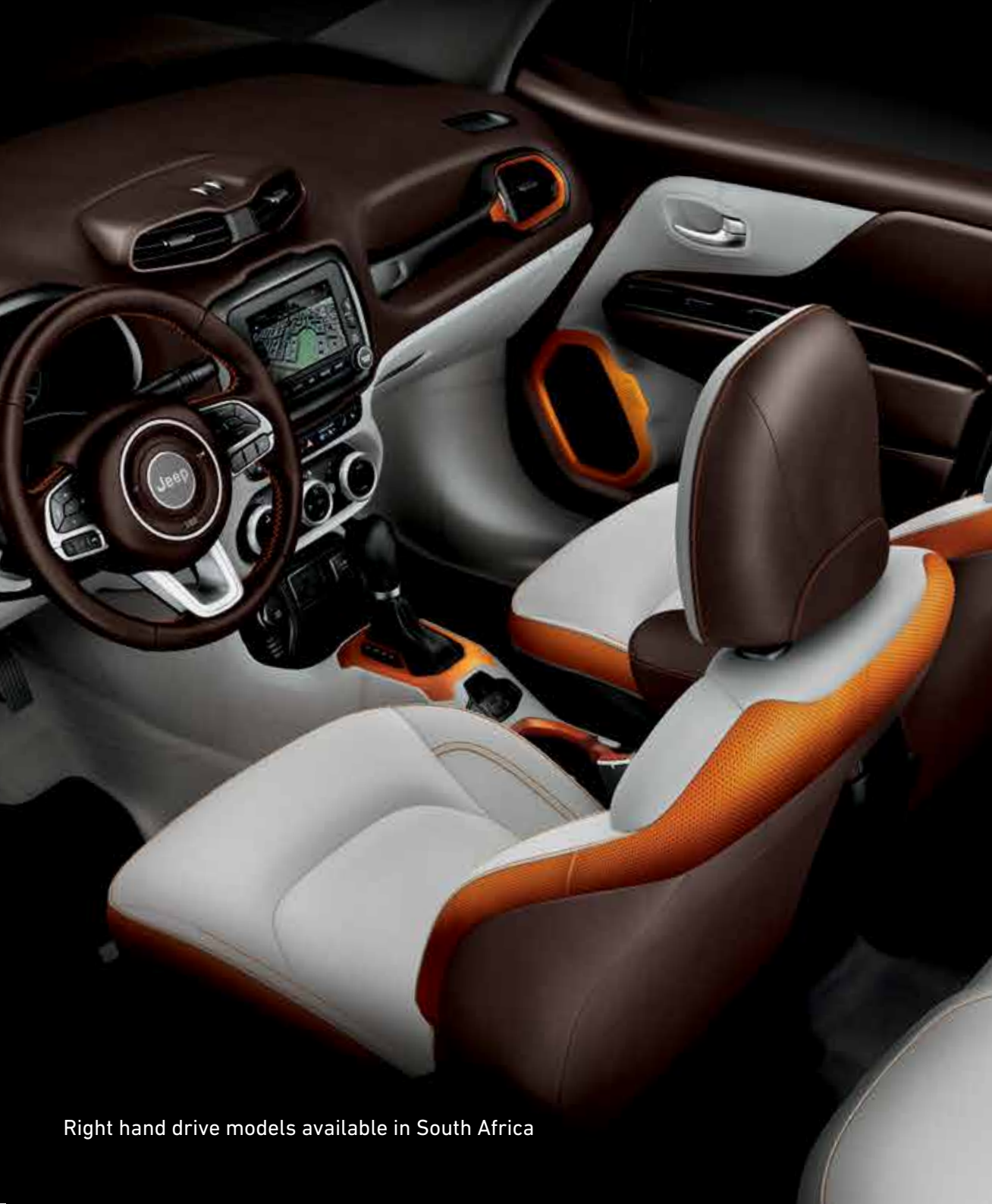
Right hand drive models available in South Africa

Its design theme is defined by intersections of soft and tactile forms with gritty and functional details. The electric parking brake is operated by a switch mounted in the centre console. The sculpted soft-touch instrument panel intersects with bold functional elements like the passenger grab handle, itself inspired by the legendary Jeep® Wrangler. Together, they create a unique sculpted element.