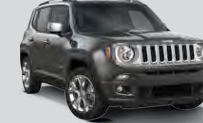
Granite Crystal Metallic