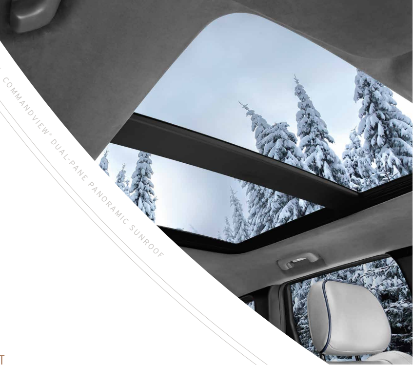
COMMANDVIEW® DUAL-PANE PANORAMIC SUNROOF