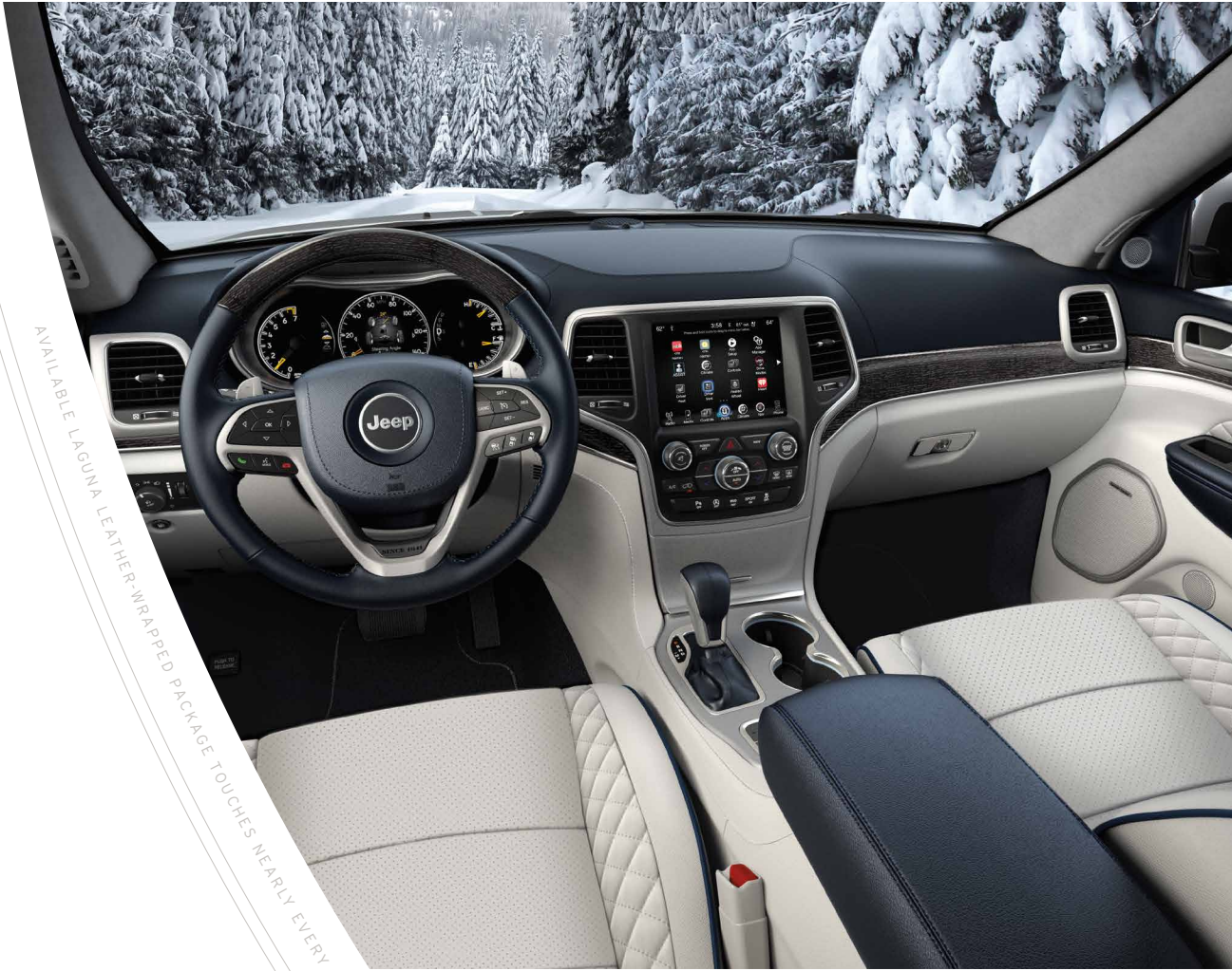
AVAILABLE LAGUNA LEATHER-WRAPPED PACKAGE TOUCHES NEARLY EVERY CABIN SURFACE