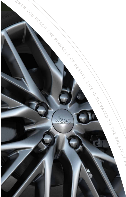
WHEN YOU REACH THE PINNACLE OF BEAUTY, LIFE IS ELEVATED TO THE GREATEST HEIGHTS