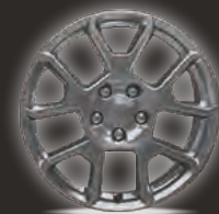
17" ALUMINIUM WHEEL