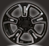
16" ALUMINIUM WHEEL