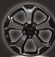
17" ALUMINIUM WHEEL