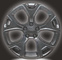
18" ALUMINIUM WHEEL