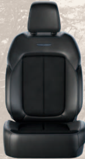
Capri Leatherette seat with Light Tungsten accent stitching — Global Black (Included with Altitude Package)