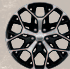
21-inch machined-face/Gloss Black-painted aluminum wheel (Included with Summit Reserve Group on 2-row models)