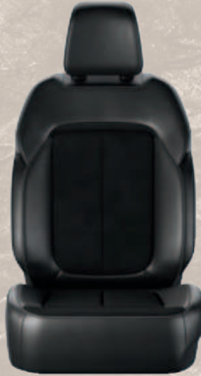
Capri Leatherette and Perforated Suede seat with Light Tungsten accent stitching — Global Black (Standard)