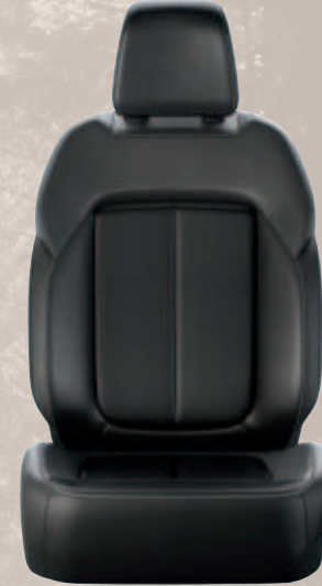
Ventilated Capri Leatherette and Axis II perforated seat with Light Tungsten accent stitching — Global Black (Included with Luxury Tech Group II and Anniversary Edition)