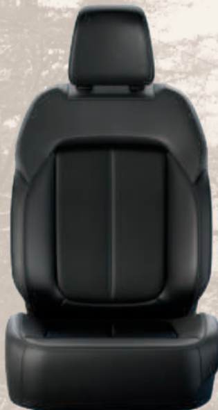
Capri Leatherette seat with Light Tungsten accent stitching — Global Black (Standard)