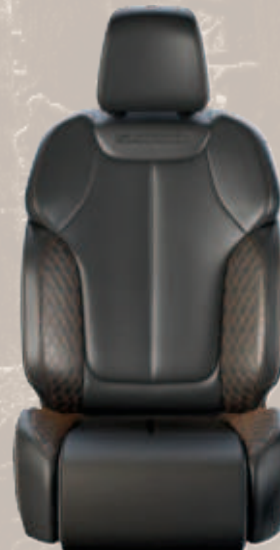
Vented Palermo Leather seat with Quilted Palermo Leather Bolsters and Cognac accent stitching, Steel Grey piping and embossed Summit logo — Global Black (Included with Summit Reserve Group)