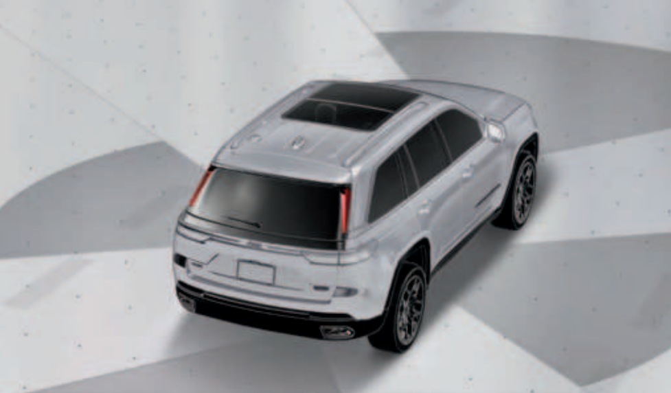
HANDS-FREE ACTIVE DRIVING ASSIST SYSTEM 21