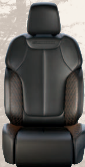
Vented Nappa Leather seat with Quilted Nappa Leather Bolsters and Cognac accent stitching, Steel Grey piping and embossed Summit logo — Global Black (Standard)