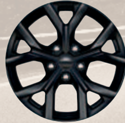
18-inch Gloss Black-painted aluminum wheel (Included with Altitude Package)