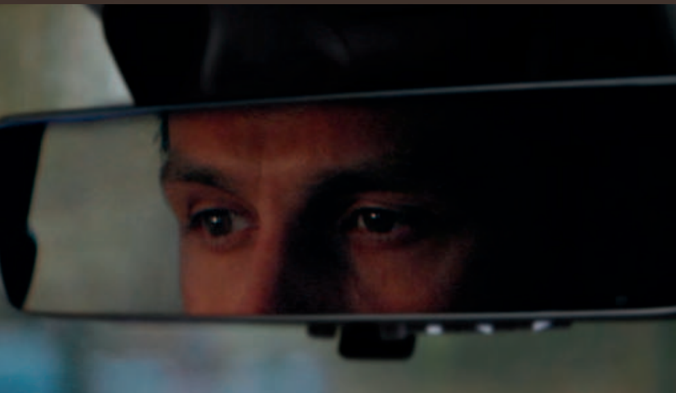
DROWSY-DRIVER DETECTION 21