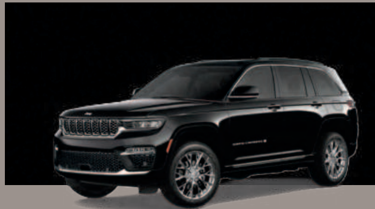
Diamond Black Crystal Pearl