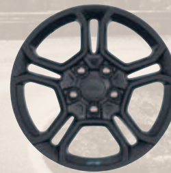
18-inch Granite Crystal fully painted aluminum wheel (Included with Anniversary Edition)