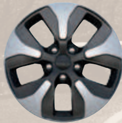
18-inch machined-face aluminum wheel with Black Noise-painted pockets (Standard)