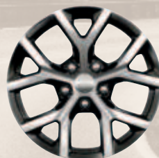
18-inch polished/painted aluminum wheel with High-Gloss Black pockets (Standard)