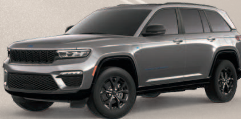
4xe Altitude in Baltic Grey Metallic