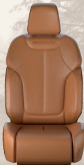
Vented Nappa Leather seat with Quilted Nappa Leather Bolsters and Cognac accent stitching, Global Black piping and embossed Summit logo — Tupelo/Black (Standard)