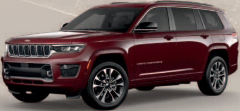
3-Row Overland in Velvet Red Pearl