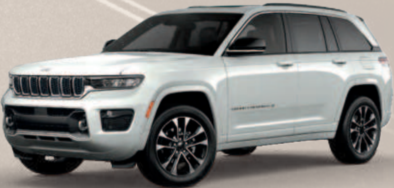
Overland® in Bright White