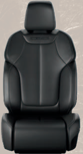
Ventilated Nappa Leather and Axis II perforated seat with Light Tungsten accent stitching and embossed Overland logo — Global Black (Included with Luxury Tech Group IV)