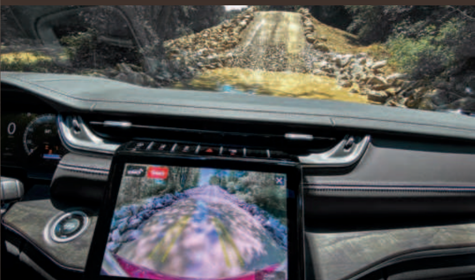
FRONT-FACING OFF-ROAD CAMERA 21