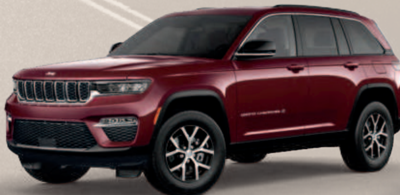
Limited in Velvet Red Pearl