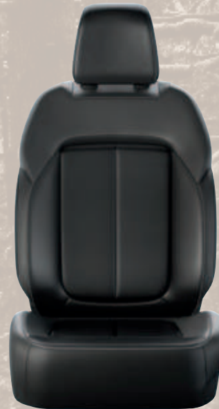
Ventilated Capri Leatherette and Axis II perforated seat with Light Tungsten accent stitching — Global Black (Included with Luxury Tech Group II)