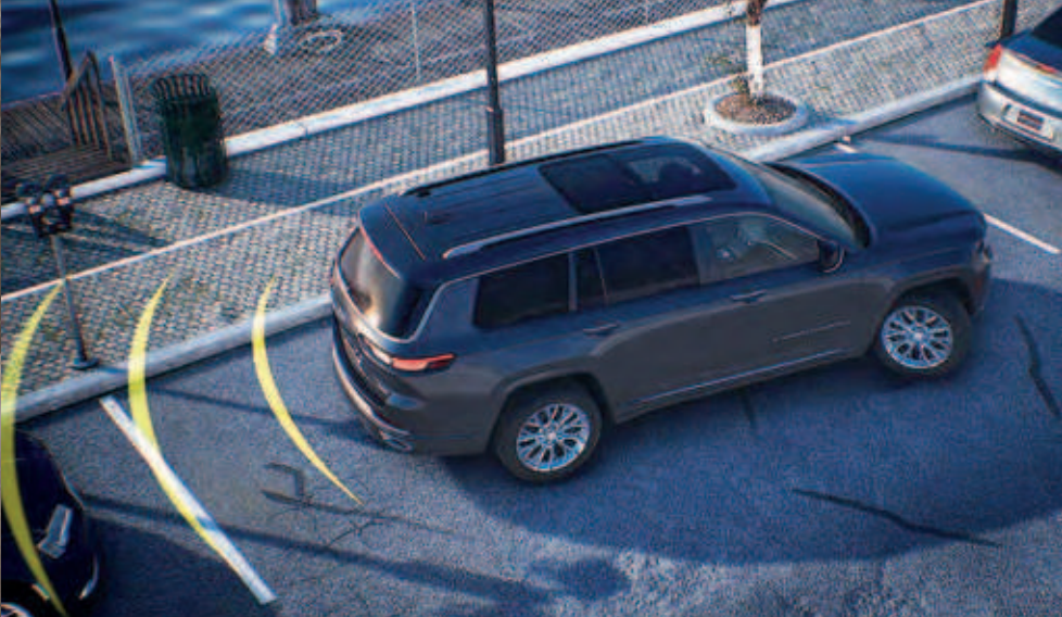
PARALLEL AND PERPENDICULAR PARK ASSIST 21