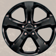
20-inch Gloss Black-painted aluminum wheel (Included with Altitude Package)