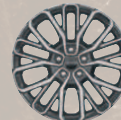
21-inch machined-face/Granite Crystal-painted aluminum wheel (Included with Summit Reserve Group on 3-row models)