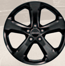
20-inch Gloss Black-painted aluminum wheel (Available with Altitude Package)