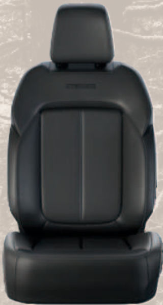
Ventilated Nappa Leather and Axis II perforated seat with Light Tungsten accent stitching and embossed Overland® logo — Global Black (Standard)