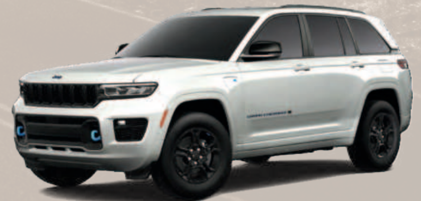
4xe Anniversary Edition in Bright White