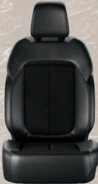
Capri Leatherette and Perforated Suede seat with Light Tungsten accent stitching — Global Black (Included with Altitude Package)