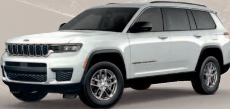
3-Row Laredo in Bright White