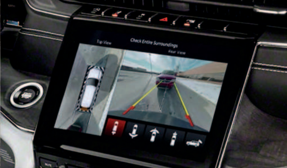
360° SURROUND-VIEW CAMERA SYSTEM 22

PARALLEL AND PERPENDICULAR PARK ASSIST 21 This active guidance system controls steering automatically using ultrasonic sensors that help you ease into parking spots. Includes Park-Sense ® Front Park Assist 21 sensors. Available.