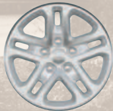
17-inch Fine Silver fully painted aluminum wheel (Standard on 2-row models)