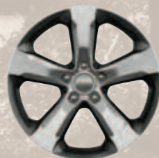
20-inch Technical Grey-painted machined aluminum wheel (Available)