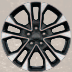
20-inch machined-face aluminum wheel with Black Noise-painted pockets (Standard)