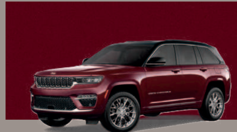
Velvet Red Pearl