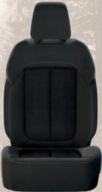
Origin and Essence Cloth seat with Light Tungsten accent stitching — Global Black (Standard)