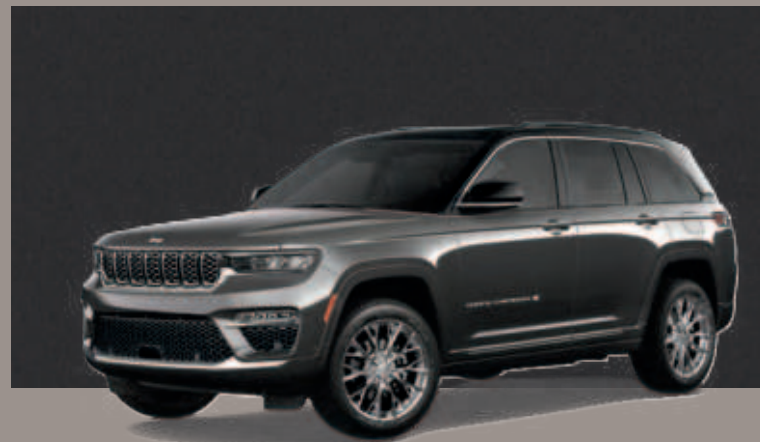
Baltic Grey Metallic