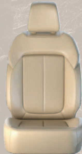
Ventilated Capri Leatherette and Axis II perforated seat with Light Tungsten accent stitching — Global Black/Wicker Beige (Included with Luxury Tech Group II)