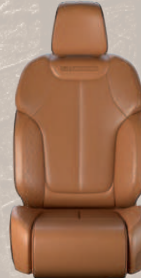
Vented Palermo Leather seat with Quilted Palermo Leather Bolsters and Cognac accent stitching, Global Black piping and embossed Summit logo — Tupelo/Black (Included with Summit Reserve Group)