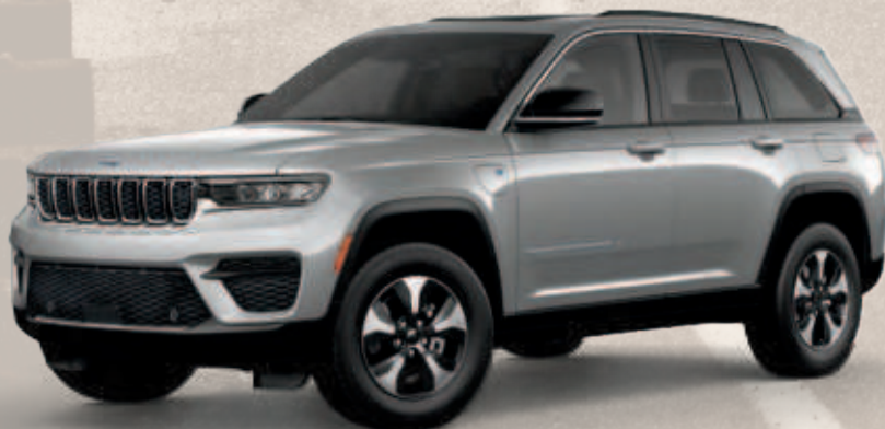
4xe in Silver Zynith