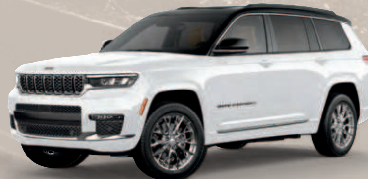
3-Row Summit in Bright White