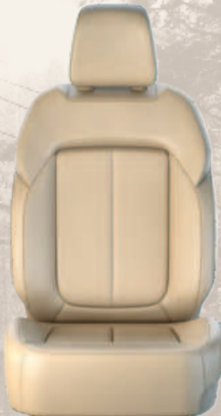
Capri Leatherette seat with Light Tungsten accent stitching — Global Black/Wicker Beige (Standard)