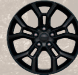
20-inch Black-painted aluminum wheel (Available with Anniversary Edition)