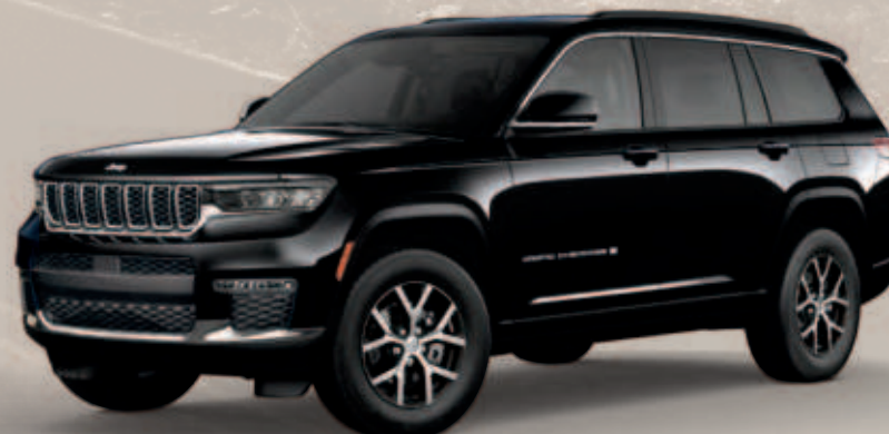
3-Row Limited in Diamond Black Crystal Pearl