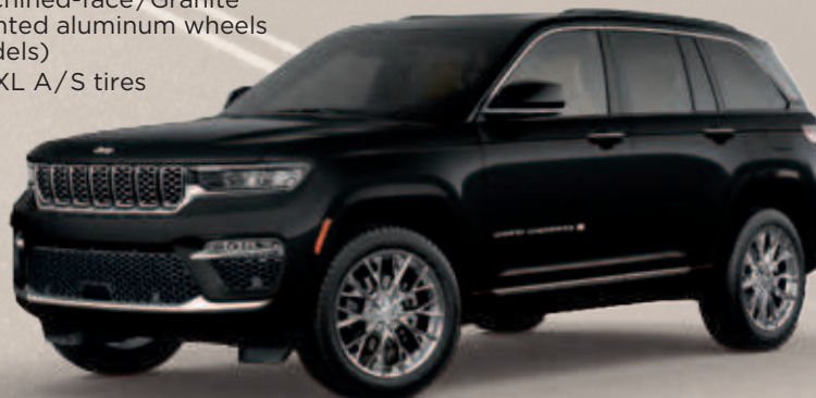
Summit in Diamond Black Crystal Pearl