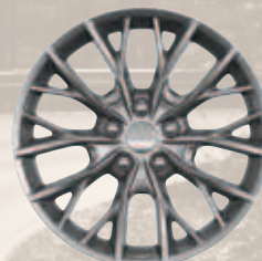
20-inch Silver Lithos fully painted aluminum wheel (Standard)