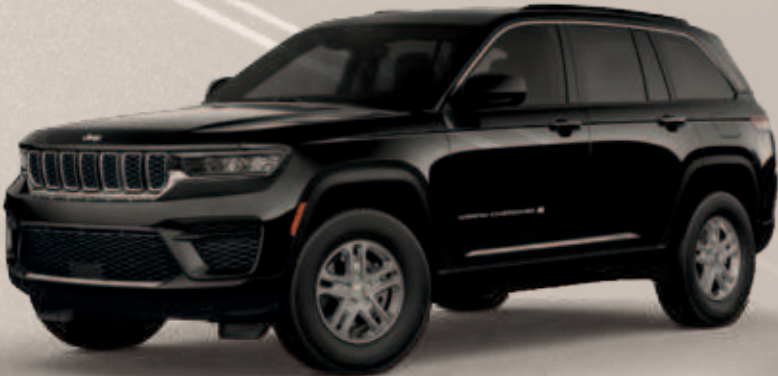
Laredo in Diamond Black Crystal Pearl