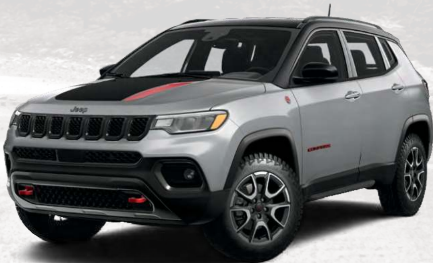
Trailhawk® in Silver Zynith Metallic