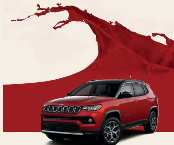
Red Hot Pearl