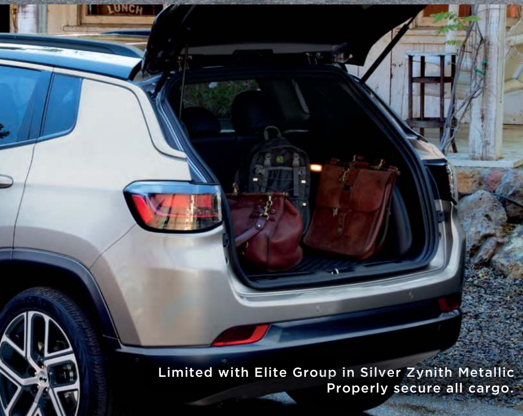
Limited with Elite Group in Silver Zynith Metallic. Properly secure all cargo.