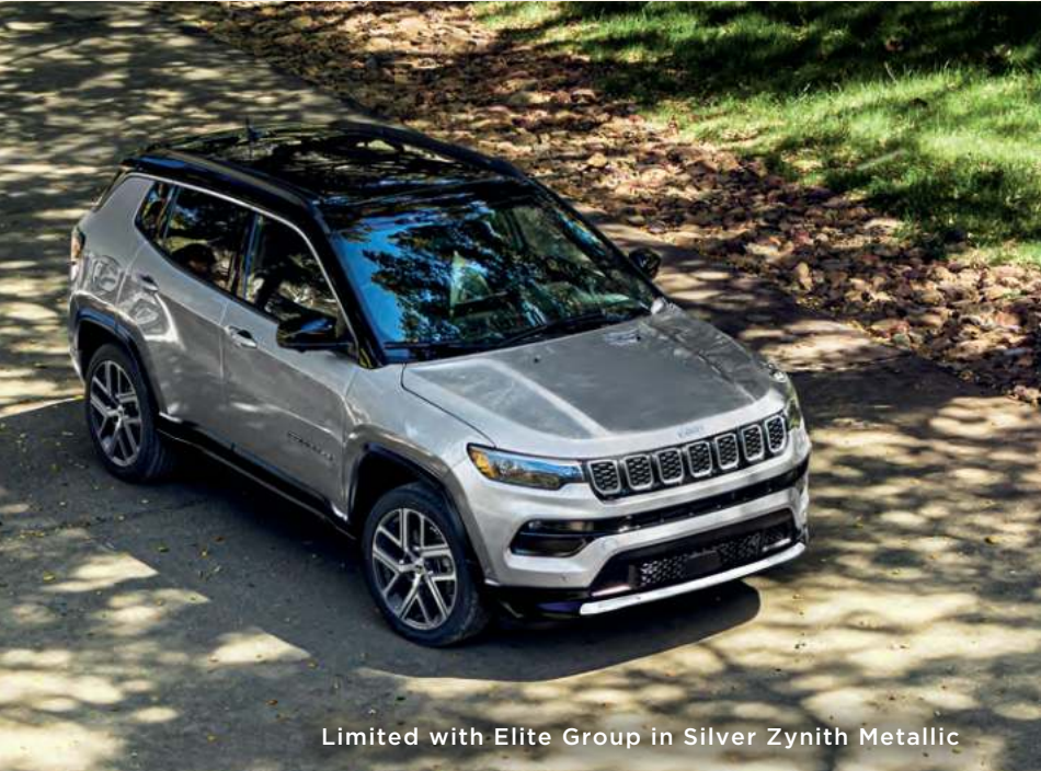
Limited with Elite Group in Silver Zynith Metallic