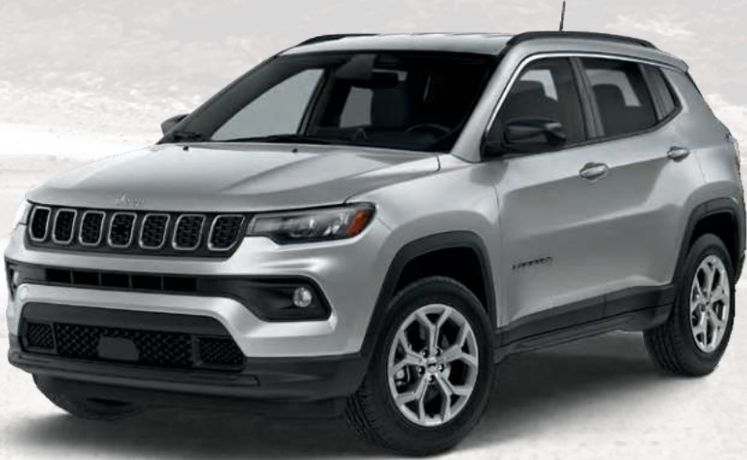
North in Silver Zynith Metallic