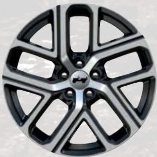
19-inch Diamond-Cut aluminum wheels with Gloss Black pockets (available with Elite Group)