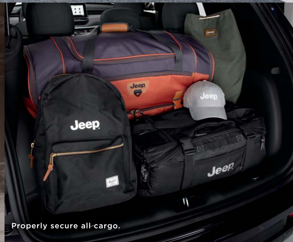
Properly secure all cargo.

Whatever your plans, Jeep® Compass is always flexible. Its available, motion-activated Open 'n Go rear liftgate conveniently opens by simply swiping your foot under the rear bumper, freeing up your hands to load in packages, bags or boxes into the cargo area. Thoughtful interior design includes a configurable 60 / 40 split-folding rear seat that easily converts to carry people, cargo and gear according to your needs. The height-adjustable rear cargo floor can lower to accommodate tall items or raise up for easy slide-in loading.