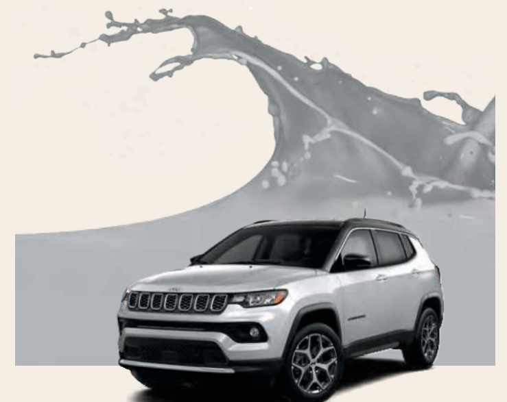
Silver Zynith Metallic