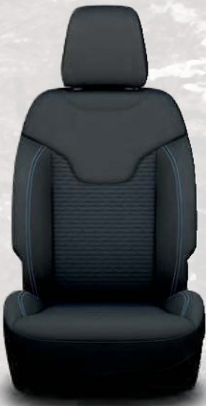
Sedoso and Kimberlite cloth seats with Bright Blue accent stitching — Black (standard)