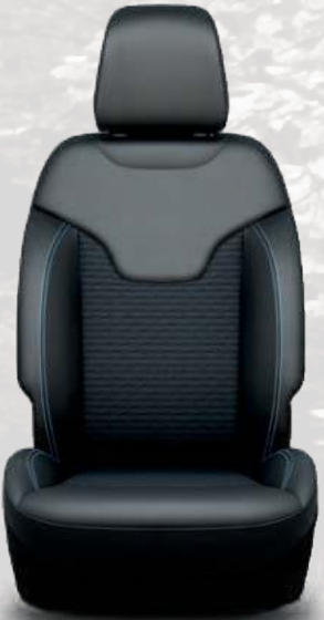
McKinley vinyl and Kimberlite cloth seats — Black (standard on Altitude Special Edition)