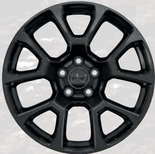
18-inch Gloss Black-painted aluminum wheels (standard on Altitude Special Edition)