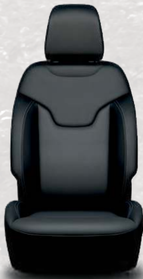
McKinley leather-faced seats with Steel Grey accent stitching — Black/Grey and Black/Sepia (standard)

DRIVER ASSISTANCE GROUP I: Wireless charging pad, 10.25-inch, digital, full-colour DID, Adaptive Cruise Control with Stop and Go,¹⁰ Park-Sense Front and Rear Park Assist System,¹⁰ 360° Surround-View Camera System,¹⁴ Parallel and Perpendicular Park and Unpark Assist System,¹⁰ Traffic Sign Recognition¹⁵ and Highway Assist System¹⁶