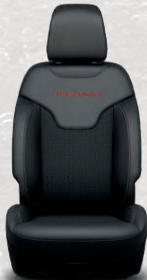
McKinley leather-faced and Spectre cloth seats with embroidered Trailhawk® logo and Ruby Red and Tungsten dual accent stitching — Black (standard)

TRAILHAWK® ELITE: Uconnect 5 NAV Infotainment System with 10.1-inch touchscreen, LED low- / high-beam projector headlamps, premium LED taillamps and fog lamps, 10.25-inch, digital, full-colour DID, power-adjustable driver's and front-passenger seats, leather-faced seats, driver's-seat memory, ventilated front seats, Trailer Tow Group, wireless charging pad, Adaptive Cruise Control with Stop and Go¹⁰, Highway Assist System¹⁶, Traffic Sign Recognition¹⁵, Park-Sense Front and Rear Park Assist System¹⁰, reversible carpet / vinyl rear cargo mat, 360° Surround-View Camera System¹⁴ and Parallel and Perpendicular Park and Unpark Assist System¹⁰