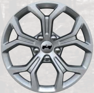
17-inch Fine Silver-painted aluminum wheels (standard)