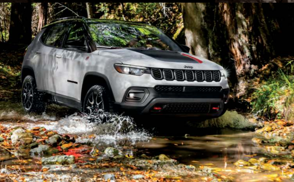
Trailhawk ® in Bright White