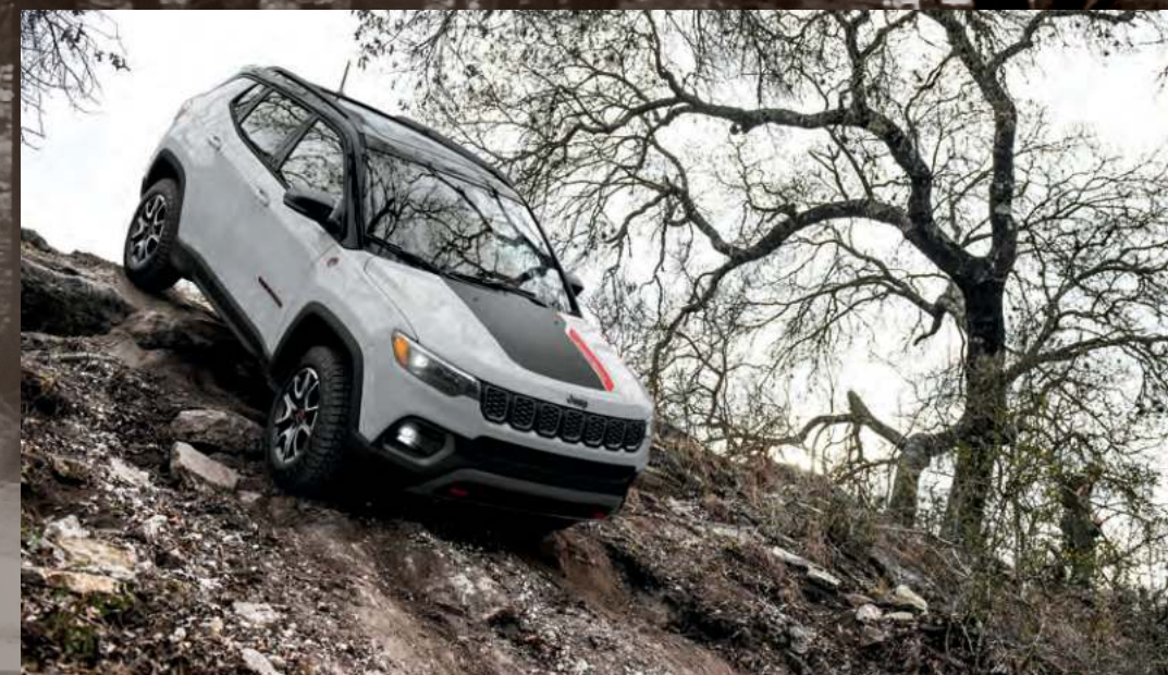
Trailhawk in Bright White