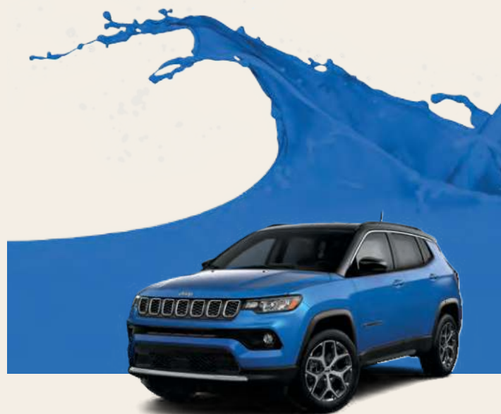
Hydro Blue Pearl