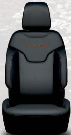
Ventilated McKinley leather-faced seats with embroidered Trailhawk logo and Ruby Red and Tungsten dual accent stitching — Black (available with Trailhawk Elite)