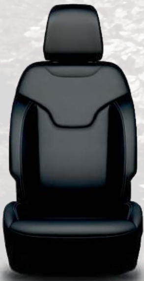
Ventilated McKinley leather-faced seats with Bright Blue accent stitching — Black/Grey (available with Elite Group)