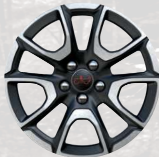
17-inch Diamond-Cut aluminum wheels with Satin Black pockets (standard)