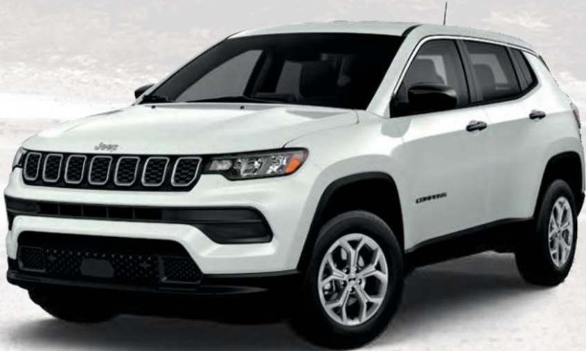
Sport in Bright White