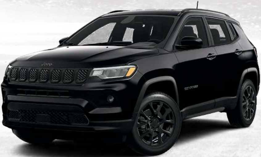
Altitude Special Edition in Diamond Black Crystal Pearl