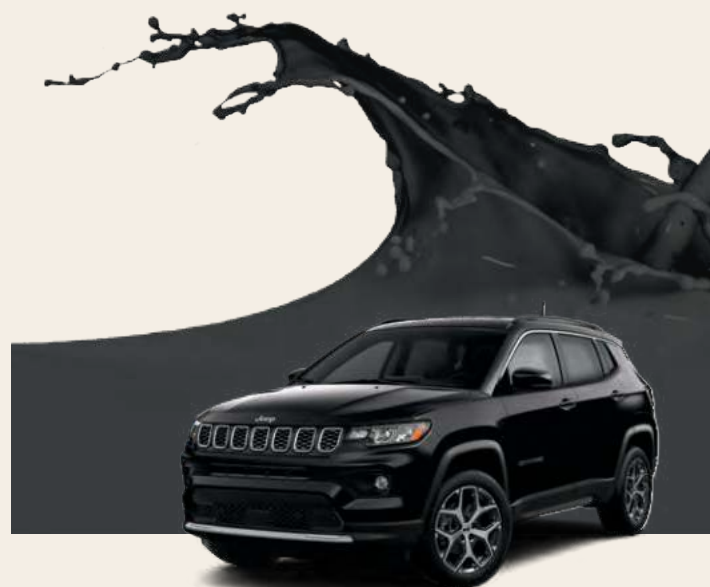
Diamond Black Crystal Pearl