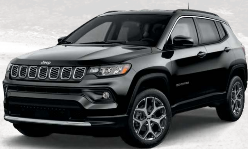
Limited in Diamond Black Crystal Pearl