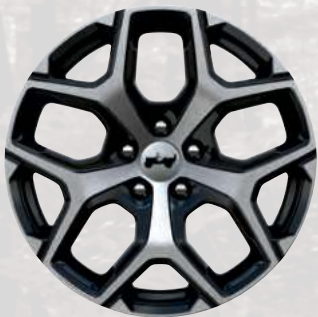
18-inch painted Diamond-Cut aluminum wheels (standard)