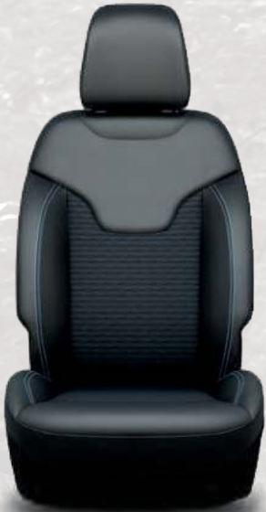
McKinley vinyl and Kimberlite cloth seats with Bright Blue accent stitching — Black (standard)

ALTITUDE SPECIAL EDITION: Piano Black interior accents, Neutral Grey exterior badging, Black grille with Neutral Grey rings, Black DLO mouldings, 10.25-inch, digital, full-colour DID, Uconnect 5 NAV Infotainment System with 10.1-inch touchscreen, power driver's seat, Black Addax vinyl-wrapped instrument panel mid-bolster, Light Tungsten interior accent stitching, 18-inch Gloss Black-painted aluminum wheels and 225 / 55R18 BSW All-Season tires