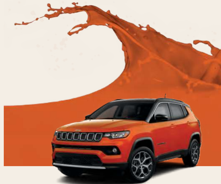
Joose (limited availability)