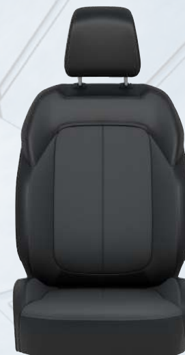
Sicily Leatherette with Axis II Perforations, Blue Agave/Wine Dual Accent Stitching and Rouge Piping — Global Black (Standard)