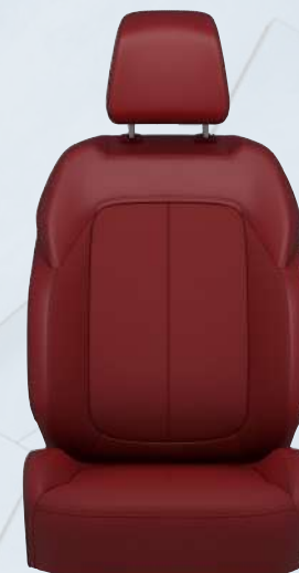
Sicily Leatherette with Axis II Perforations, Blue Agave/Light Slate Gray Dual Accent Stitching and Frost Piping — Black/Radar Red (Available)