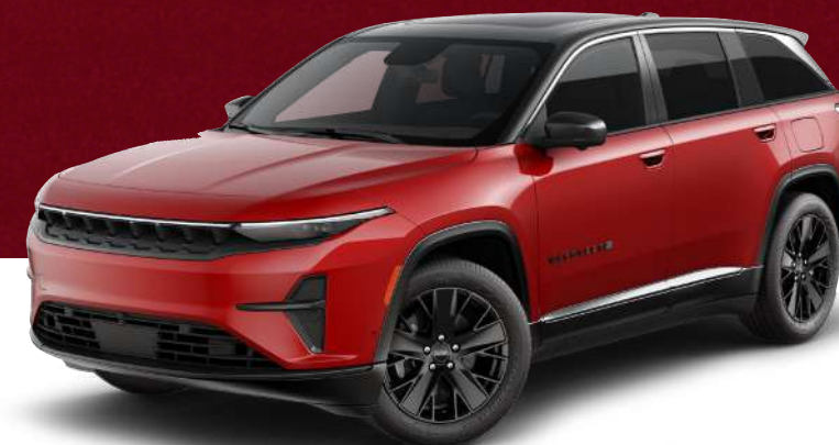
Red Hot Pearl