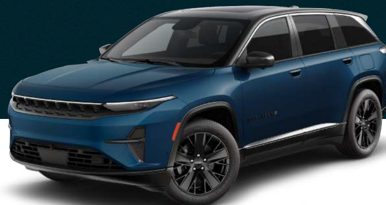
Fathom Blue Pearl