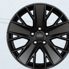
20-inch Gloss Black-Painted Aluminum (Standard)