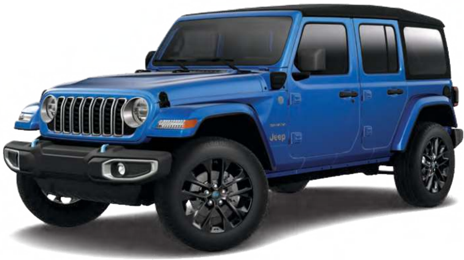
Wrangler 4DR Sahara® 4xe in Hydro Blue