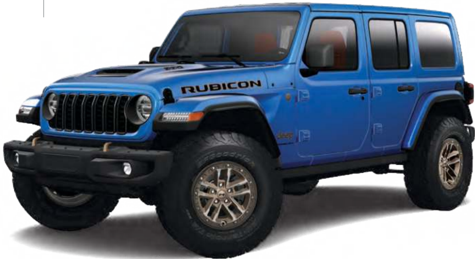
Wrangler 4DR Rubicon® 392 in Hydro Blue