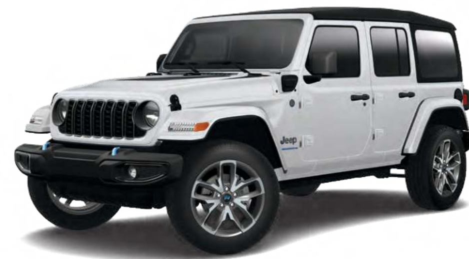
Wrangler 4DR Sport S 4xe in Bright White