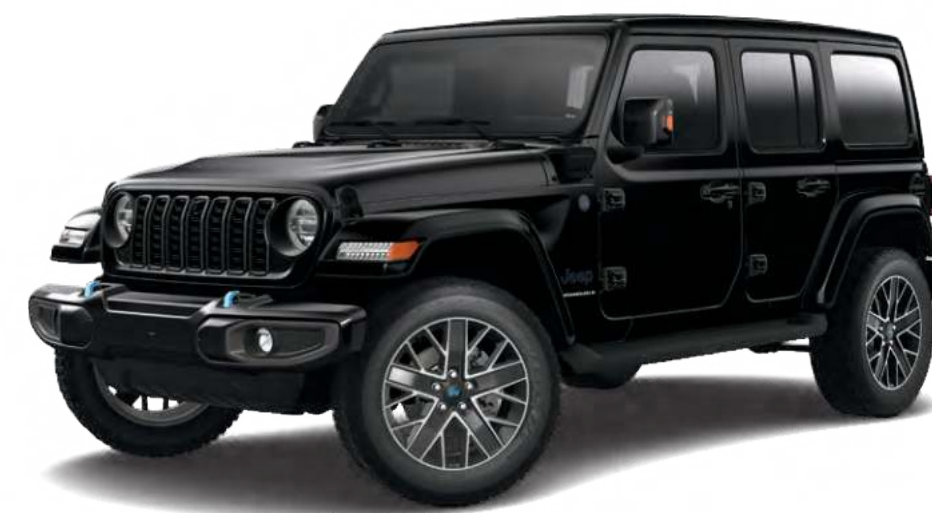
Wrangler 4DR High Altitude 4xe in Black