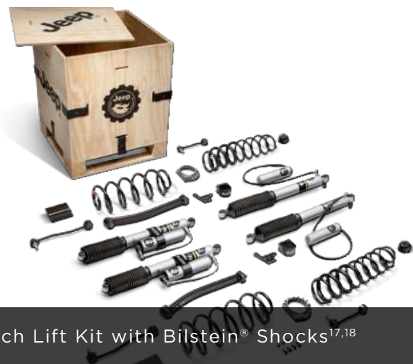
2-inch Lift Kit with Bilstein ® Shocks 17,18

JEEP ® WRANGLER RUBICON ® IN HYDRO BLUE FEATURES TUBE DOOR KIT, TUBE DOOR MIRROR KIT, JEEP PERFORMANCE PARTS ROCK RAILS, 17-INCH BEADLOCK-CAPABLE WHEELS WITH FUNCTIONAL BEADLOCK RINGS, GRILLE AND WINCH GUARD HOOP, FRONT GRAB HANDLES, 5- AND 7-INCH LED OFF-ROAD LIGHT KITS, WINCH GUARD LIGHT MOUNTING BRACKETS AND LOWER A-PILLAR LIGHT MOUNTING BRACKETS