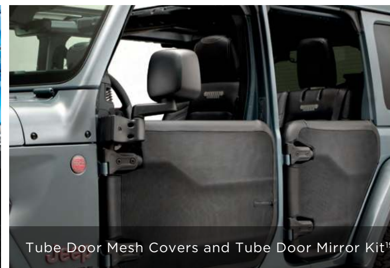
Tube Door Mesh Covers and Tube Door Mirror Kit 19