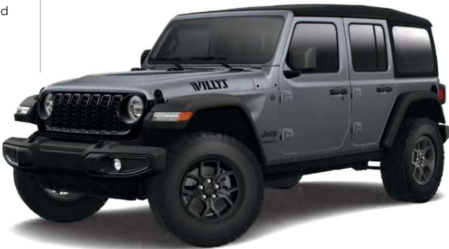
Wrangler 4DR Willys in Anvil