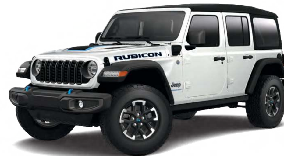
Wrangler 4DR Rubicon® 4xe in Bright White