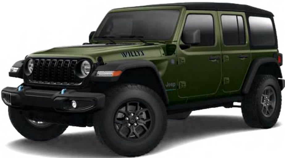
Wrangler Willys 4xe in Sarge