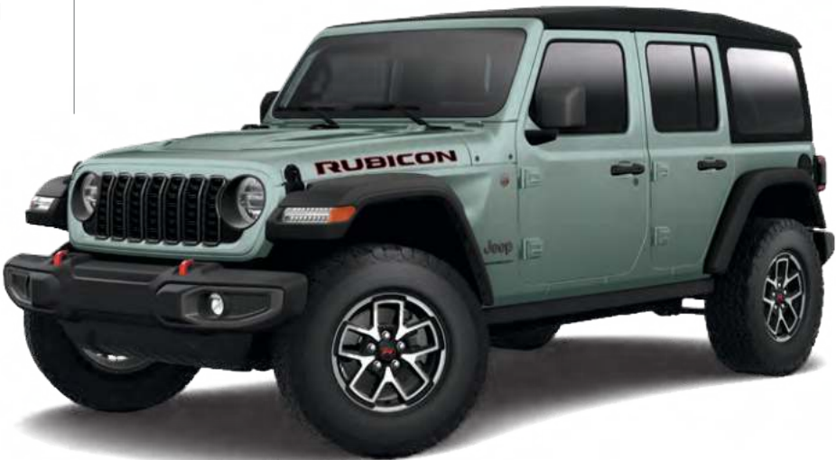
Wrangler 4DR Rubicon® in Earl