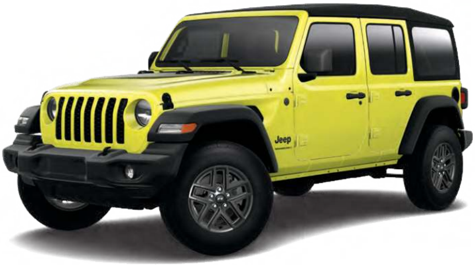
Wrangler 4DR Sport S in High Velocity