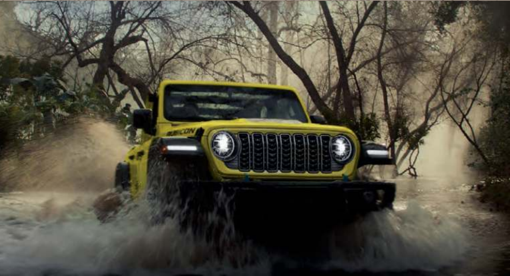
*Colors may not be available on all models and may be limited / restricted.