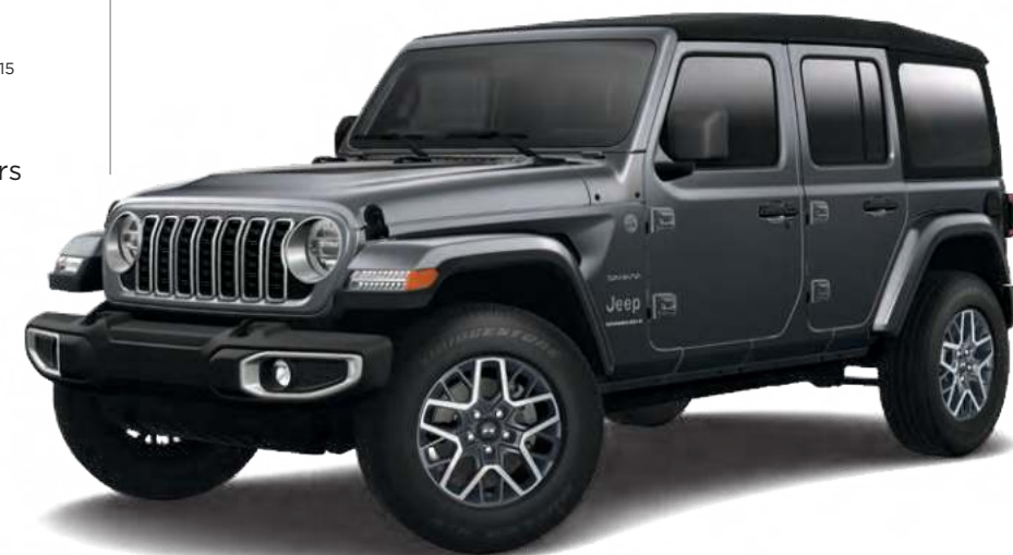
Wrangler 4DR Sahara® in Granite Crystal Metallic