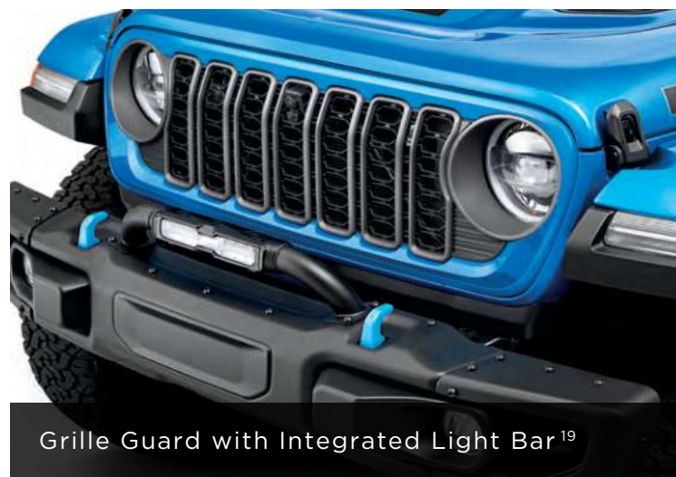
Grille Guard with Integrated Light Bar 19