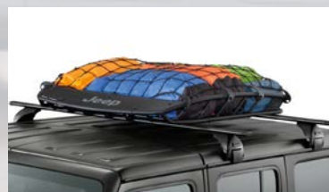
Roof Rack Kit