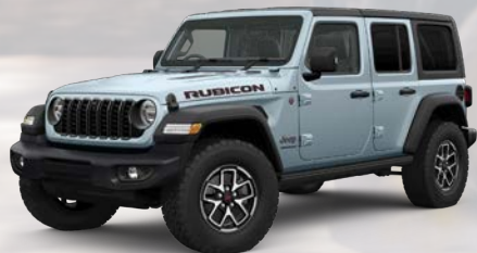
PGP - Earl (Option)