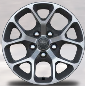
WFH 17-Inch Machined Wheels with Black Pockets (Standard on Sport S)