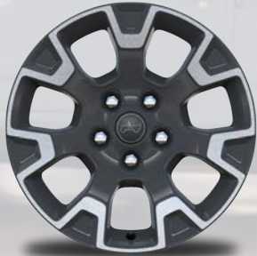
WPD 18-Inch Machined Painted Grey Wheels (Optional on Overland)