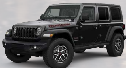
PX8 - Black (Option)