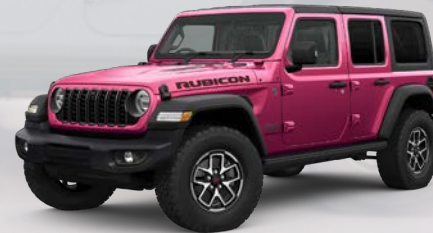
PHP - Tuscadero (Option) From March 2024 production