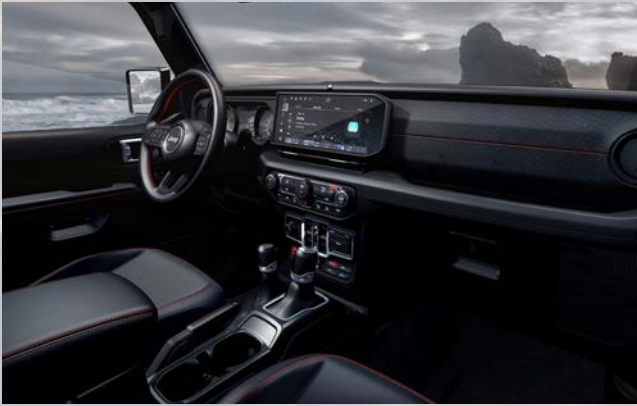
VLX9 - Black Nappa Leather Trimmed Bucket Seats (Standard - Rubicon)