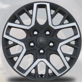
WPA 18-Inch Machined Painted Grey Wheels (Standard on Overland)