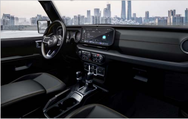
BPX9 - Black McKinley Premium with Jeep Logo (Standard - Overland)