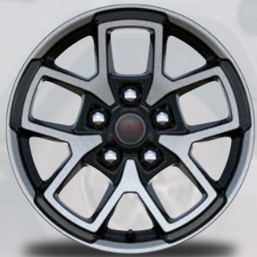
WFV 17-Inch Machined Painted Black Wheels (Standard on Rubicon)