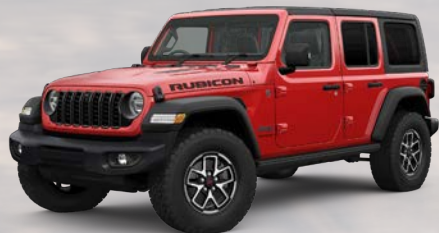
PRC - Firecracker Red (Option)