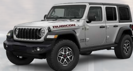
PSE - Silver Zynith (Option)