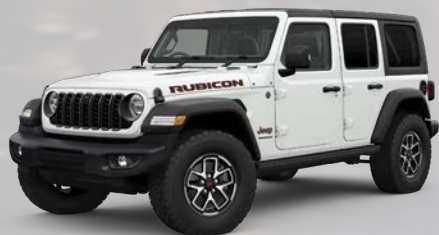
PW7 - Bright White (Standard)