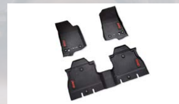
All Weather Mats

*Which occurs first. ^Please see Jeep.com.au ~When you service with Jeep