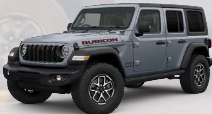
PDS - Anvil (Option)