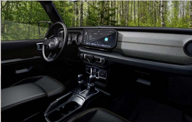
E7X9 - Black Cloth (Standard - Sport S)

Option (O) Standard (S) Not Available (-)