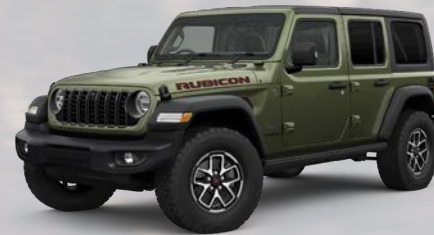
PGG - Sarge (Option)