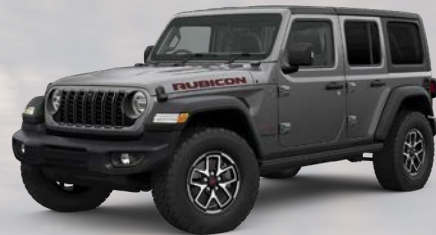
PAU - Granite Crystal (Option)