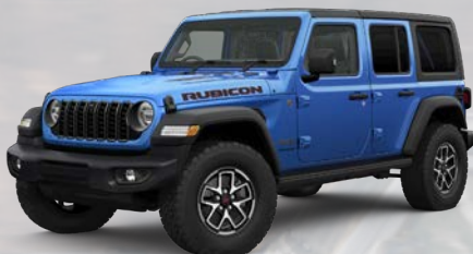
PBJ - Hydro Blue (Option)