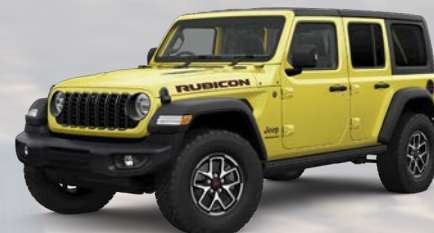
PJF - High Velocity (Option)