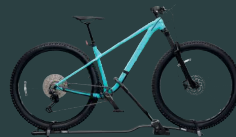
PRORIDE XT ROOFTOP BIKE RACK

Accommodates up to two snowboards, six pairs of skis or a combination of both.