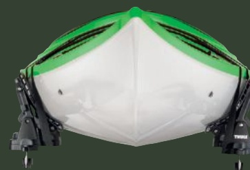
DOCKGRIP HORIZONTAL KAYAK RACK

Accommodates up to two kayaks, two stand up paddleboards or a combination of both.