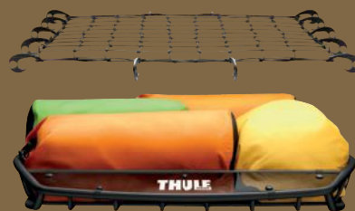
CANYON XT ROOF BASKET