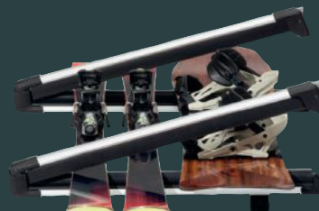
SNOWPACK L SKI AND SNOWBOARD RACK

Accommodates up to two snowboards, six pairs of skis or a combination of both.