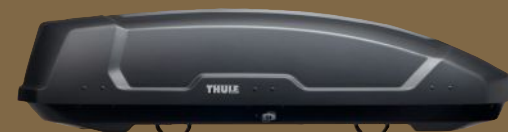
FORCE XT ROOF BOX Available in two sizes: L and XL.