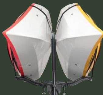
COMPASS VERTICAL KAYAK RACK

Accommodates up to two kayaks, two stand up paddleboards or a combination of both.