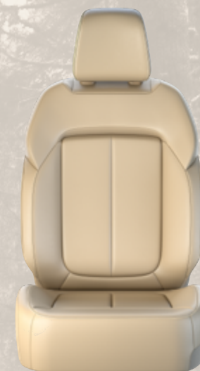
Capri Leatherette with Light Tungsten accent stitching — Global Black/Wicker Beige (Standard)