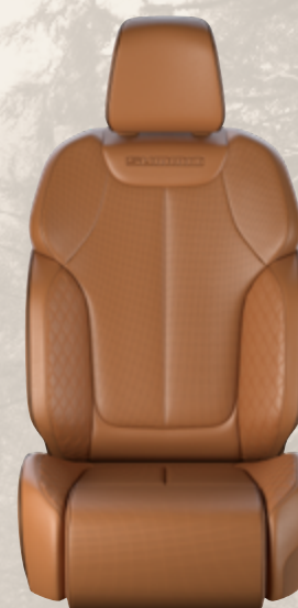
Ventilated Nappa Leather with Quilted Nappa Leather Bolsters and Cognac accent stitching, Global Black piping and embossed Summit logo — Tupelo/Black (Standard)