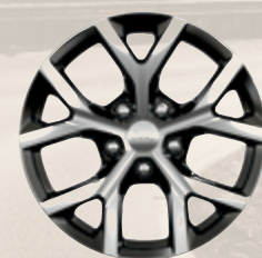
18-inch polished/painted aluminum with High-Gloss Black pockets (Standard)