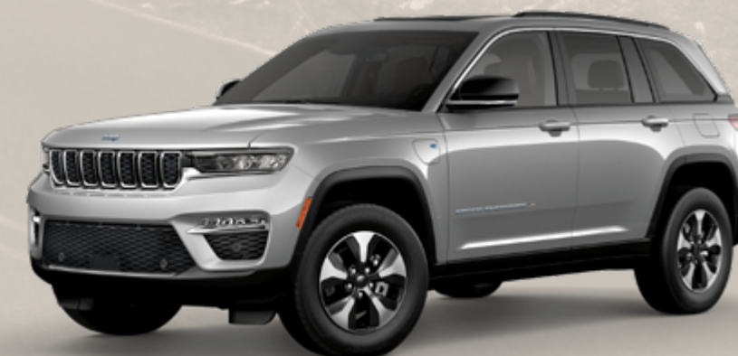
4xe in Silver Zynith