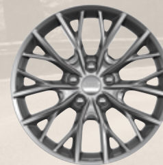
20-inch Silver Lithos fully painted aluminum (Standard)