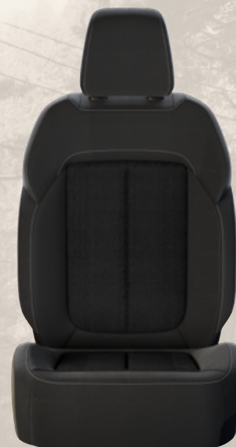
Origin and Essence Cloth with Light Tungsten accent stitching — Global Black (Standard)