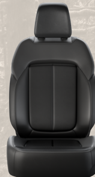
Ventilated Capri Leatherette and Axis II Perforations with Light Tungsten accent stitching — Global Black (Standard with Luxury Tech Group II)