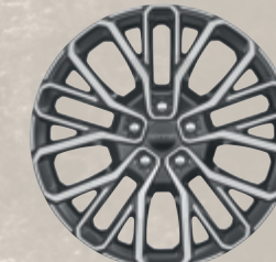
21-inch machined-face/Granite Crystal painted aluminum (Standard on 3-row with Summit Reserve Group)