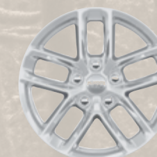
18-inch Fine Silver fully painted aluminum (Standard on 3-row models and Laredo X 2-row models; available on 2-row models)