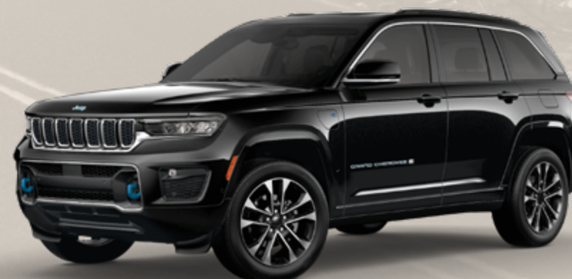
Overland® 4xe in Diamond Black Crystal Pearl