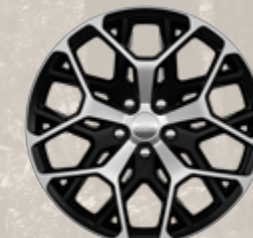
21-inch machined-face/Gloss Black-painted aluminum (Standard on 2-row with Summit Reserve Group)