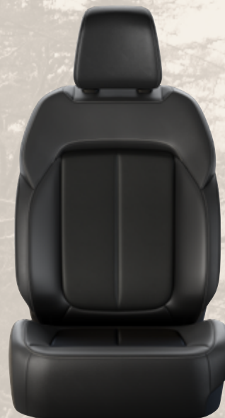
Capri Leatherette with Light Tungsten accent stitching — Global Black (Standard)