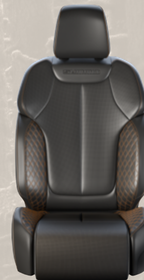
Ventilated Palermo Leather with Quilted Palermo Leather Bolsters and Cognac accent stitching, Steel Gray piping and embossed Summit logo — Global Black (Standard with Summit Reserve Group)