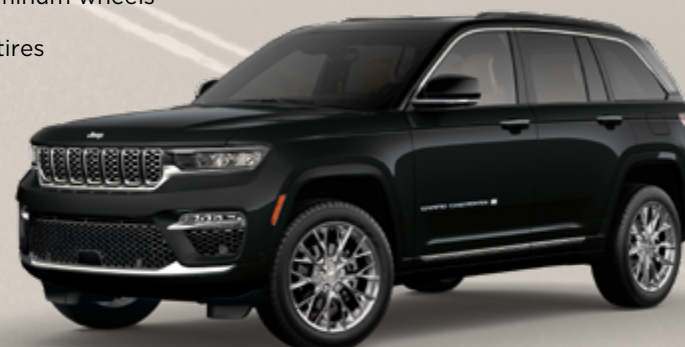
Summit in Diamond Black Crystal Pearl