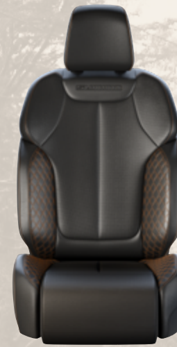
Ventilated Nappa Leather with Quilted Nappa Leather Bolsters and Cognac accent stitching, Steel Gray piping and embossed Summit logo — Global Black (Standard)