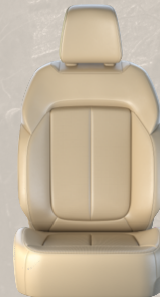
Ventilated Capri Leatherette and Axis II Perforations with Light Tungsten accent stitching — Global Black / Wicker Beige (Standard with Luxury Tech Group II)