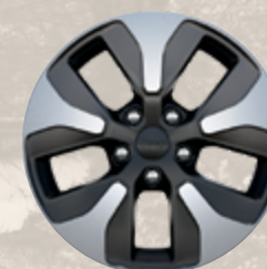
18-inch machined-face aluminum with Black Noise-painted pockets (Standard)