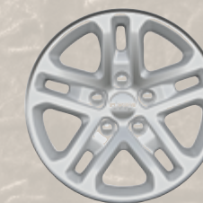
17-inch Fine Silver fully painted aluminum (Standard on 2-row models)