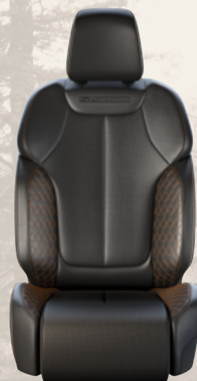
Ventilated Nappa Leather with Quilted Nappa Leather Bolsters and Cognac accent stitching, Steel Gray piping and embossed Summit logo — Global Black (Standard)