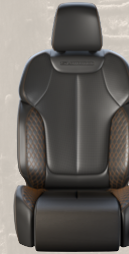
Ventilated Palermo Leather with Quilted Palermo Leather Bolsters and Cognac accent stitching, Steel Gray piping and embossed Summit logo — Global Black (Standard with Summit Reserve Group)