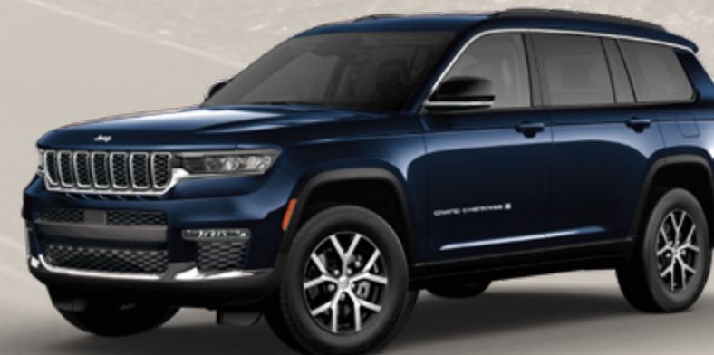
3-Row Limited in Midnight Sky