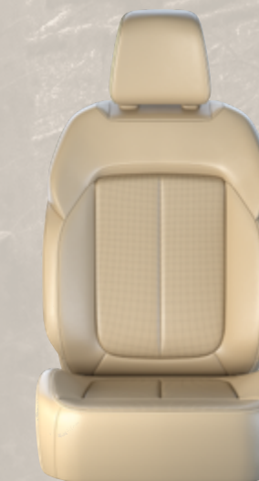
Ventilated Capri Leatherette and Axis II Perforations with Light Tungsten accent stitching — Global Black/Wicker Beige (Standard with Luxury Tech Group II)