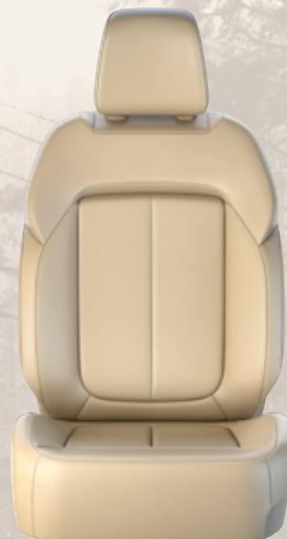
Capri Leatherette with Light Tungsten accent stitching — Global Black / Wicker Beige (Standard)