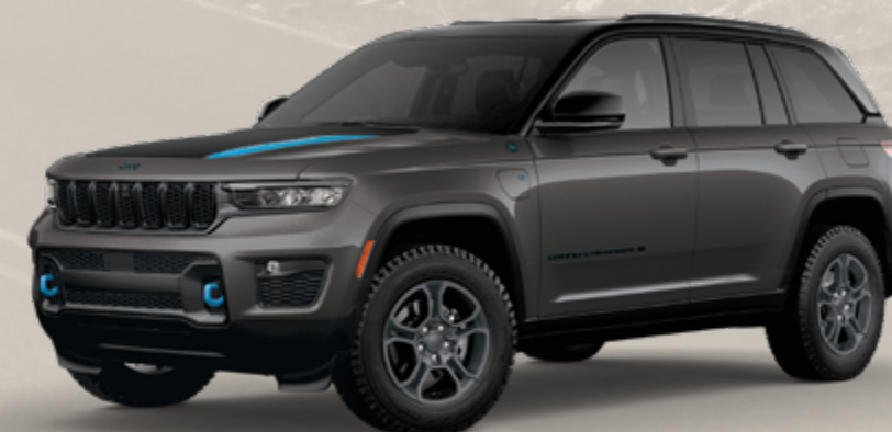
Trailhawk 4xe in Baltic Gray Metallic