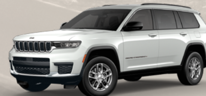
3-Row Laredo in Bright White