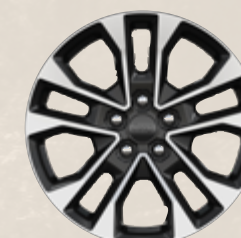
20-inch machined-face aluminum with Black Noise-painted pockets (Standard)