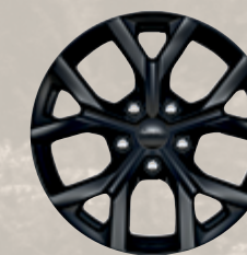
18-inch Gloss Black-painted aluminum (Standard on Altitude Package and Altitude X)