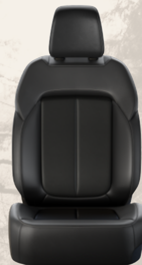
Capri Leatherette with Light Tungsten accent stitching — Global Black (Standard)