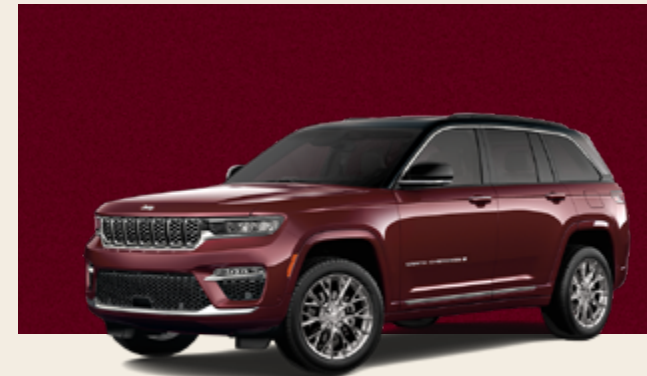
Velvet Red Pearl