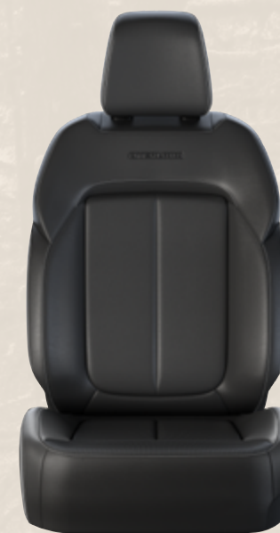
Ventilated Nappa Leather and Axis II Perforations with Light Tungsten accent stitching, Diesel Gray piping and embossed Overland logo — Global Black (Standard)