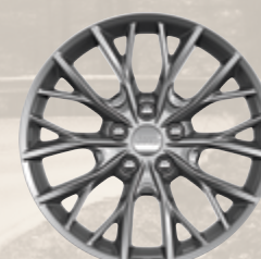
20-inch Silver Lithos fully painted aluminum (Standard)