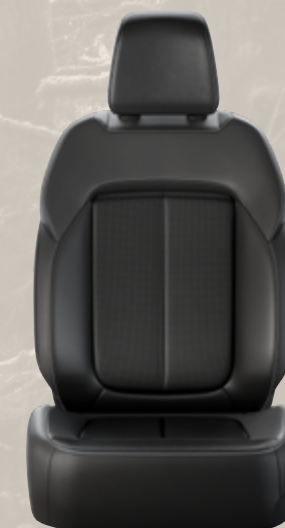
Ventilated Capri Leatherette and Axis II Perforations with Light Tungsten accent stitching — Global Black (Standard with Luxury Tech Group II and Anniversary Edition)