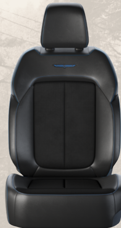
Ventilated Capri Leather and Axis II Perforated Suede with Surf Blue accent stitching — Global Black (Standard)