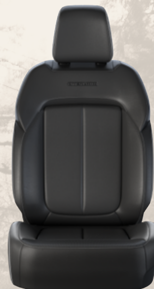
Ventilated Nappa Leather and Axis II Perforations with Light Tungsten accent stitching, Diesel Gray piping and embossed Overland logo — Global Black (Standard)