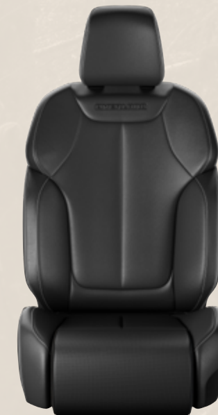
Ventilated Nappa Leather and Axis II Perforations with Light Tungsten accent stitching, Diesel Gray piping and embossed Overland logo — Global Black (Standard with Luxury Tech Group IV)