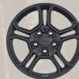
18-inch Granite Crystal fully painted aluminum (Standard)