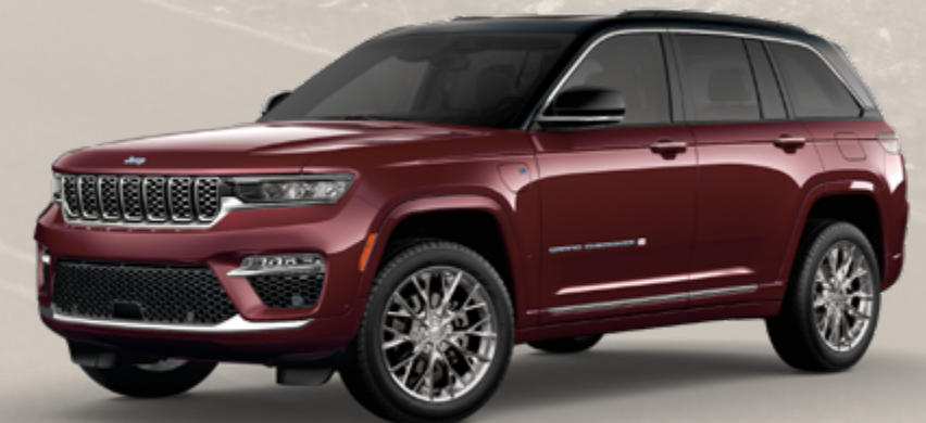
Summit 4xe in Velvet Red Pearl