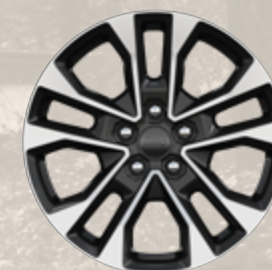
20-inch machined-face aluminum with Black Noise-painted pockets (Standard)