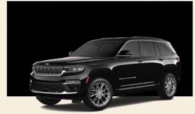
Diamond Black Crystal Pearl