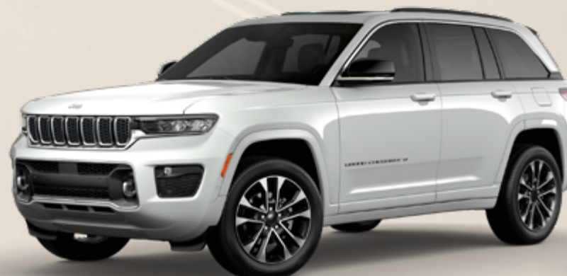
Overland® in Bright White