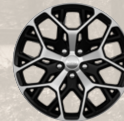
21-inch machined-face / Gloss Black-painted aluminum (Standard with Summit Reserve Group)