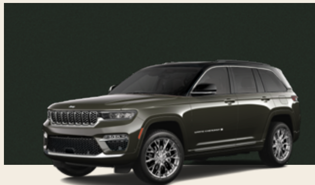
Rocky Mountain Pearl