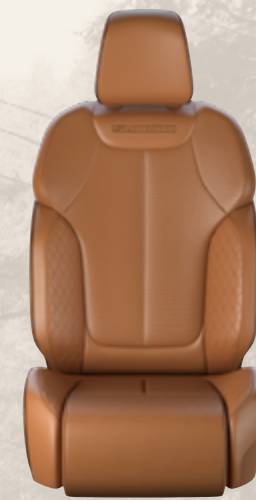
Ventilated Nappa Leather with Quilted Nappa Leather Bolsters and Cognac accent stitching, Global Black piping and embossed Summit logo — Tupelo/Black (Standard)