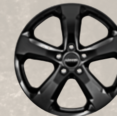
20-inch Gloss Black-painted aluminum (Standard with Black Appearance Package)