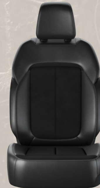
Capri Leatherette and Perforated Suede with Light Tungsten accent stitching — Global Black (Standard with Altitude X and Altitude Package)