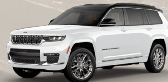
3-Row Summit in Bright White