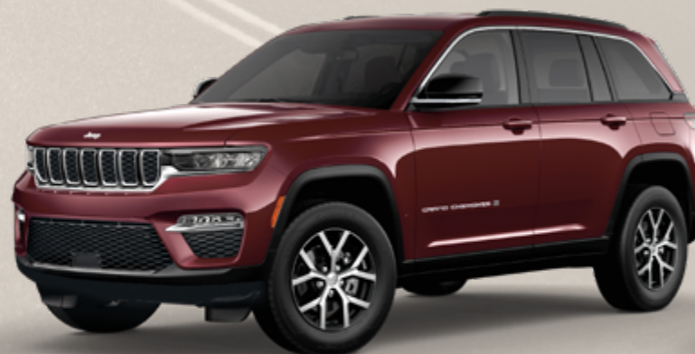
Limited in Velvet Red Pearl