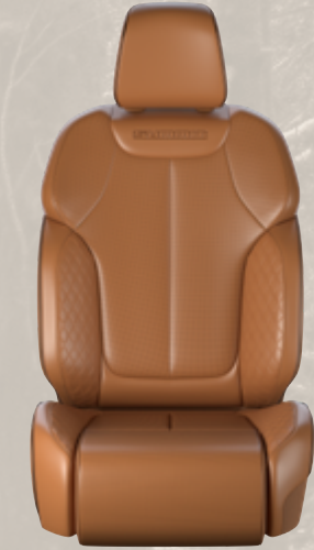
Ventilated Palermo Leather with Quilted Palermo Leather Bolsters and Cognac accent stitching, Global Black piping and embossed Summit logo — Tupelo / Black (Standard with Summit Reserve Group)