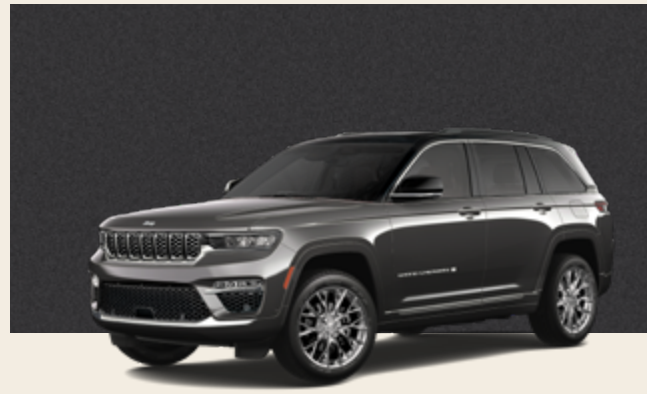
Baltic Gray Metallic