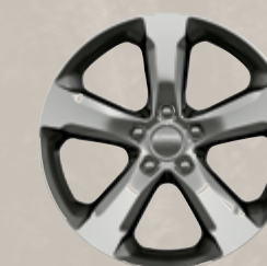
20-inch Technical Gray-painted machined aluminum (Available)