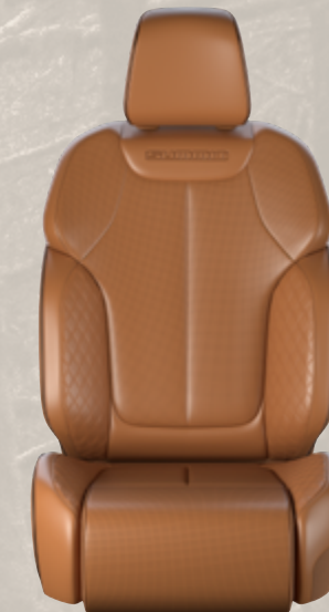
Ventilated Palermo Leather with Quilted Palermo Leather Bolsters and Cognac accent stitching, Global Black piping and embossed Summit logo — Tupelo/Black (Standard with Summit Reserve Group)