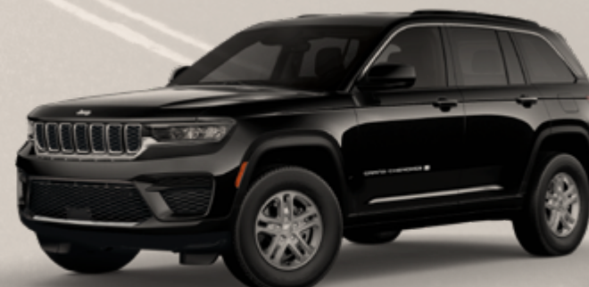
Laredo in Diamond Black Crystal Pearl