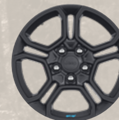
18-inch Granite Crystal fully painted aluminum (Standard with Anniversary Edition)