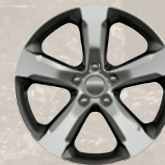
20-inch Technical Gray-painted machined aluminum (Available)