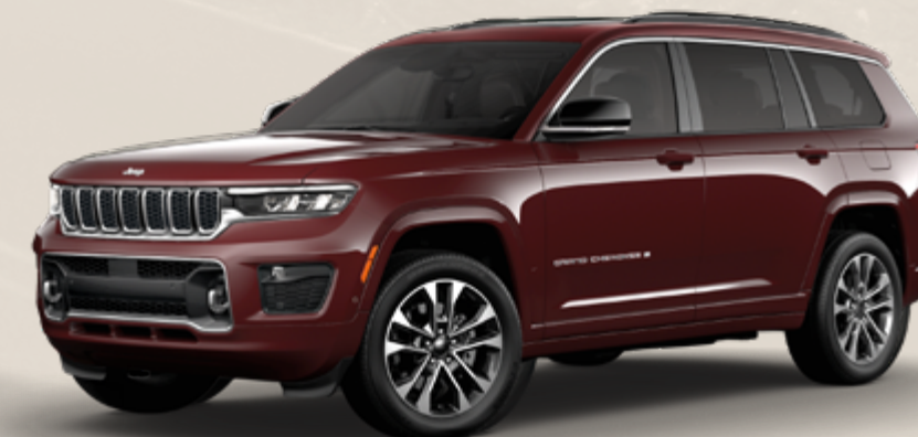
3-Row Overland in Velvet Red Pearl