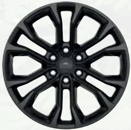
22-inch Gloss Black Aluminum Wheel with Black Inserts (Standard)