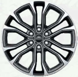
22-inch Machined Aluminum Wheel with Black Noise Pockets (Standard)