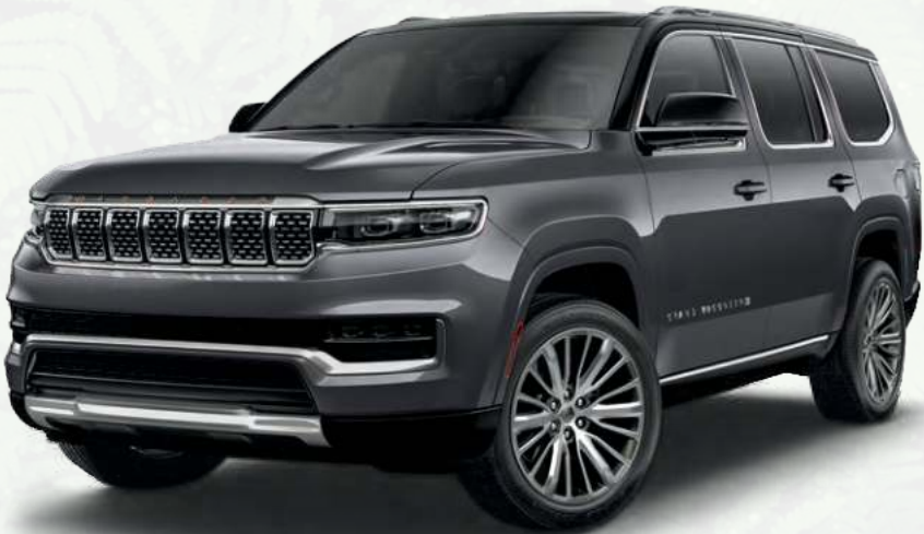
Grand Wagoneer in Baltic Grey Metallic *Limited availability.