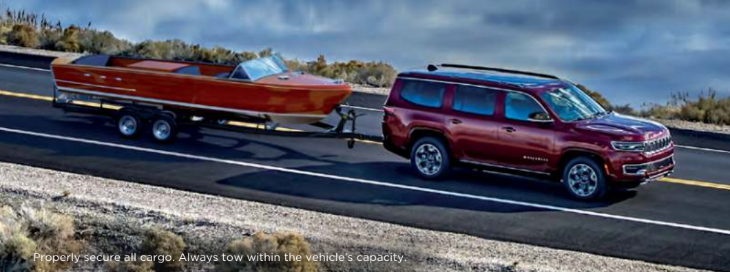
Properly secure all cargo. Always tow within the vehicle's capacity.