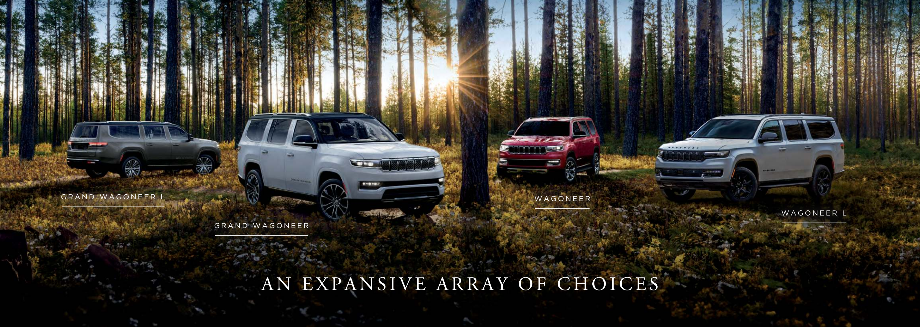
GRAND WAGONEER L