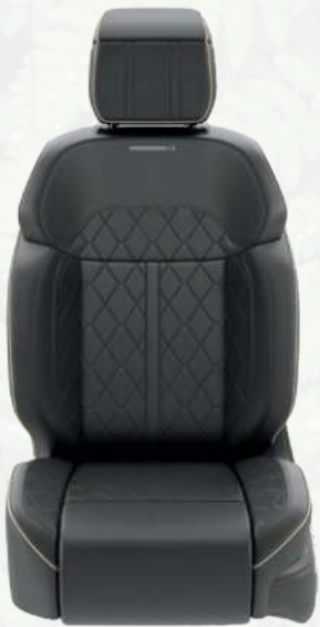
Ventilated Palermo Leather-Trimmed Seat with Quilted Registered Perforations and Global Black/Terra Cotta Accent Stitching with Sea Salt Piping — Global Black (Standard)