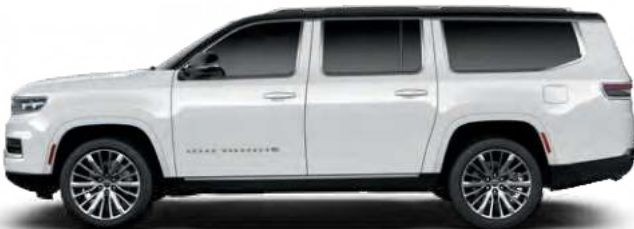
575.8 cm (226.6 in)