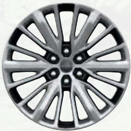
22-inch Polished Aluminum Wheel with Lights Out Pockets (Standard)