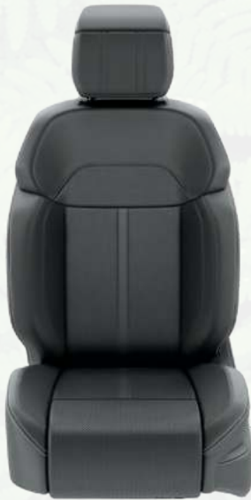
Ventilated Nappa Leather-Trimmed Seat with Axis II Perforations and Global Black/Smoke Accent Stitching — Global Black (Standard)