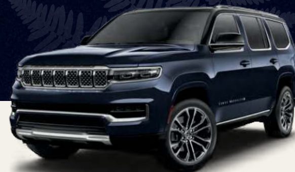
Midnight Sky (Grand Wagoneer exclusive; late availability for Wagoneer)