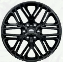
22-inch Aluminum Wheel Painted Gloss Black (Available)