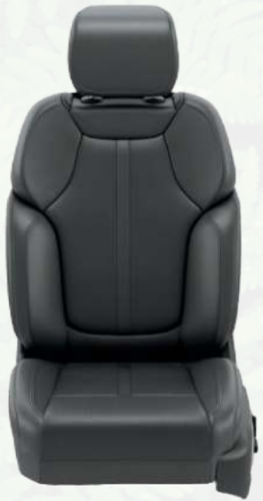
Ventilated Nappa Leather-Trimmed Seat with Axis II Perforations and Global Black/Smoke Accent Stitching — Global Black (Standard)