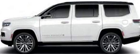
543.3 cm (214.6 in)