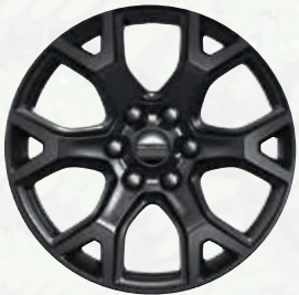
20-inch Aluminum Wheel Painted Gloss Black (Standard)