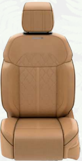
Ventilated Palermo Leather-Trimmed Seat with Quilted Registered Perforations and Tupelo/Terra Cotta Accent Stitching with Global Black Piping — Tupelo (Limited Availability)