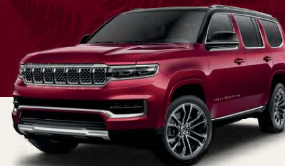
Velvet Red Pearl