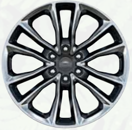
22-inch Polished Aluminum Wheel with Black Noise Pockets (Included with Premium Group)