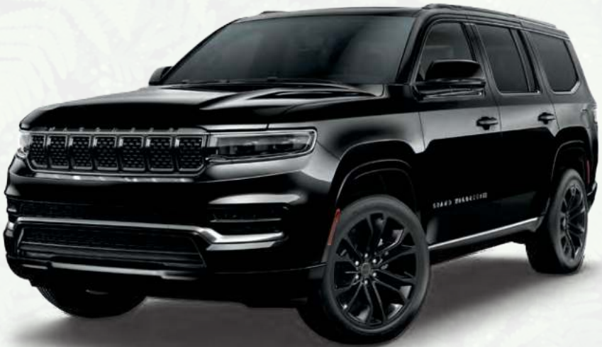
Grand Wagoneer Obsidian in Diamond Black Crystal Pearl