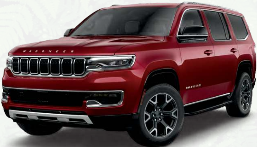
Wagoneer Series III in Velvet Red Pearl