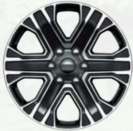
20-inch Machined Aluminum Wheel with Black Noise Pockets (Standard)