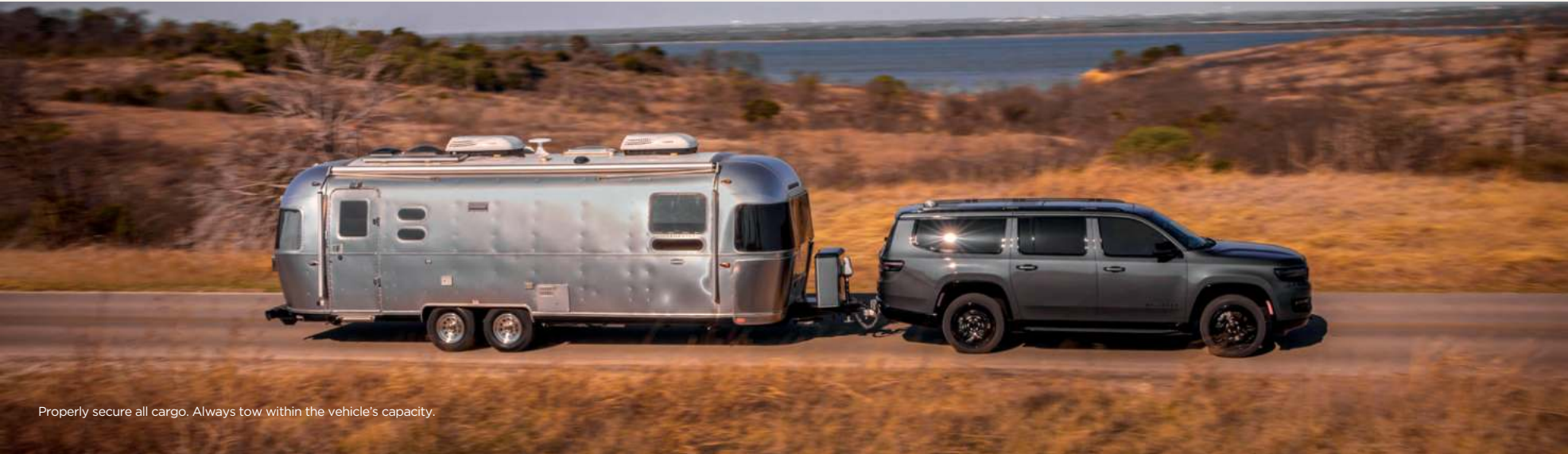
Properly secure all cargo. Always tow within the vehicle's capacity.