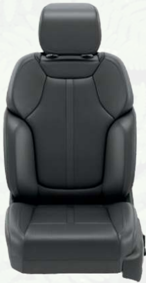
Ventilated Capri Leather-Trimmed Seat with Axis II Perforations and Global Black / Smoke Accent Stitching — Global Black (Standard)