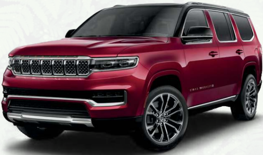
Grand Wagoneer Series III in Velvet Red Pearl