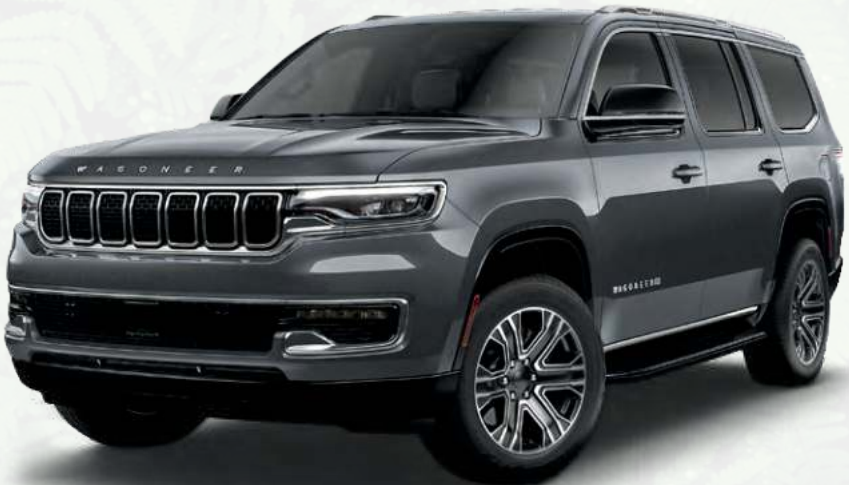
Wagoneer in Baltic Grey Metallic