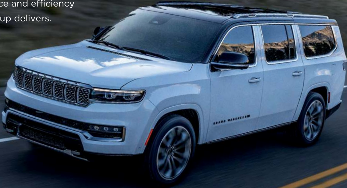
Grand Wagoneer L Series III in Bright White

Experience the power and capability generated through the Hurricane family of turbocharged engines. Whichever model you choose, you'll enjoy the outstanding performance and efficiency the Wagoneer lineup delivers.