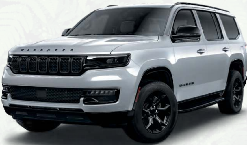
Wagoneer Series II Carbide in Silver Zynith