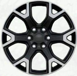
20-inch Machined-Face Painted Aluminum Wheel (Standard)