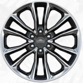
22-inch Polished Aluminum with Black Noise Pockets (Standard with Premium Group)