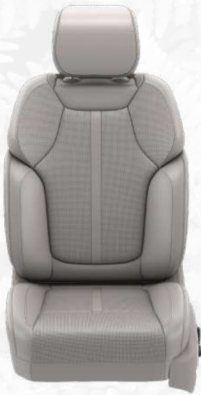
Ventilated Nappa Leather-Trimmed with Axis II Perforations and Sea Salt/Basil Accent Stitching — Sea Salt/Global Black (Standard)