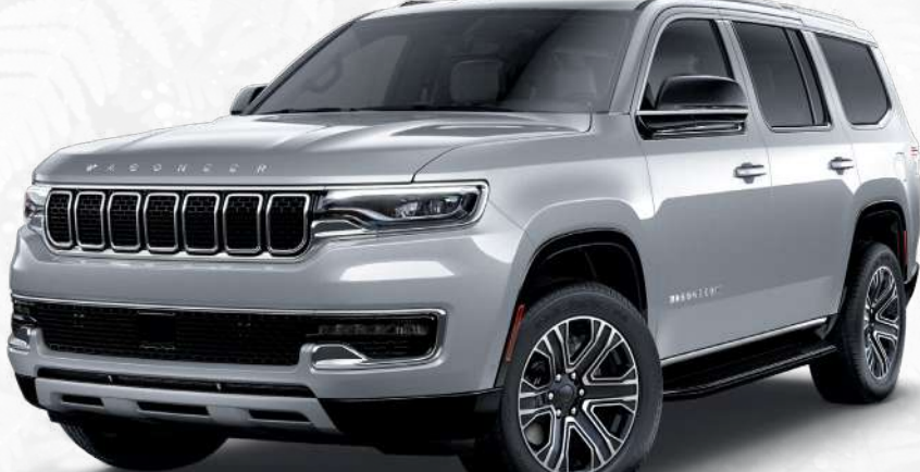
Wagoneer Series II in Silver Zynith