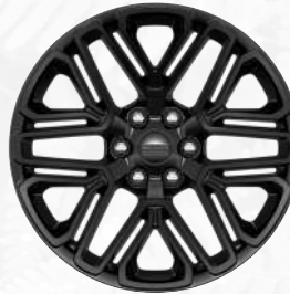
22-inch Aluminum Painted Gloss Black (Standard with Heavy-Duty Trailer-Tow Package; Available with Carbide Package)