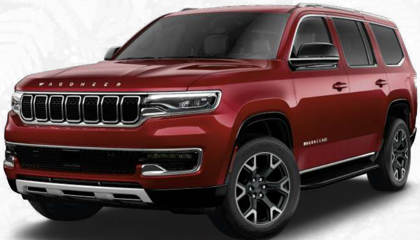
Wagoneer Series III in Velvet Red Pearl