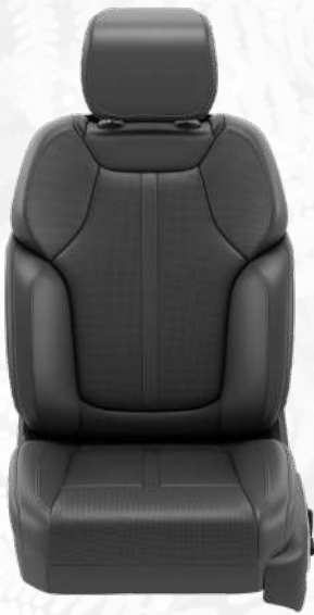
Ventilated Nappa Leather-Trimmed with Axis II Perforations and Global Black/Smoke Accent Stitching — Global Black (Standard)