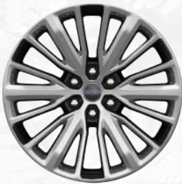
22-inch Polished Aluminum with Lights Out Pockets (Standard)