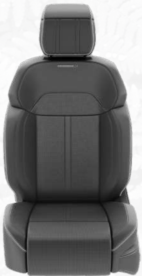
Ventilated Palermo Leather-Trimmed with Registered Perforations and Global Black/Smoke Accent Stitching — Global Black (Standard)