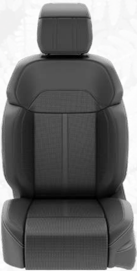
Ventilated Nappa Leather-Trimmed with Axis II Perforations and Global Black/Smoke Accent Stitching — Global Black (Standard)