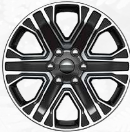
20-inch Machined Aluminum with Black Noise Pockets (Standard)