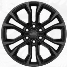
22-inch Gloss Black Aluminum with Black Inserts (Standard)