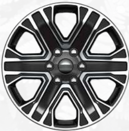
20-inch Machined Aluminum with Black Noise Pockets (Standard)