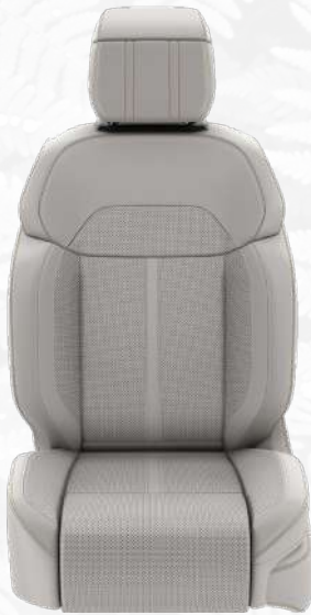
Ventilated Nappa Leather-Trimmed with Axis II Perforations and Sea Salt/Cognac Accent Stitching — Sea Salt/Global Black (Standard)