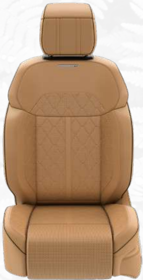
Ventilated Palermo Leather-Trimmed with Quilted Registered Perforations and Tupelo/Terra Cotta Accent Stitching, Global Black Piping — Tupelo/Global Black (Standard)