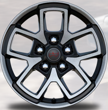
WFV - 17-Inch Machined Painted Black Wheels (Standard on Rubicon)