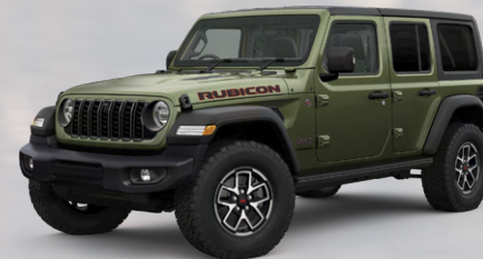
PJ5 - 41 (Option)