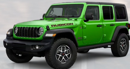
PGE - Mojito (Option)