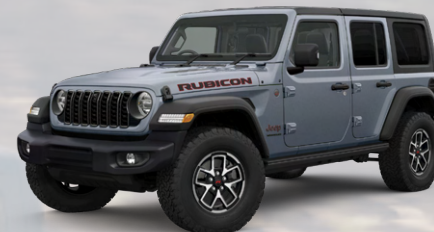
PDS - Anvil (Option)