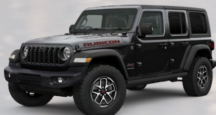
PX8 - Black (Option)