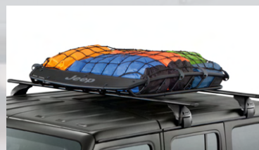
Roof Rack Kit