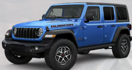
PBJ - Hydro Blue (Option)