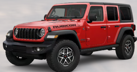
PRC - Firecracker Red (Option)