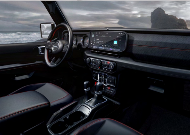
VLX9 - Black Nappa Leather Trimmed Bucket Seats (Standard - Rubicon)

Option (O) Standard (S) Not Available (-)