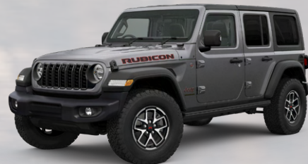
PAU - Granite Crystal (Option)