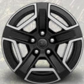
18-inch Machined-Face Aluminum Wheels with Painted Pockets (Standard)