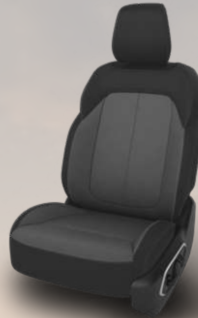
Soul and Soulmate Cloth with Labrinth Embossed Seats and Light Tungsten Accent Stitching — Global Black (Standard)