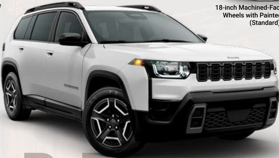
Cherokee in Bright White