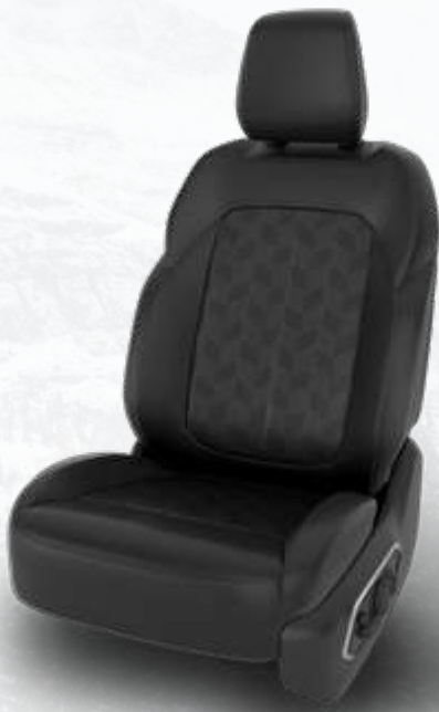
Capri Leatherette Seats with Axis II and Apex Perforations with Cognac Accent Stitching – Global Black (Standard)