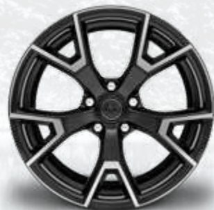
20-inch Machined-Face Aluminum Wheels with Painted Pockets (Standard)