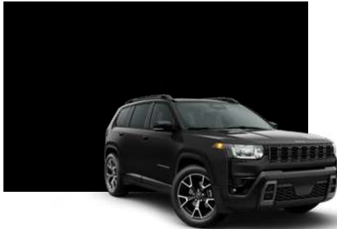
Diamond Black Crystal Pearl