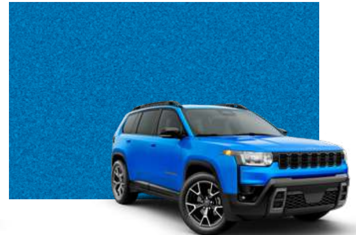
Hydro Blue Pearl

*Colors may not be available on all models and may be limited/restricted.