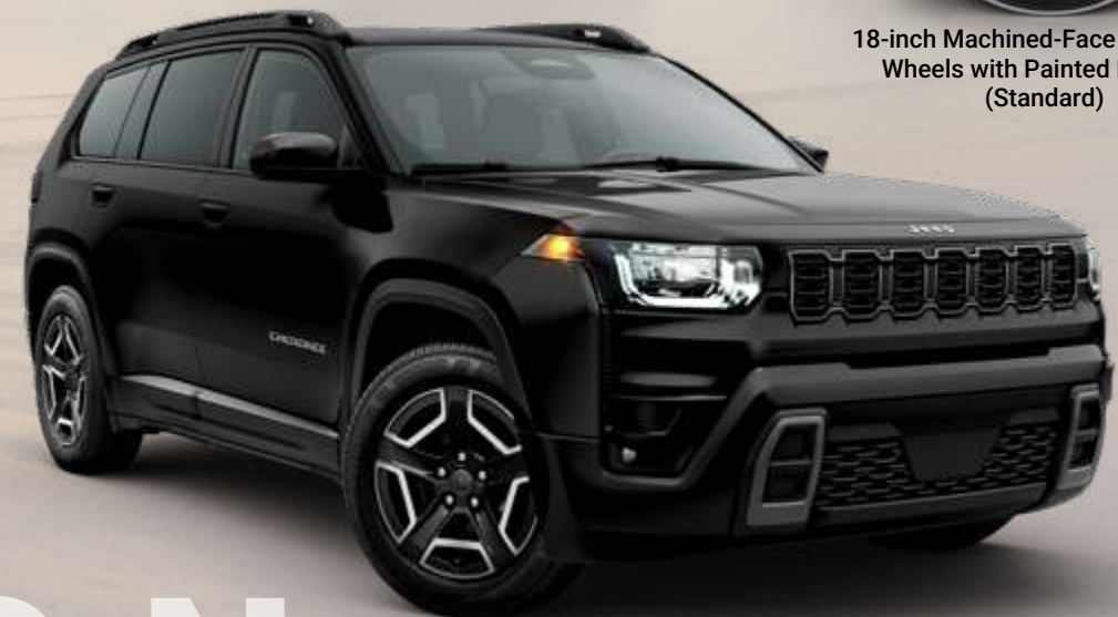
Laredo in Diamond Black Crystal Pearl