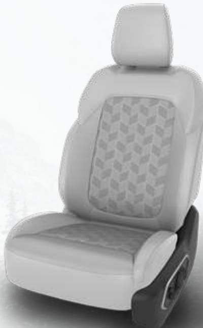
Capri Leatherette Seats with Axis II and Apex Perforations with Cognac Accent Stitching – Global Black /Arctic (Standard)