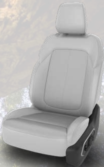
Capri Leatherette and Axis II Perforated Seats with Cognac Accent Stitching — Global Black/Arctic (Standard)