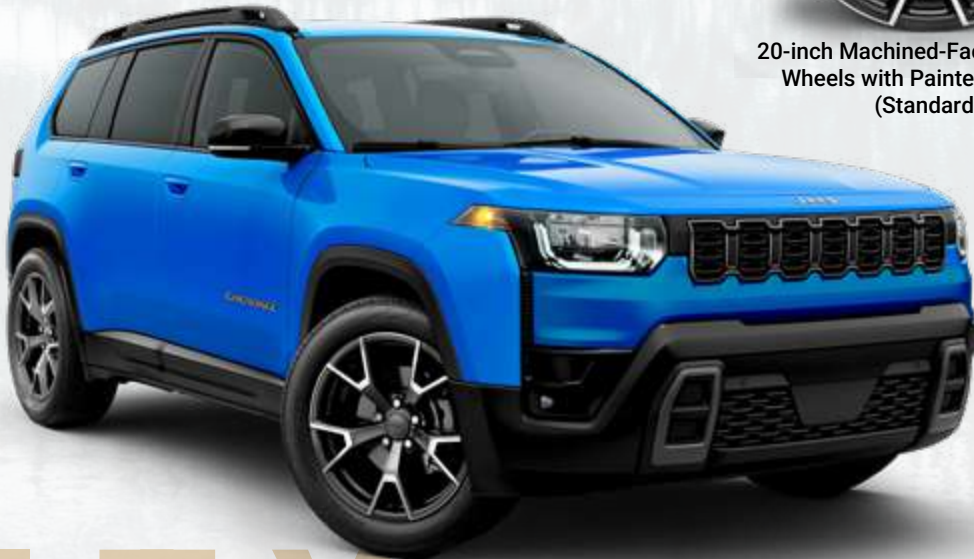
Overland® in Hydro Blue Pearl