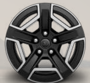
18-inch Machined-Face Aluminum Wheels with Painted Pockets (Standard)