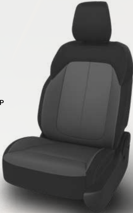
Soul and Soulmate Cloth Seats with Light Tungsten Accent Stitching — Global Black (Standard)