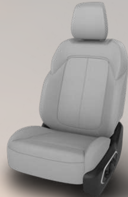
Soul and Soulmate Cloth with Labrinth Embossed Seats and Light Tungsten Accent Stitching — Global Black / Arctic (Standard)