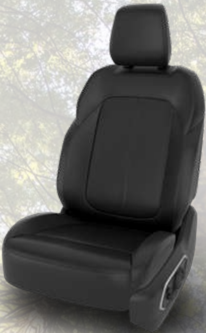
Capri Leatherette and Axis II Perforated Seats with Cognac Accent Stitching — Global Black (Standard)