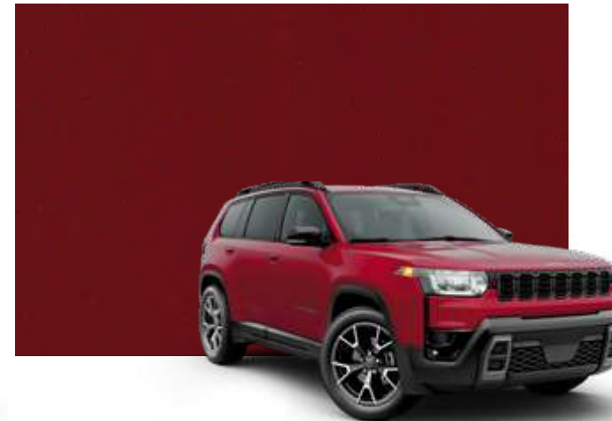
Red Hot Pearl