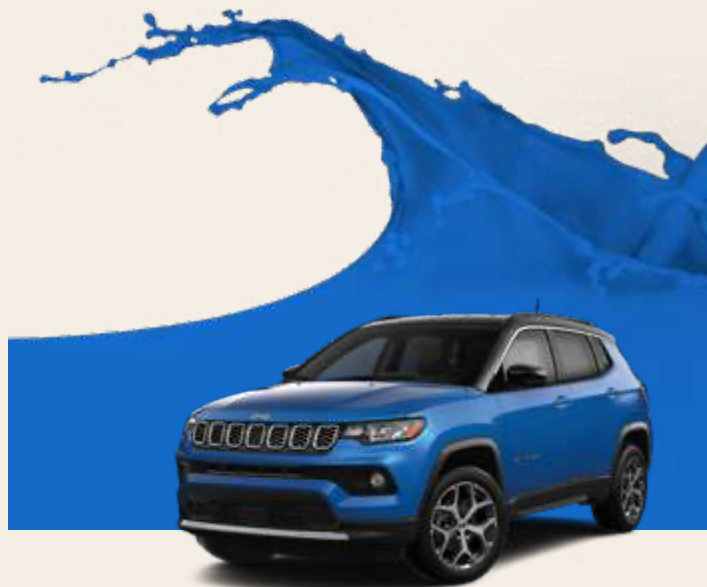
Hydro Blue Pearl