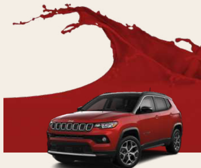
Red Hot Pearl