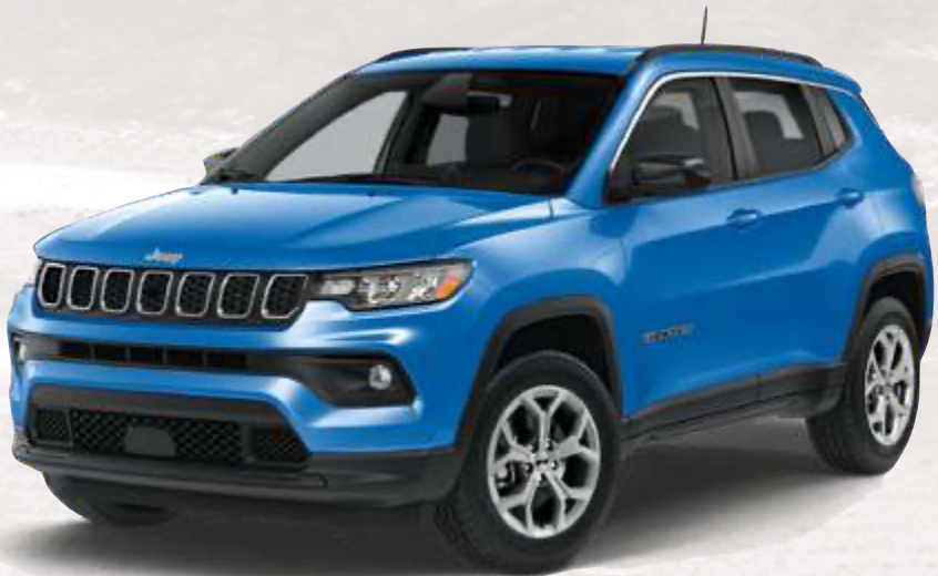
Latitude in Hydro Blue Pearl