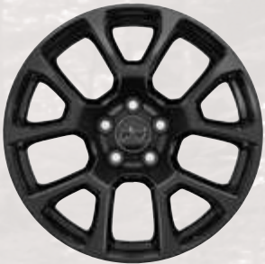
18-inch Gloss Black-painted aluminum (standard with Altitude Special Edition)