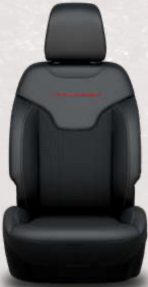
McKinley leather-trimmed and Spectre cloth with embroidered Trailhawk logo and Ruby Red and Tungsten dual accent stitching — Black (standard)