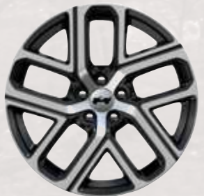
19-inch Diamond-Cut aluminum with Gloss Black pockets (standard with Elite Group)