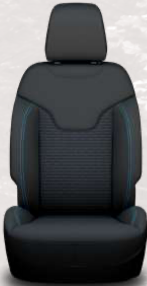
Sedoso and Kimberlite cloth with Bright Blue accent stitching — Black (standard)