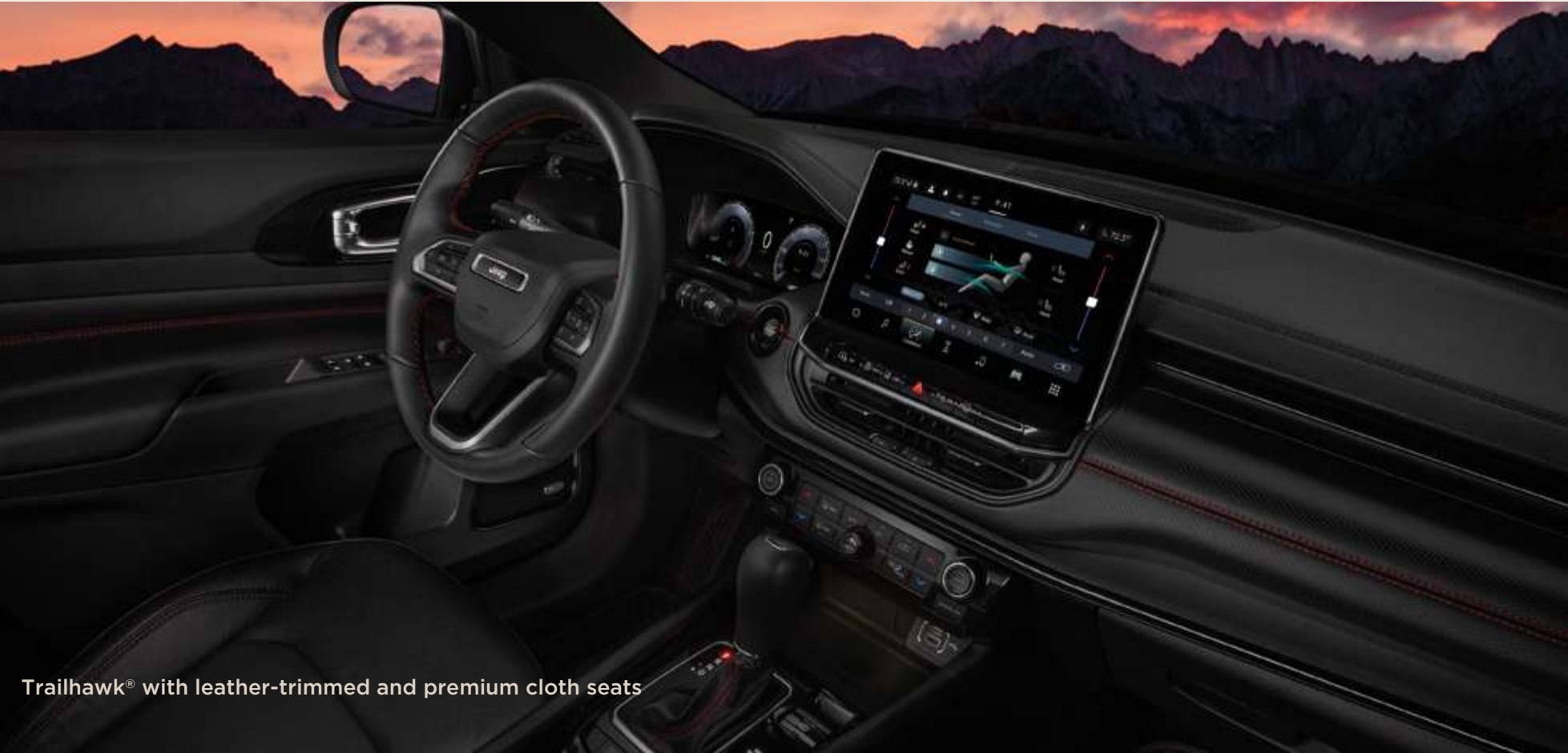
Trailhawk® with leather-trimmed and premium cloth seats