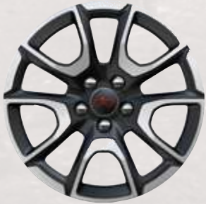
17-inch Diamond-Cut aluminum with Satin Black pockets (standard)