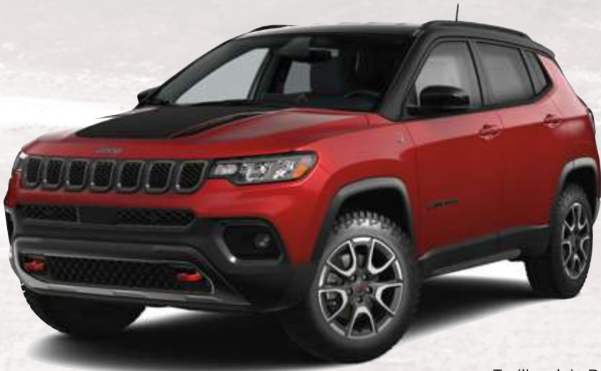
Trailhawk in Red Hot Pearl