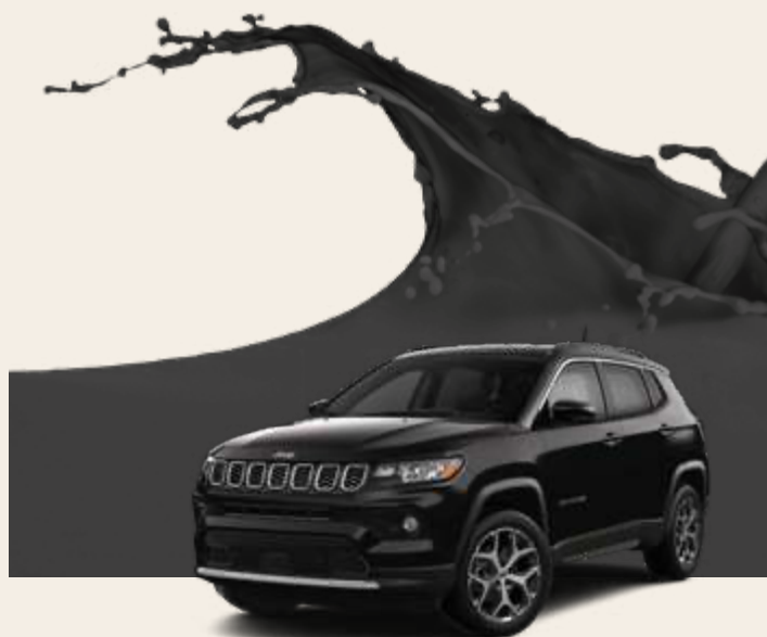
Diamond Black Crystal Pearl