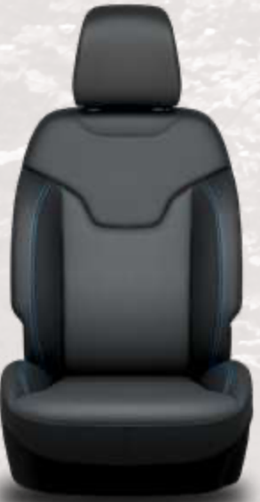
Ventilated McKinley leather-trimmed with Bright Blue accent stitching — Black/Gray (standard with Elite Interior Group High Altitude)