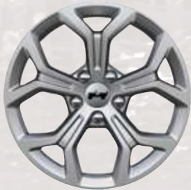
17-inch Fine Silver-painted aluminum (standard)