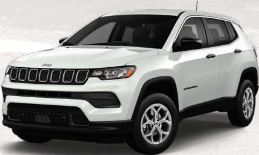
Sport in Bright White