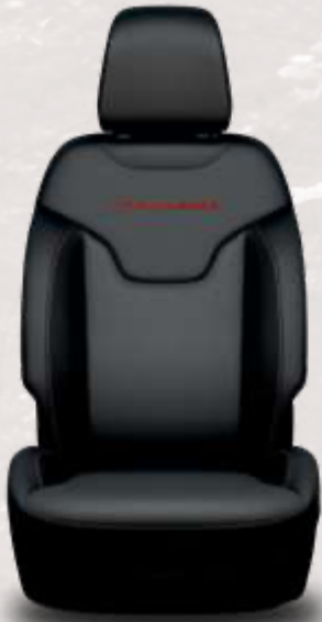
Ventilated McKinley leather-trimmed with embroidered Trailhawk logo and Ruby Red and Tungsten dual accent stitching — Black (available with Trailhawk Elite Group)