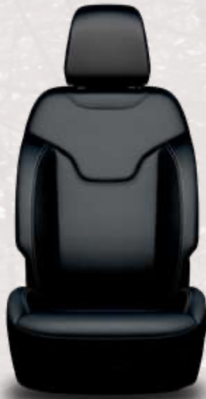
McKinley leatherette with Steel Gray accent stitching — Black/Gray and Black/Sepia (standard)