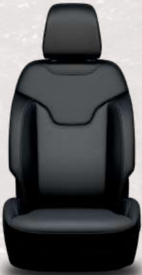
Ventilated McKinley leather-trimmed with Steel Gray accent stitching — Black/Gray and Black/Sepia (standard with Elite Group)