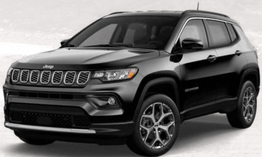
Limited in Diamond Black Crystal Pearl