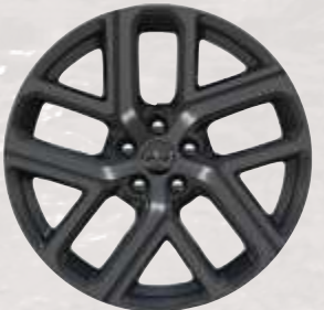
19-inch Satin Granite Crystal-painted aluminum (standard with High Altitude Package)