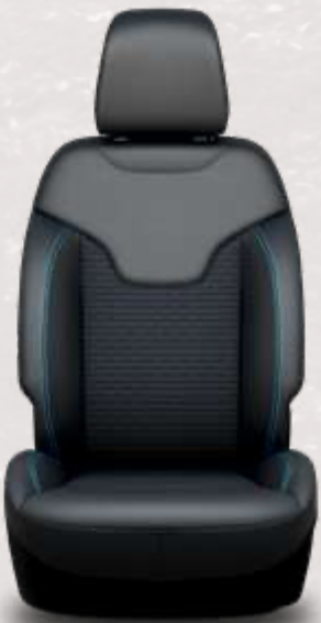
McKinley vinyl and Kimberlite cloth with Bright Blue accent stitching — Black (standard)