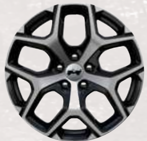
18-inch Diamond-Cut aluminum with Gloss Black pockets (standard)