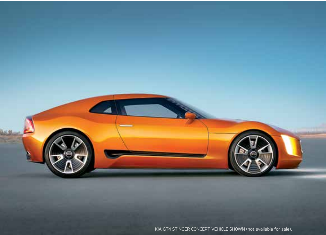
KIA GT4 STINGER CONCEPT VEHICLE SHOWN (not available for sale).

COMPELLING DESIGN Kia vehicles have captured worldwide attention for their interior and exterior styling, which represents the collaborative work of designers who have created a look that makes every Kia recognizable at first sight. Today, the lineup consists of vehicles that fill owners as well as Kia’s designers with pride.