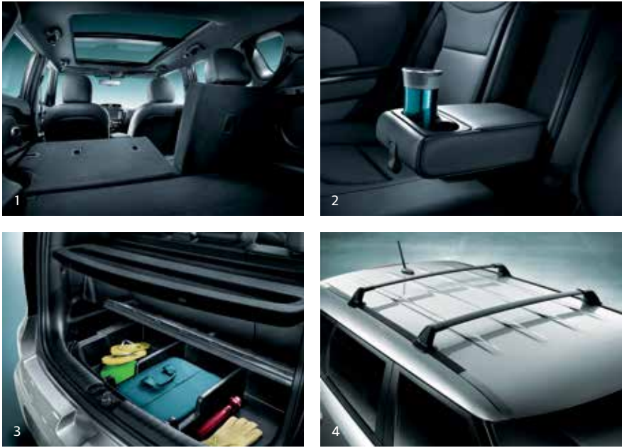
1. 60/40 SPLIT-FOLDING REAR SEATS Conveniently carry longer items, passengers — or a combination of both — by folding down one or both of the rear seats. 2. REAR-PASSENGER COMFORT The rear seat has room for three passengers or two passengers and a flip-down center armrest with dual cupholders. 3. CONCEALED STORAGE The floor of the cargo area flips up to reveal a hidden compartment for securely carrying smaller items. In addition, a cargo cover on + ( plus ) and ! ( exclaim ) models will keep your things out of view. 4. ROOF-RACK READY To carry even more gear, an accessory roof-rack is available. † The rack's mounting points are flush with the roofline to maintain a streamlined exterior design when the rack is not installed.

Soul lets you carry all the cargo you need to suit your lifestyle with an expansive 24.2 cu. ft. of available space. It's also remarkably versatile thanks to 60/40 split-folding rear seats. An easy-open liftgate provides quick access to the roomy cargo area, which also includes a handy, hidden storage compartment with built-in dividers.