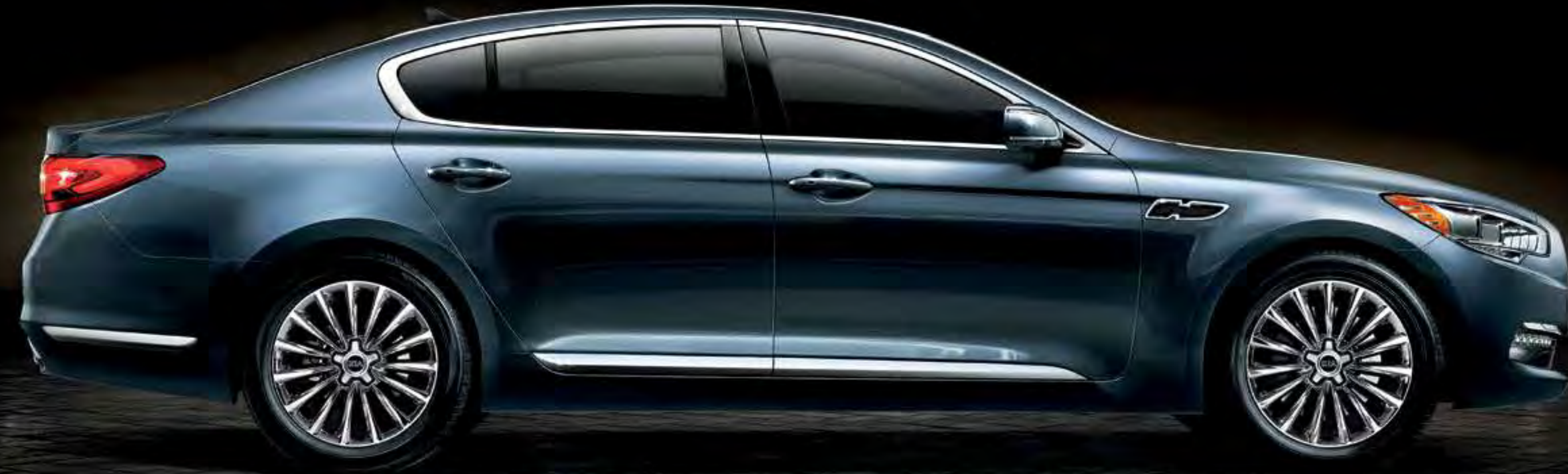
K900 V8 SHOWN