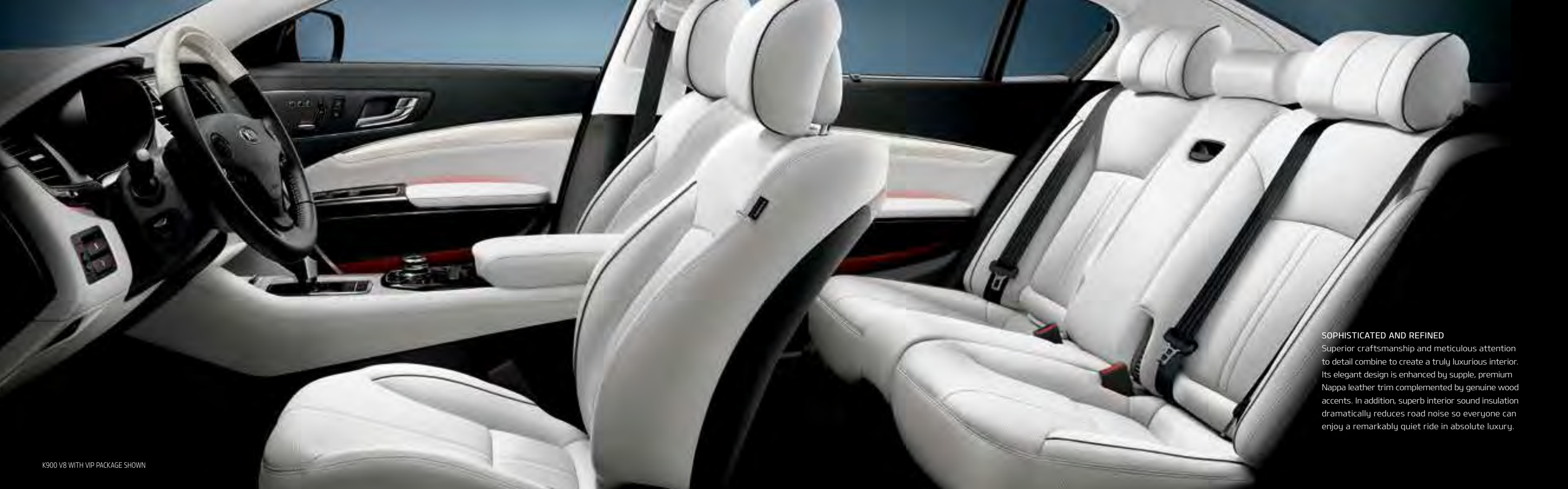
K900 V8 WITH VIP PACKAGE SHOWN