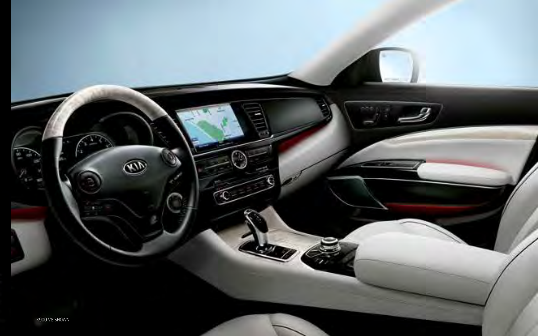
K900 V8 SHOWN