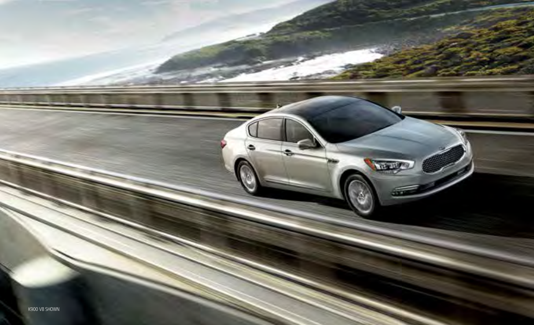
K900 V8 SHOWN