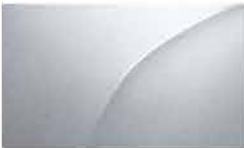
Sterling (M) GC/GL/CBL