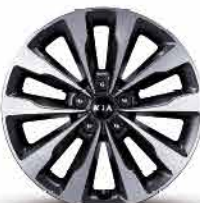
18" machined-finish alloy wheels (SX, SX+)