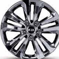
19" chrome alloy wheels (SXL, SXL+)