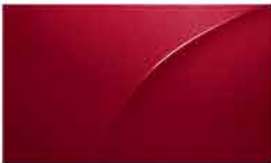
Merlot (M) GC/GL/BBL