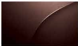
Titanium Brown (M) GC/GL/BBL