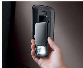
PORTABLE FLASHLIGHT. An available rechargeable flashlight in the cargo area has dual functions. Mounted in its place, it automatically lights the cargo area when the hatch is opened. It is also easy to detach for use as a portable flashlight.