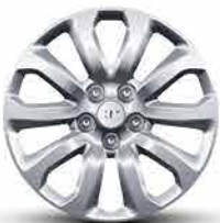
17" steel wheels with cover (L)

M = Metallic, P = Pearl. The exterior and interior colours in this brochure are as close to the actual vehicle production colours as the printing process allows.