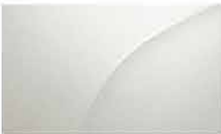
Snow White Pearl (P) GC/GL/BBL