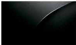
Aurora Black GC/GL/CBL