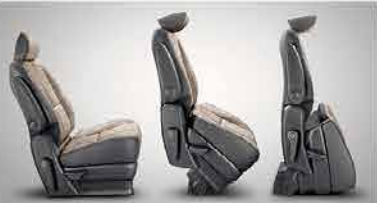
UNIQUE SLIDE-N-STOW SEAT DESIGN. When you need more cargo area, you can take advantage of the available 10 second-row seats' innovative stand-up design. Simply flip a lever to stand the seats upright, where they stay locked in place. Third-row seats conveniently fold down into the floor, and they also feature a versatile 60:40 split-fold design, giving you the option of carrying a combination of passengers and cargo.