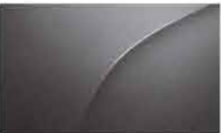
Graphite (M) GC/GL/BBL