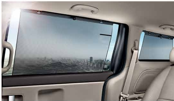
SECOND- & THIRD-ROW SUNSHADES. Rear-seat passengers can enjoy a cool and comfortable drive with available side-window sunshades.

Sedona is remarkably versatile, with a spacious cargo area and a number of innovative features designed for everyday convenience. An available Smart-Power Liftgate opens automatically if you simply stand next to it for three seconds with the available Smart Key in your possession — which is especially helpful when you have your hands full. Plus, the Liftgate automatically retracts if it meets resistance, and you can set it to open and hold at different heights.