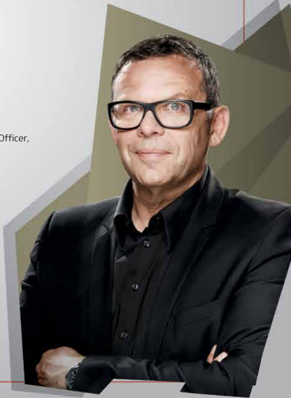
PETER SCHREYER President and Chief Design Officer, Kia Motors Corporation

To ensure that the all-new 2015 Kia Sedona exceeds the highest standards of design, technology and quality, Peter Schreyer — one of the world's top 3 automotive designers — thoroughly oversees every aspect in its design direction. For Schreyer, each element should bear the 'absolute purity' in order to create the design as a whole. The 'simplicity' philosophy is at the core of Kia's creative language.