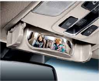
CONVERSATION MIRROR. A specially designed rearview mirror in the upper console allows driver and front passenger to clearly see rear-seat passengers without having to turn around in their seats.