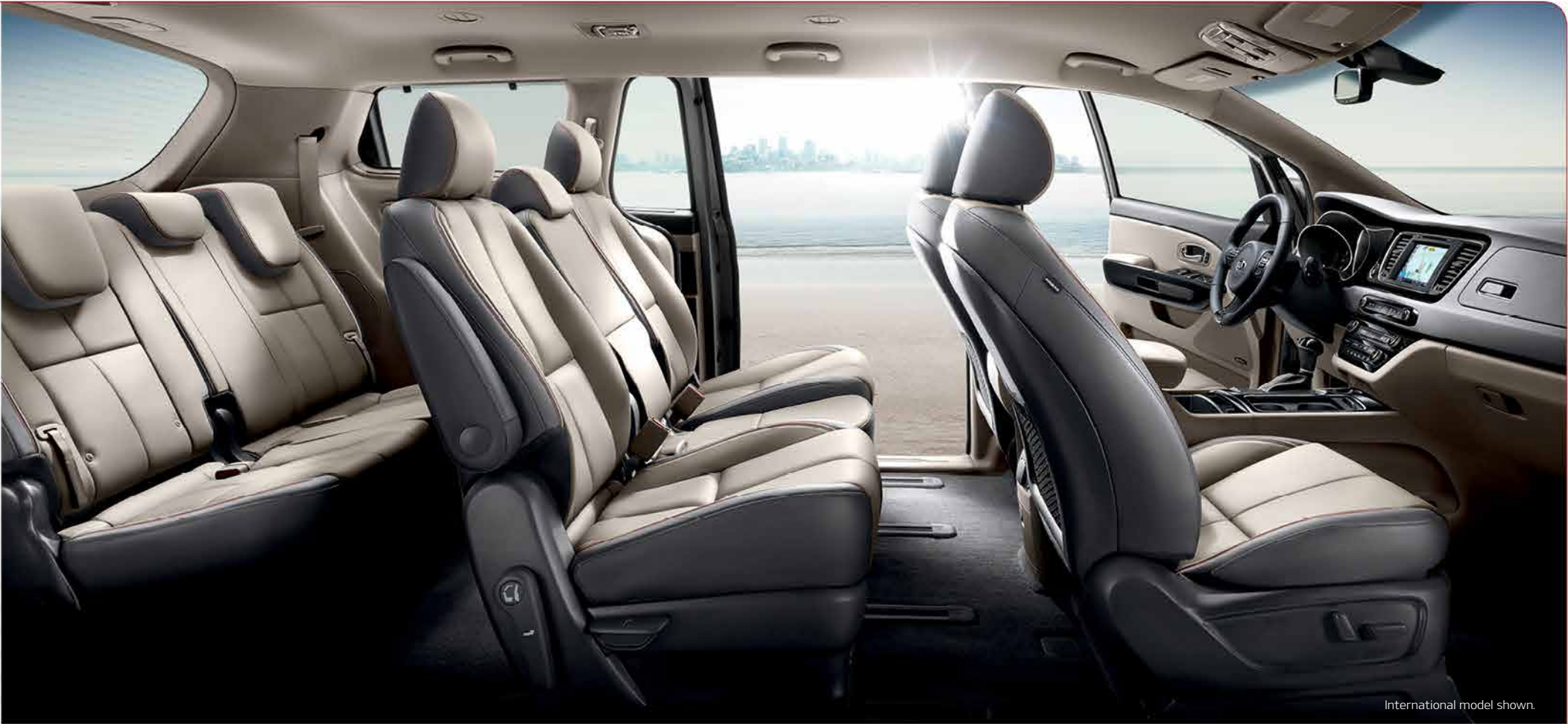
International model shown.