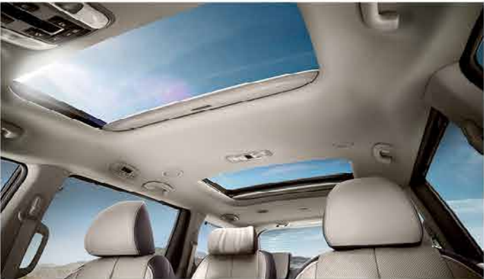
DUAL SUNROOF. Front and rear sunroofs on Sedona SXL models let you enjoy a feeling of spaciousness and fill the cabin with fresh air. They also feature dual sliding sunshades that are quick and easy to open and close.

Sedona's interior adapts to your lifestyle, beginning with a choice of available seven- or eight-passenger seating. Either way, you can configure the second- and third-row seats to carry passengers in comfort or stow extra cargo. Available tri-zone air conditioning lets you select separate climate zones, while an available 8-way power-adjustable driver's seat with 4-way power lumbar support and available eight-way power-adjustable front passenger seat provide added comfort.