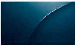
Midnight Sapphire (M) GC/GL/CBL