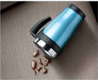
STAIN-RESISTANT CLOTH. Sedona's cloth seating features repel-and-release YES Essentials ®3 technology for stain resistance so even messy spills clean up easily. Plus, advanced fibers help eliminate lingering odours that moisture can leave behind.