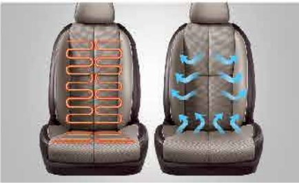
HEATED AND COOLED SEATS. Available heated front and rear seats help ensure comfortable driving in cold weather. Enjoy optimal comfort in warm weather with available air-cooled front seats that circulate cool air through perforations in the seat leather.