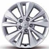
17" alloy wheels (LX, LX+)