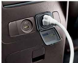
115V POWER INVERTER. With Sedona's handy, available 115V power inverter, you can plug electronic devices — from your laptop computer to a portable gaming console — right into an electrical power outlet.