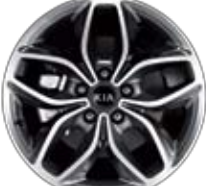
18" alloy D-type wheel 225/40R18 (for 1.6 T-GDI)