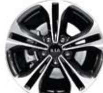
17" alloy wheel 215/45R17