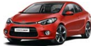
Racing Red (DRR)