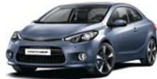
Planet Blue (D7U)