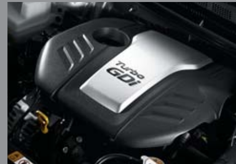
Gamma 1.6 T-GDI