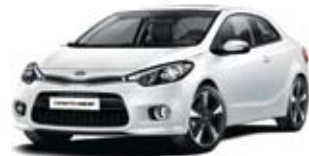
Clear White (UD)