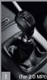
1 (for 2.0 MPI)

1. 6-speed manual transmission Designed for smooth and effortless gearshifts, this manual transmission offers great durability and fuel efficiency. 2. 6-speed automatic transmission This compact and lightweight unit features an electronic shift-lock function for enhanced safety. 3. Paddle shifters Normally found only on premium sports cars, paddle shifters on the steering wheel allow for lightning quick gear changes with the simple flick of your fingers. 4. Auto cruise control With the press of a switch conveniently located on the steering wheel, auto cruise control lets you maintain a constant speed for improved fuel economy and a less fatiguing drive.