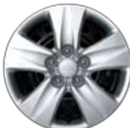
16" steel wheel 205/55R16