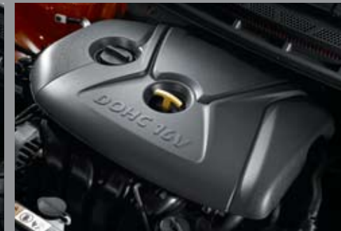
Nu 2.0 MPI