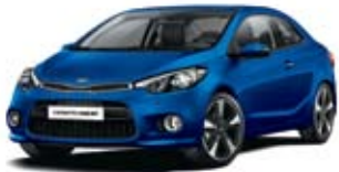
Abyss Blue (K3U)