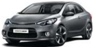
Metal Stream (MST)