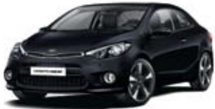
Aurora Black (ABP)