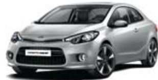
Bright Silver (3D)