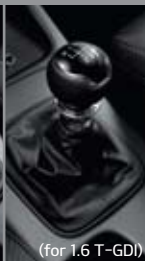
(for 1.6 T-GDI)