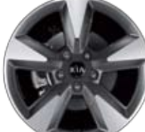
18" alloy C-type wheel 225/40R18