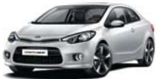
Snow White Pearl (SWP)