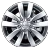
16" alloy wheel 205/55R16