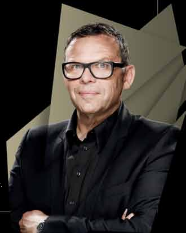
PETER SCHREYER President and Chief Design Officer, Kia Motors Corporation

"Today, cars are no longer just a means of transport but also expressions of lifestyles," Schreyer notes. "Cars are an essential part of our lives, and increasingly more emphasis is being put on their emotional value in terms of bringing us happiness and satisfaction."