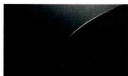
Aurora Black (P) BC / BL / CL