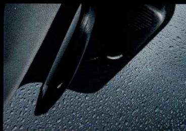
RAIN SENSING WIPERS. The windshield wipers are automatically activated as soon as moisture is detected for greater convenience and visibility. Standard on Rio SX models.