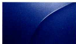
Tanzanite Blue (P) BC / BL