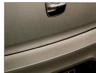
Rear bumper applique

Kia Genuine Parts and Accessories are engineered by Kia and installed by professionals at your Kia dealer. For more information on the full line of available Genuine Kia Parts and Accessories, see your local Kia dealer, visit www.kia.ca or call 1-877-542-2886.