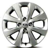
15" Alloy wheel