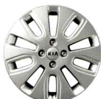
16" Alloy wheel