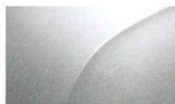
Sterling (M) BC / BL