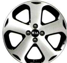
17" Alloy wheel