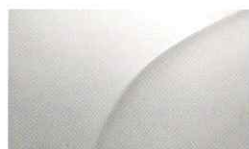
Polar BC / BL / BEL