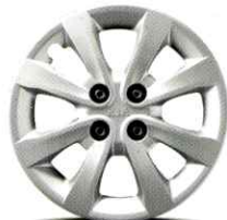
15" Steel wheel with full cover