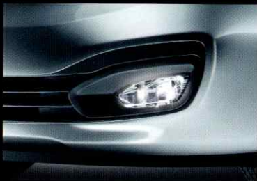
LIGHTING. Fog lights make it easier to see – and be seen – in the dark of night or in inclement weather. Standard on Rio EX and SX models.