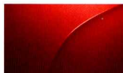
Chili (P) BC / BL