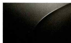
Graphite (P) BC / BL