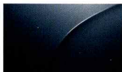
Midnight Sapphire (P) BC / BL / BEL