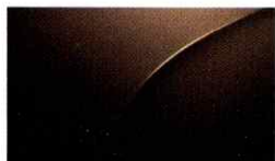
Chestnut (P) BC / BL