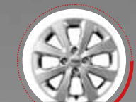
15-inch alloy wheel