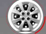
15-inch steel wheel