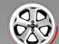
17-inch alloy wheel